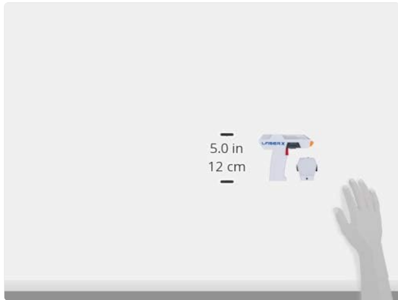
Image: A visual representation of the compact size of the LASER X Micro Blaster compared to a human hand.