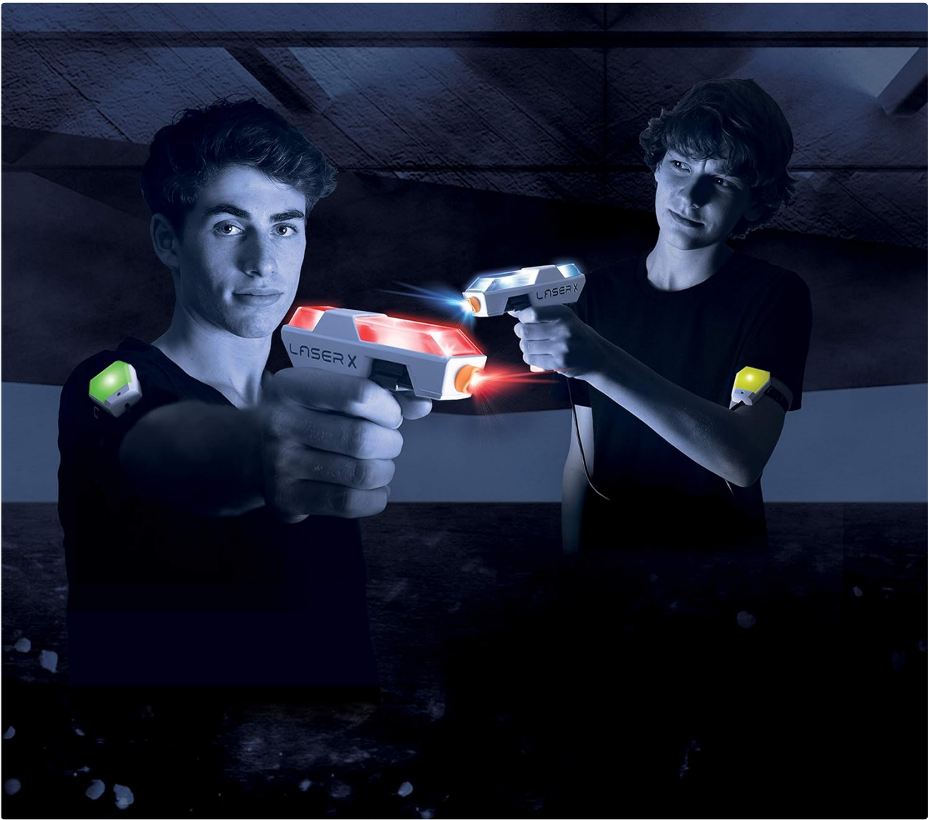
Image: Two players engaged in a laser tag game, demonstrating how the arm receivers are worn.