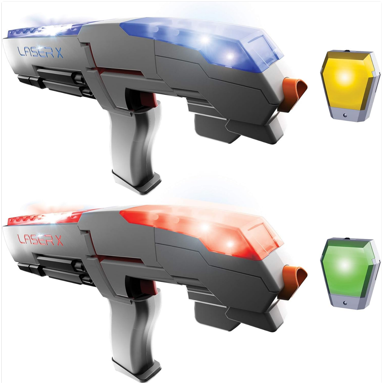
Image: A close-up of the LASER X Micro Blasters showing their illuminated sections, indicating active play.