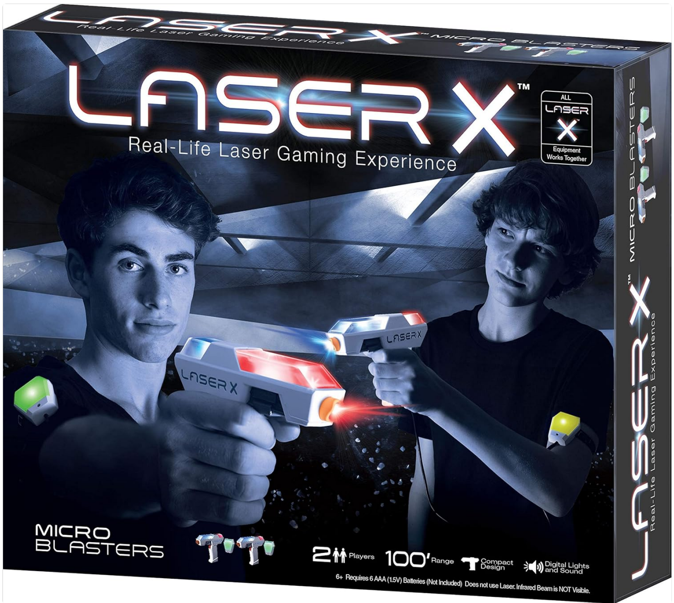
Image: The product packaging for the LASER X Two Player Laser Gaming Set, featuring two individuals holding the micro blasters.