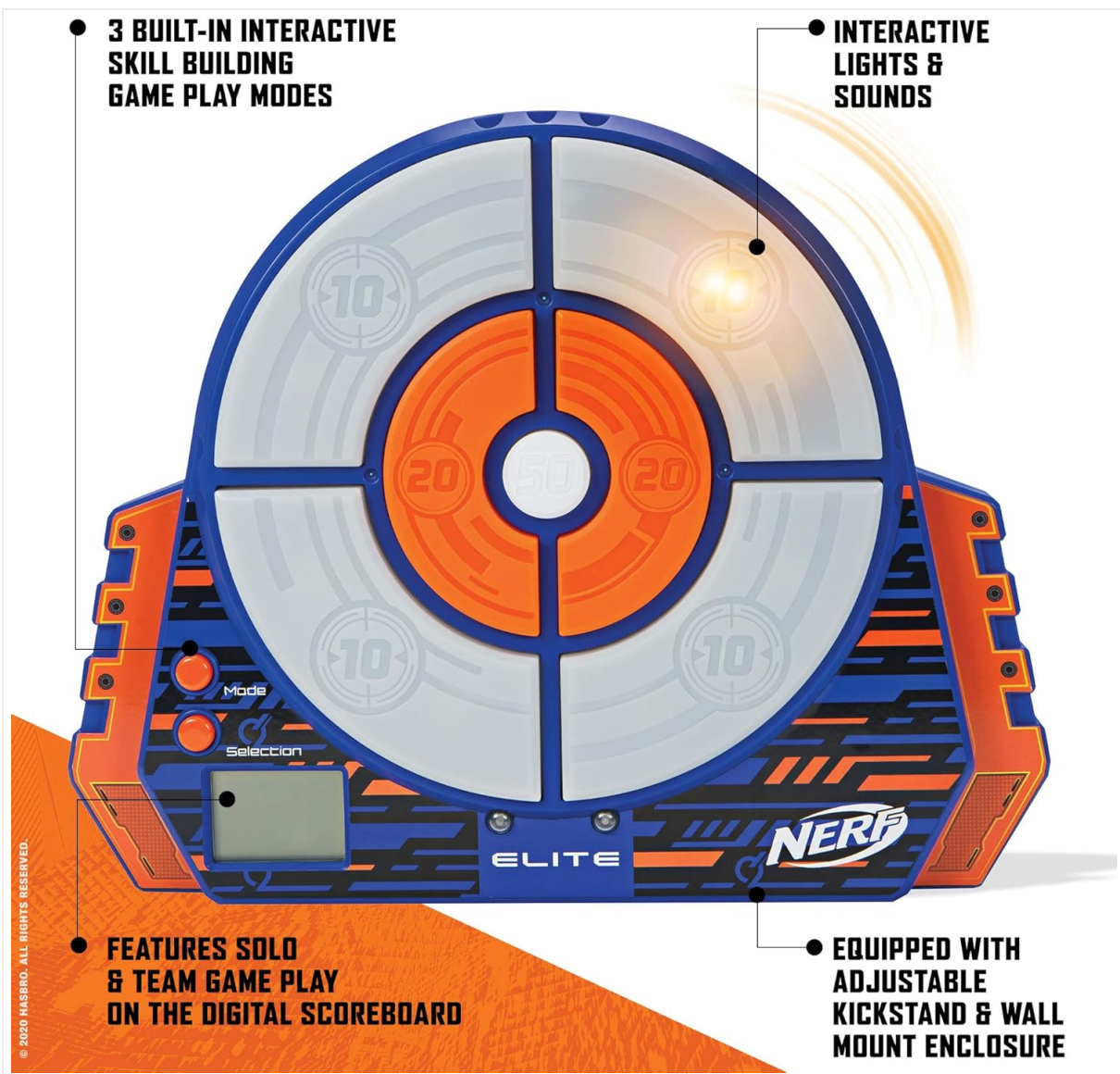
Figure 3: Diagram highlighting the interactive lights & sounds, digital scoreboard, and adjustable stand/wall mount options.