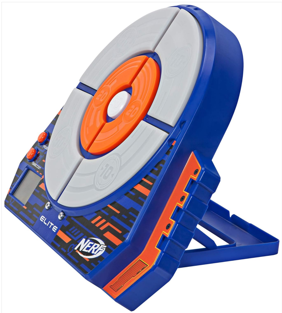
Figure 2: Side view of the target showing the adjustable kickstand extended for tabletop use.