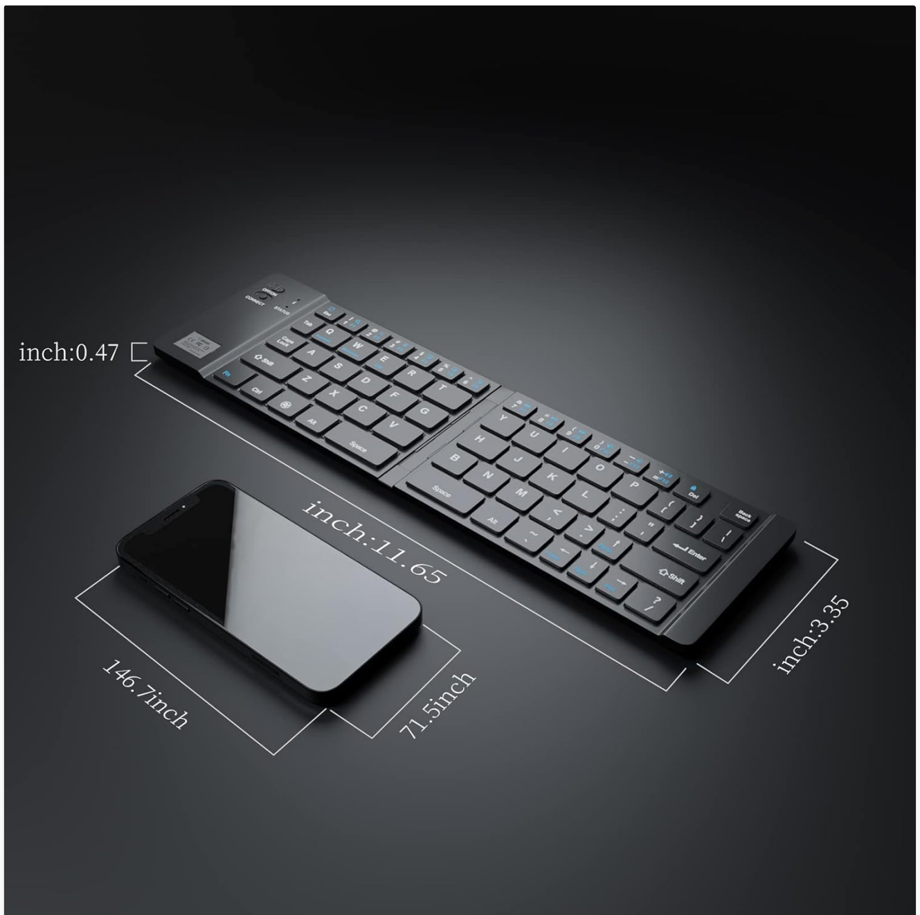
Image: The Geyes GK-228 keyboard with its dimensions clearly marked, showing its compact size when unfolded.