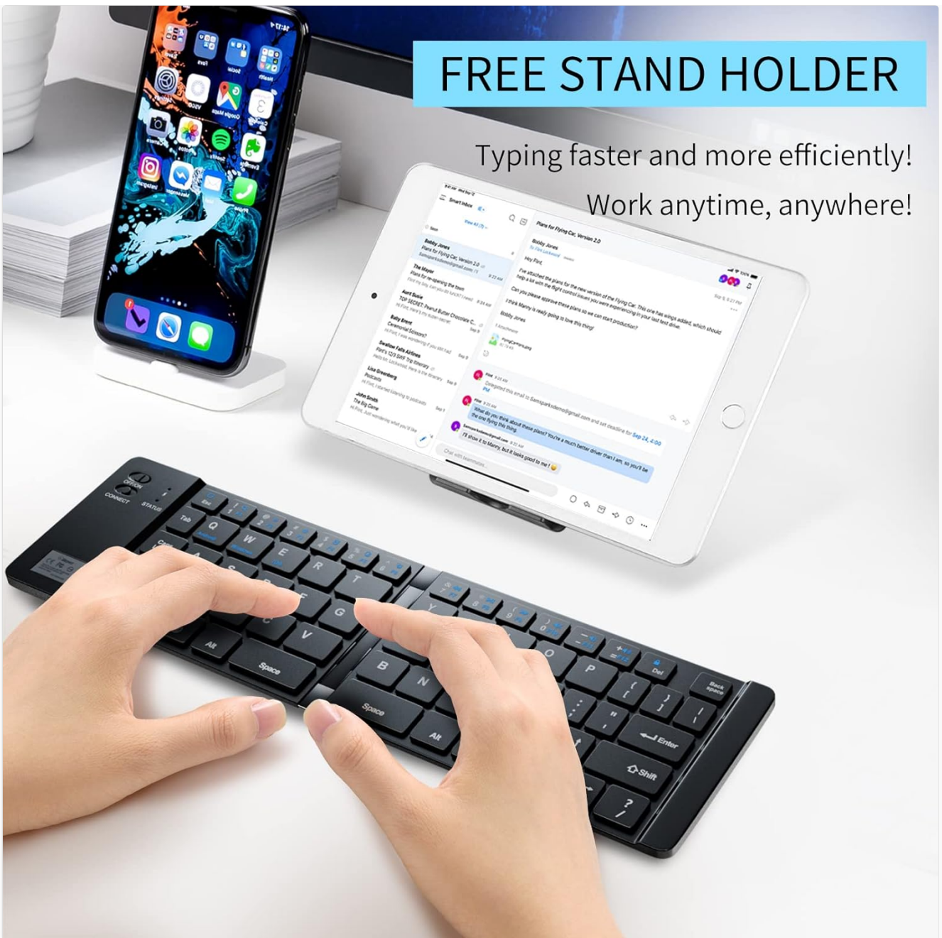
Image: A user typing on the Geyes GK-228 keyboard with a tablet positioned in the included stand holder, demonstrating a typical usage scenario.

Typing faster and more efficiently! Work anytime, anywhere!