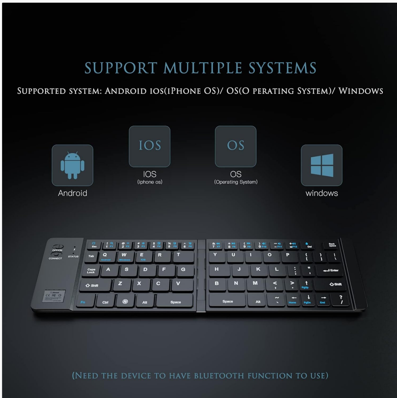
Image: The Geyes GK-228 keyboard displaying compatibility with Android, iOS, and Windows operating systems, highlighting its versatility.

Fn + 1 for the first device and Fn + 2 for the second device to assign them to different channels.