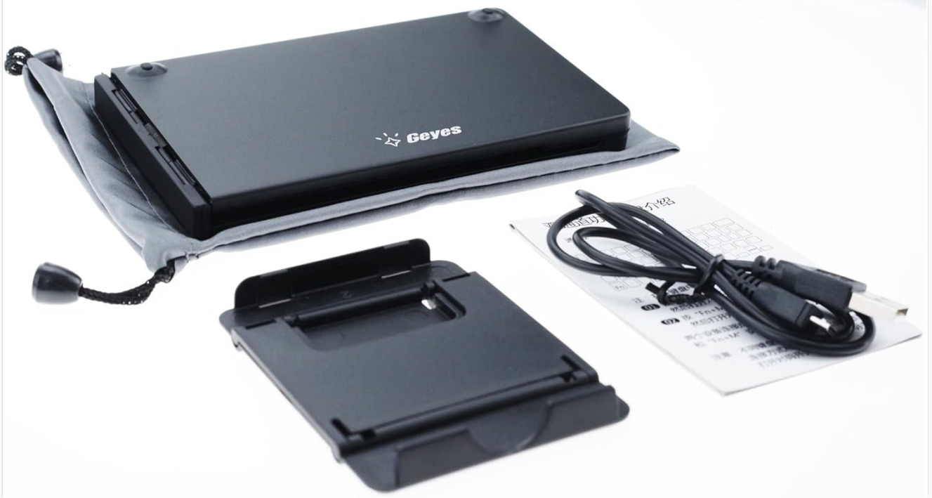
Image: The Geyes GK-228 Foldable Bluetooth Keyboard, USB charging cable, and stand holder, as included in the product package.