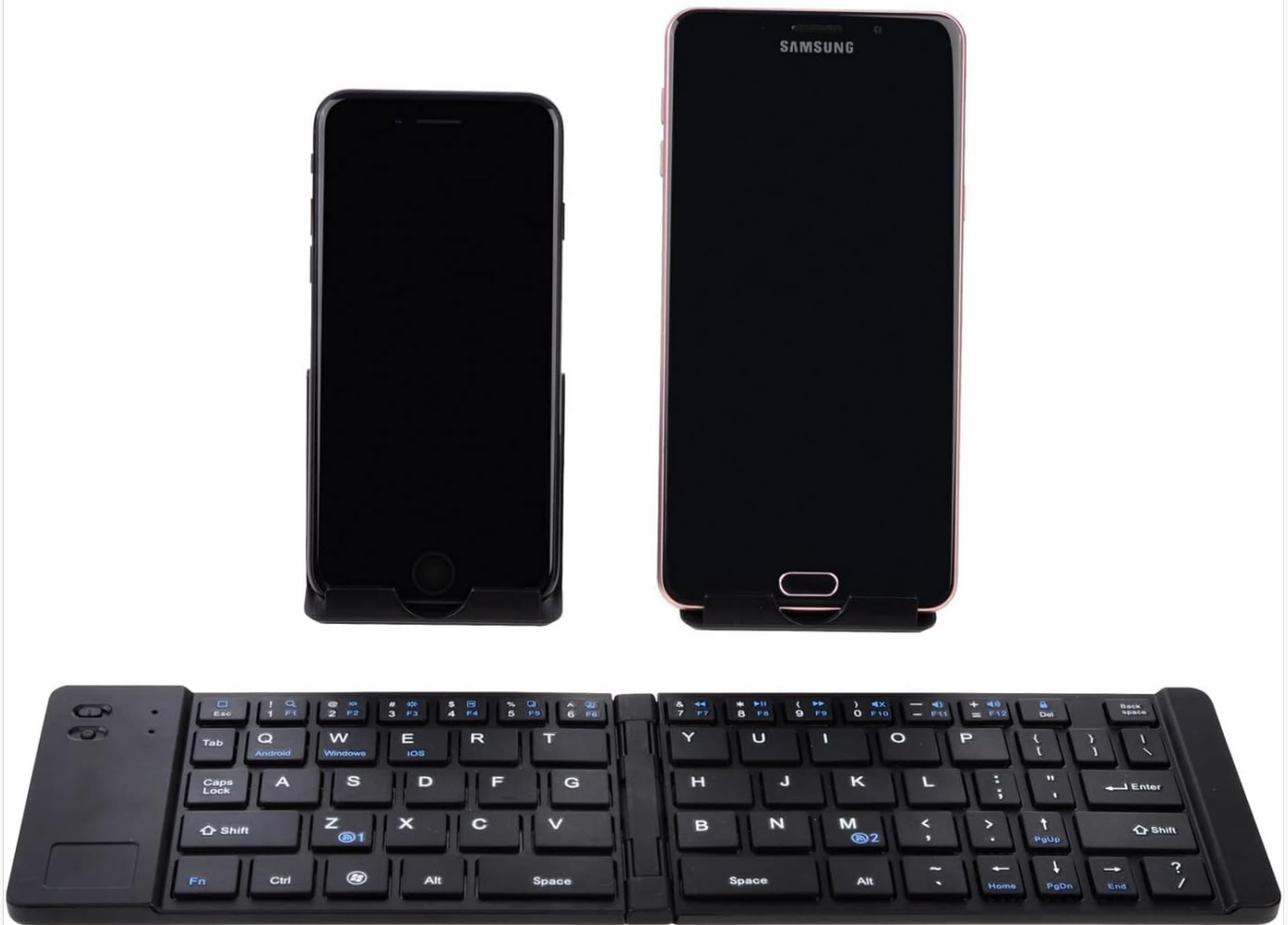
Image: The Geyes GK-228 keyboard positioned in front of two smartphones, illustrating its dual-channel capability for seamless switching between devices.

Supports dual channel free switching of two devices