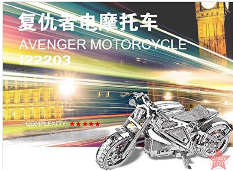
Image: The product packaging for the MoTu Avenger Motorcycle 3D Metal Puzzle Model I22203. This box contains the metal sheets and instructions required for assembly.