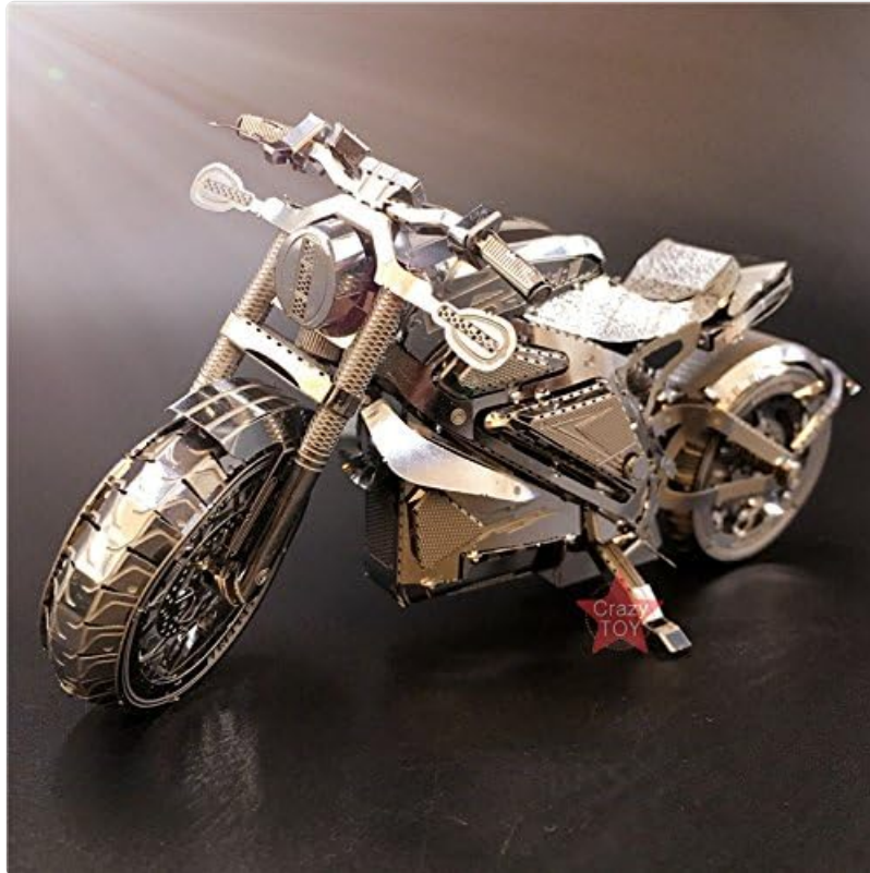
Image: The fully assembled MoTu Avenger Motorcycle 3D Metal Puzzle Model I22203, showcasing its intricate details and metallic finish.