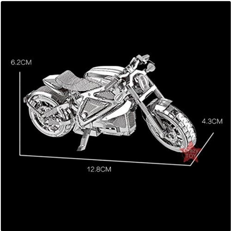
Image: A diagram illustrating the dimensions of the assembled MoTu Avenger Motorcycle 3D Metal Puzzle, showing