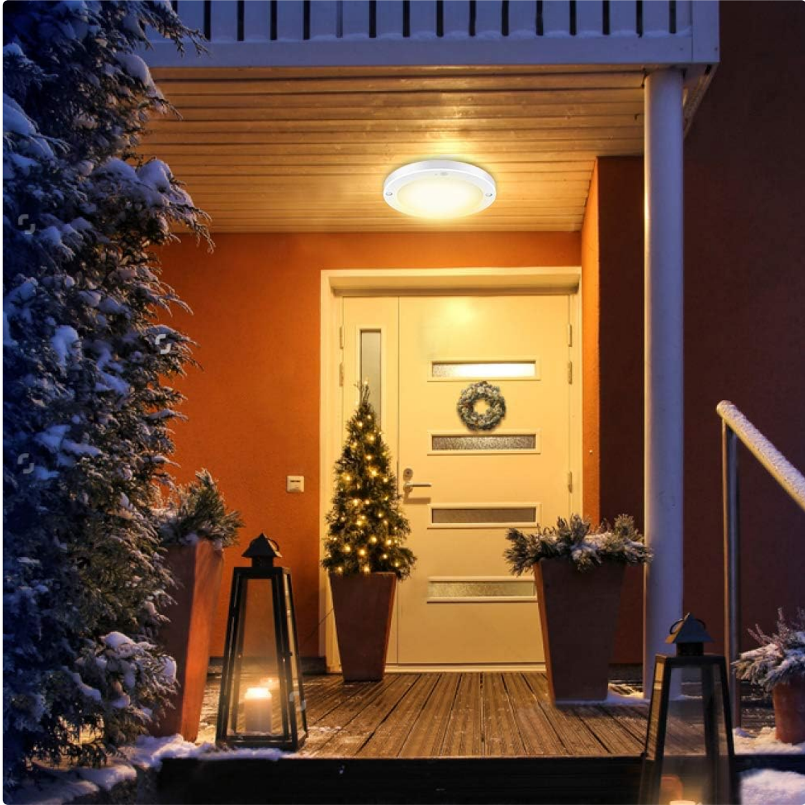
Figure 4: Example of outdoor installation on a porch.