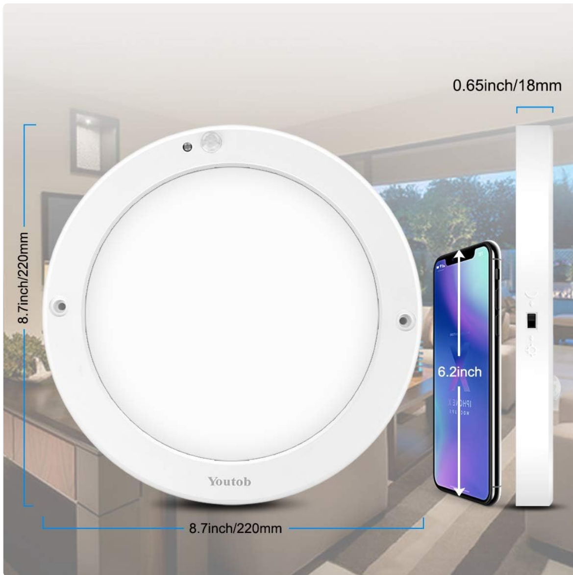
Figure 3: Product dimensions.