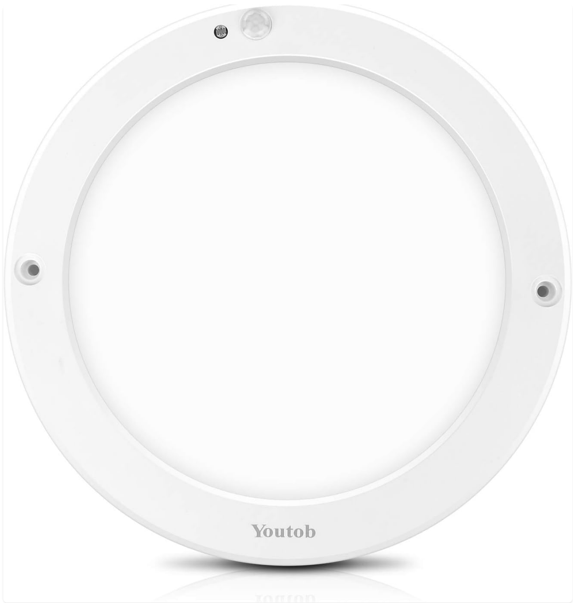
Figure 1: Front view of the Youtob Motion Sensor LED Ceiling Light.

This light is suitable for areas such as hallways, closets, stairways, basements, porches, pantries, and laundry rooms. Its design aims to provide wide coverage and comfortable illumination.