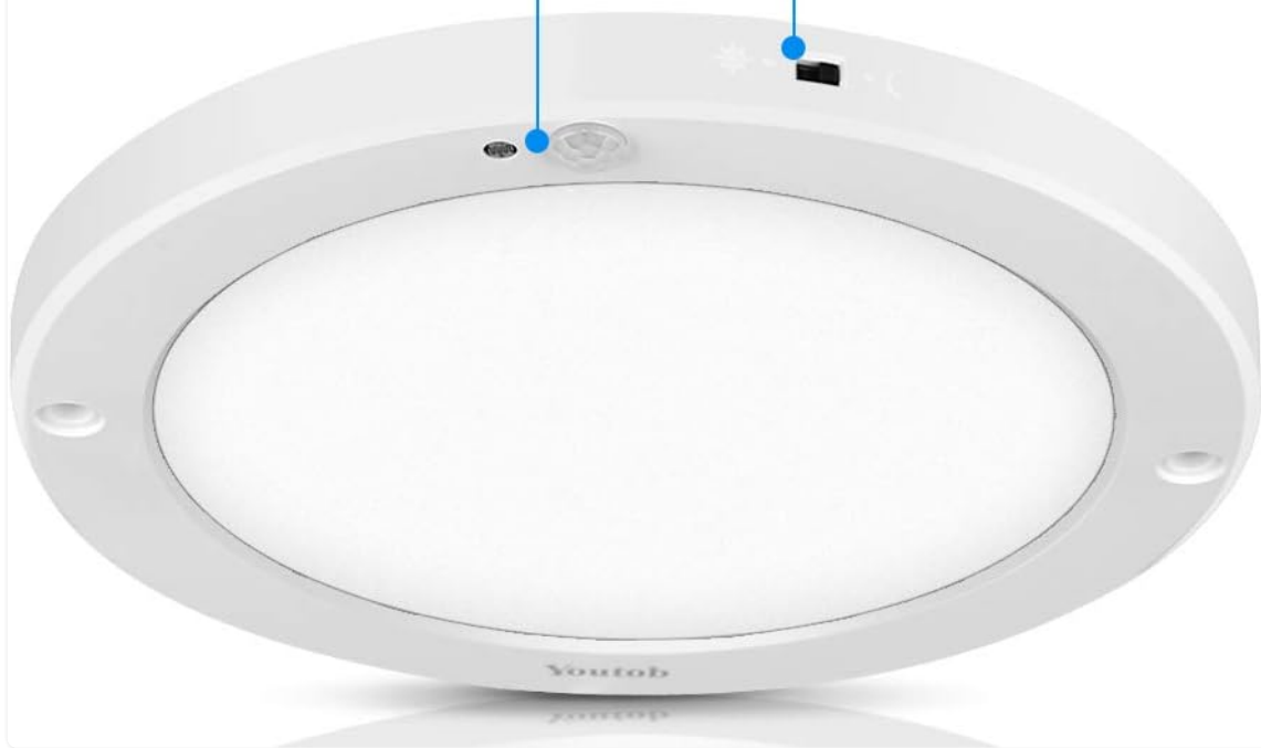
Figure 6: Location of motion sensor, light sensor, and mode selection switch.

Two Modes Available: Choosing DAYLIGHT mode or NIGHT mode by simply switching The Sun and Moon button. The Daylight mode works in the day and the night, and the Night mode will not light up during the day.