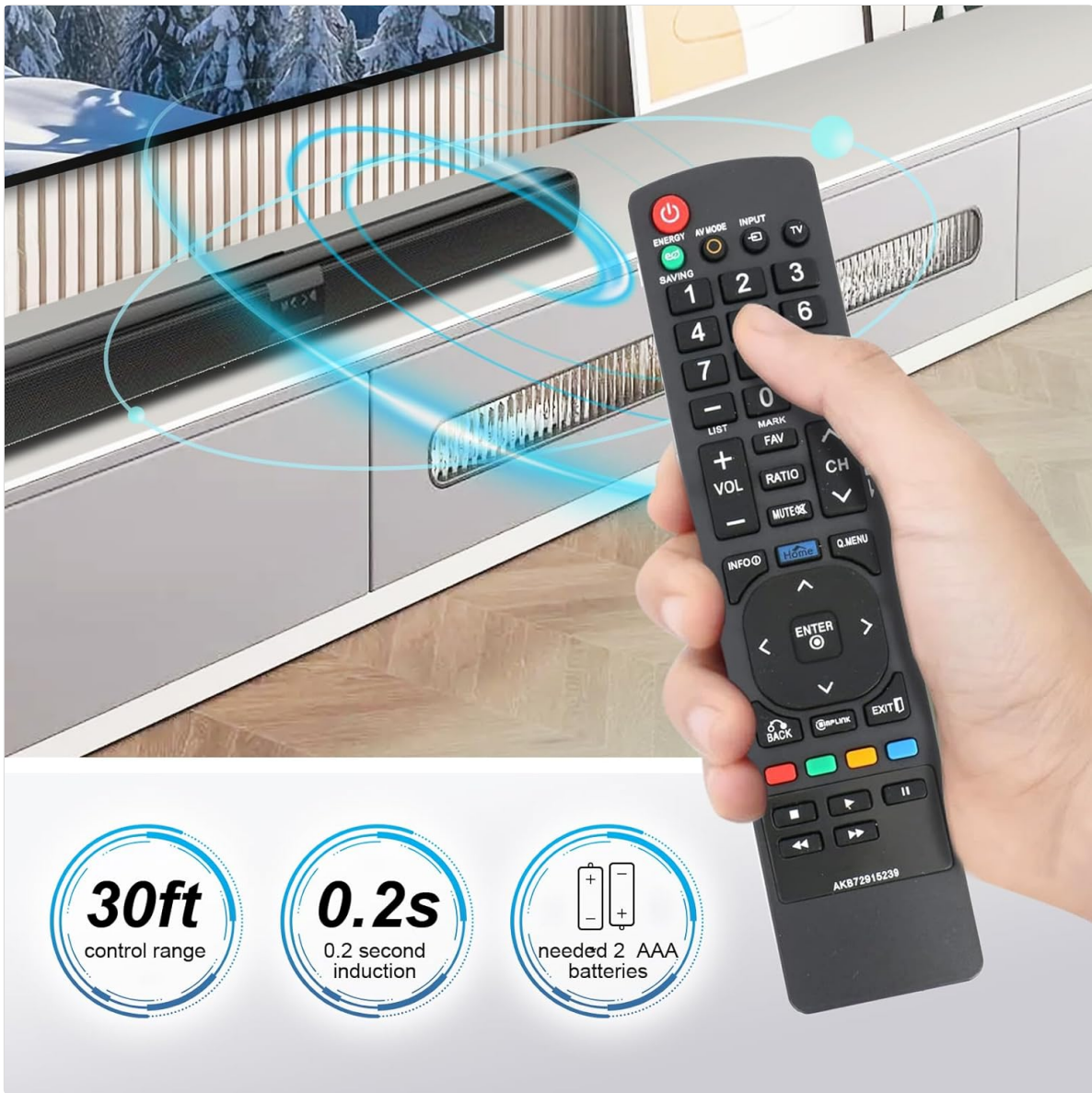
Image 2: A hand holding the remote control, illustrating its effective control range of 30 feet, 0.2-second induction speed, and the requirement for 2 AAA batteries.