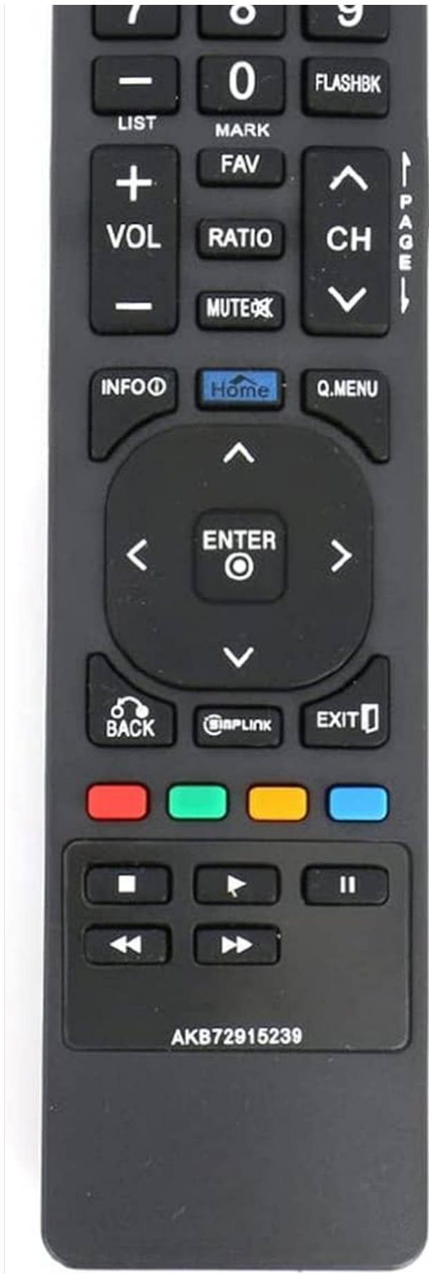
Image 1: Front view of the Beyution AKB72915239 TV Remote Control, showing all buttons and layout.

The remote is constructed from durable ABS material, designed to be drop-resistant and long-lasting. It operates effectively at a distance of up to 10 meters (approximately 30 feet) with a fast response time.