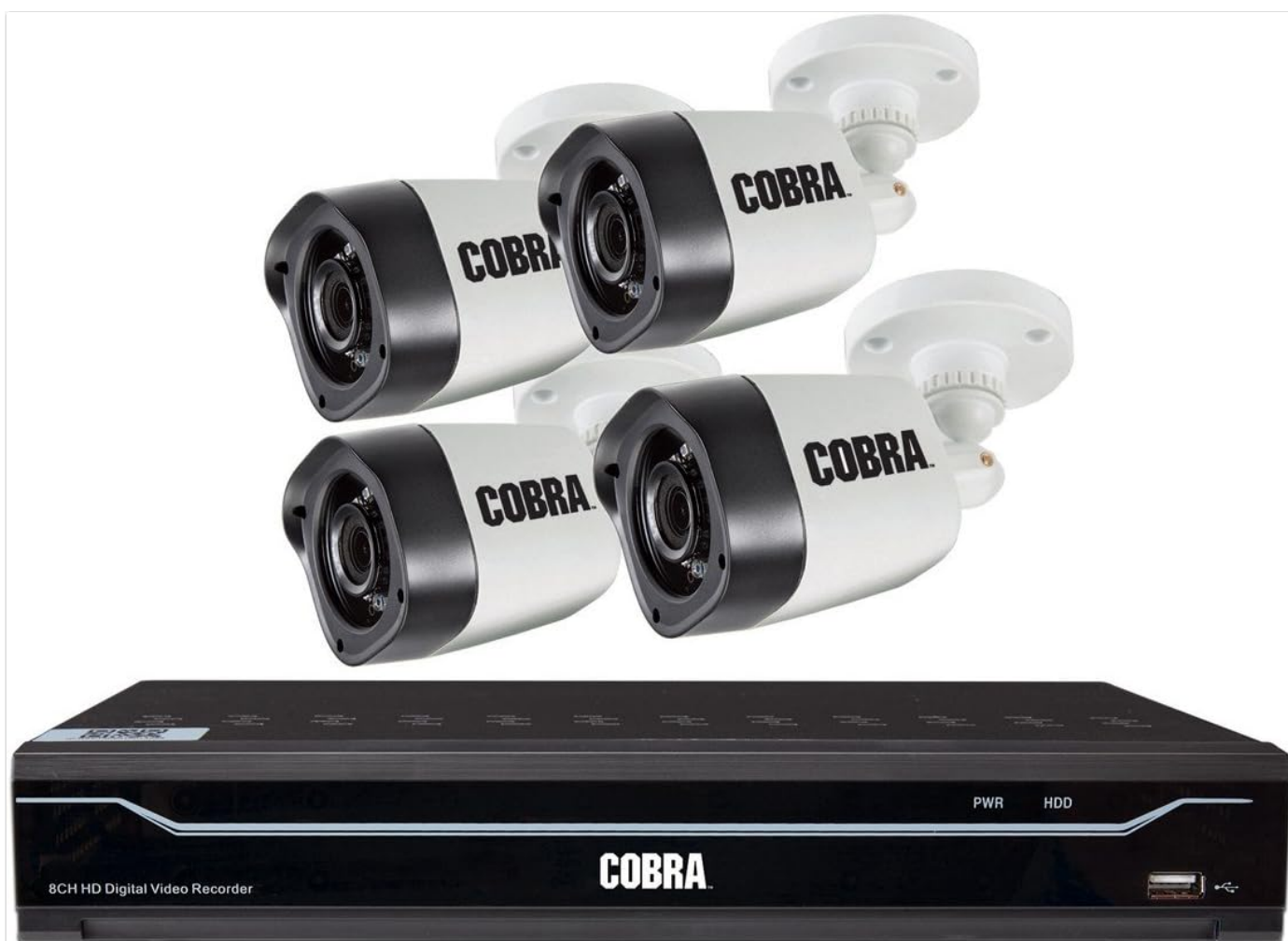
Image: The Cobra 8 Channel DVR unit and four included HD surveillance cameras.