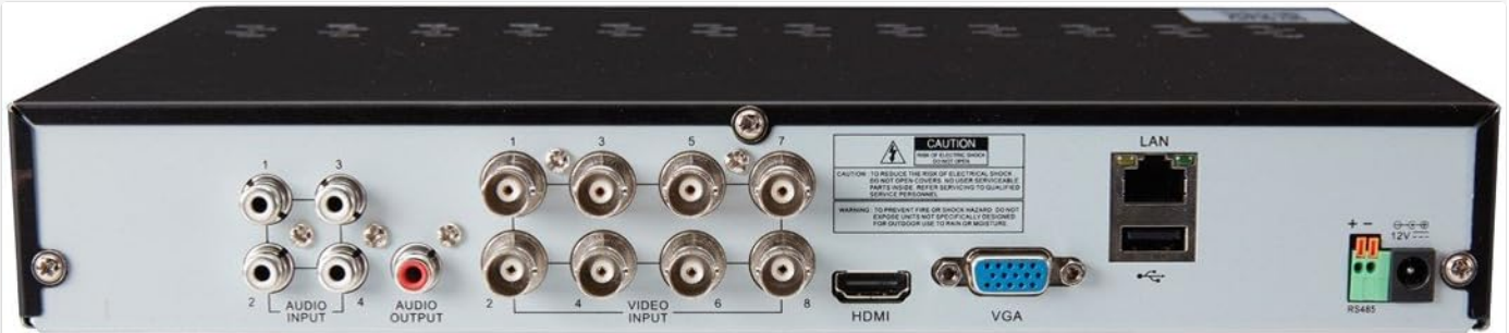
Image: Rear panel of the DVR showing video input, audio input/output, HDMI, VGA, LAN, and power ports.

The 1TB hard drive comes pre-installed and ready for recording, eliminating the need for manual installation.