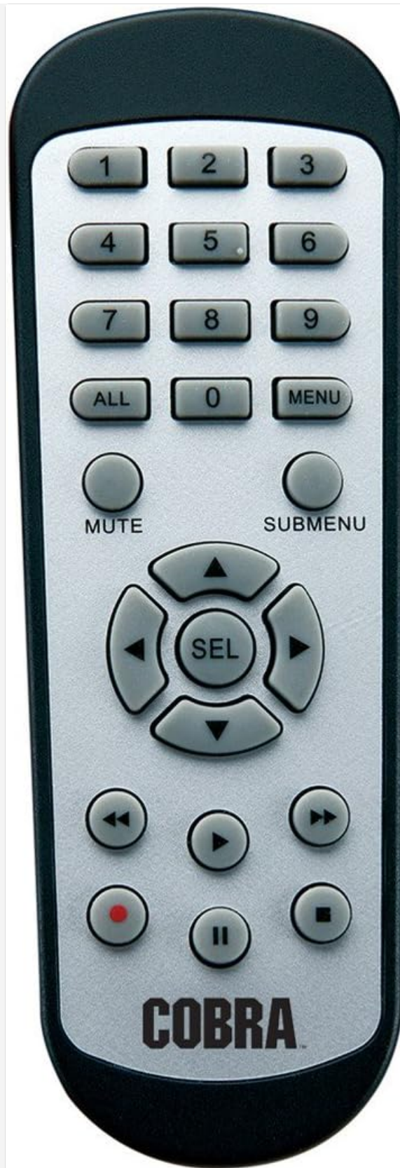
Image: The remote control for easy system setup and navigation.