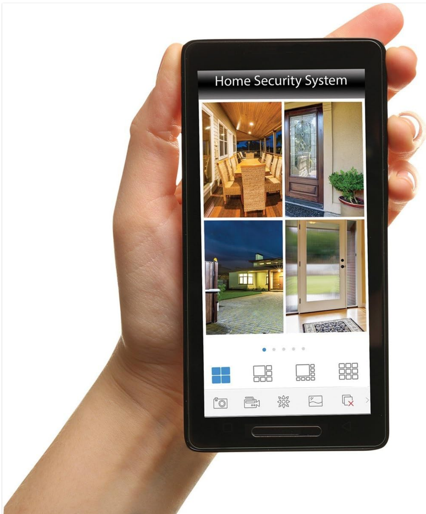
Image: A smartphone displaying the mobile monitoring application interface, showing multiple camera views.

The cameras provide a wide viewing angle and infrared night vision up to 100 ft., ensuring clear footage even in low-light conditions.