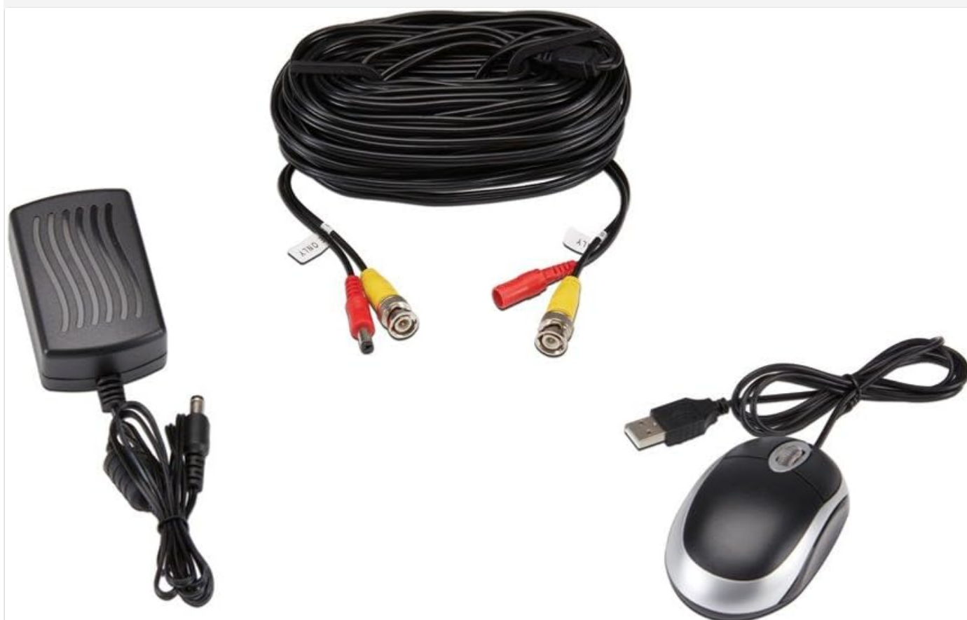
Image: Included accessories: power adapters, 60 ft. camera cables, and USB mouse.