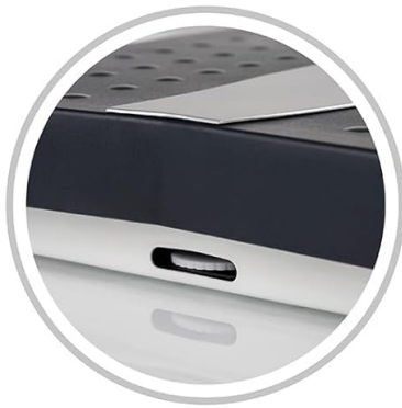
Leichte Bedienung da analoge Waage ohne Batterien