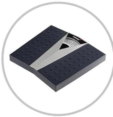
genoppte Trittfläche für einen sicheren Stand