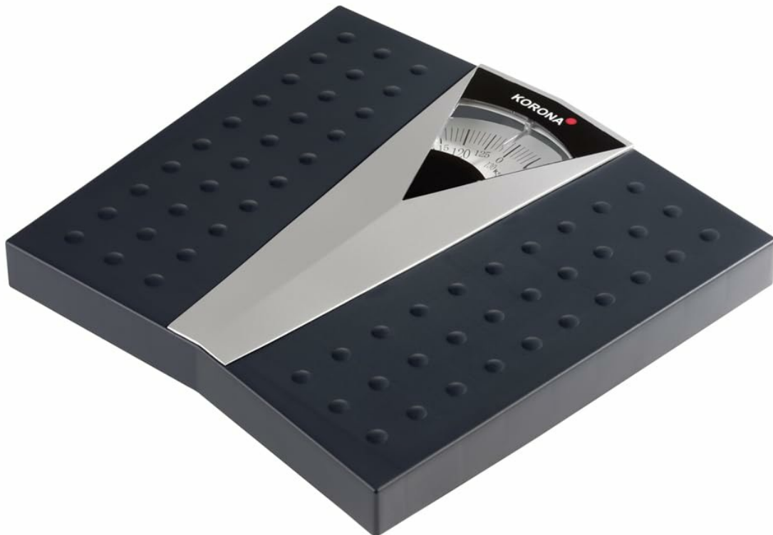
Image 1: The Korona Henry 76620 Mechanical Personal Scale, featuring a black and silver design with a visible analog dial.

Thank you for choosing the Korona Henry 76620 Mechanical Personal Scale. This manual provides essential information for the proper setup, operation, maintenance, and troubleshooting of your new scale. Please read these instructions carefully before first use to ensure accurate measurements and extend the product's lifespan. This analog scale is designed for precise body weight measurement up to 130 kg.