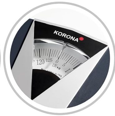
Leicht lesbare Skala dank gut sichtbarer Ziffern

Image 2: Close-up view of the Korona Henry 76620 scale's features, highlighting the easy operation (no batteries), the non-slip platform for secure standing, and the easy-to-read analog dial with clear digits.