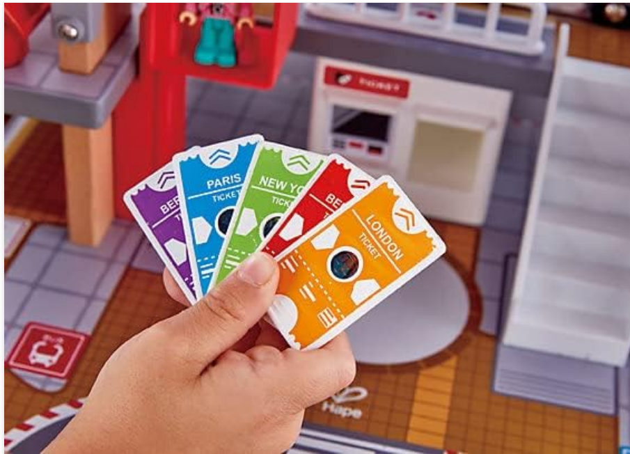
Figure 5.1: City destination tokens.