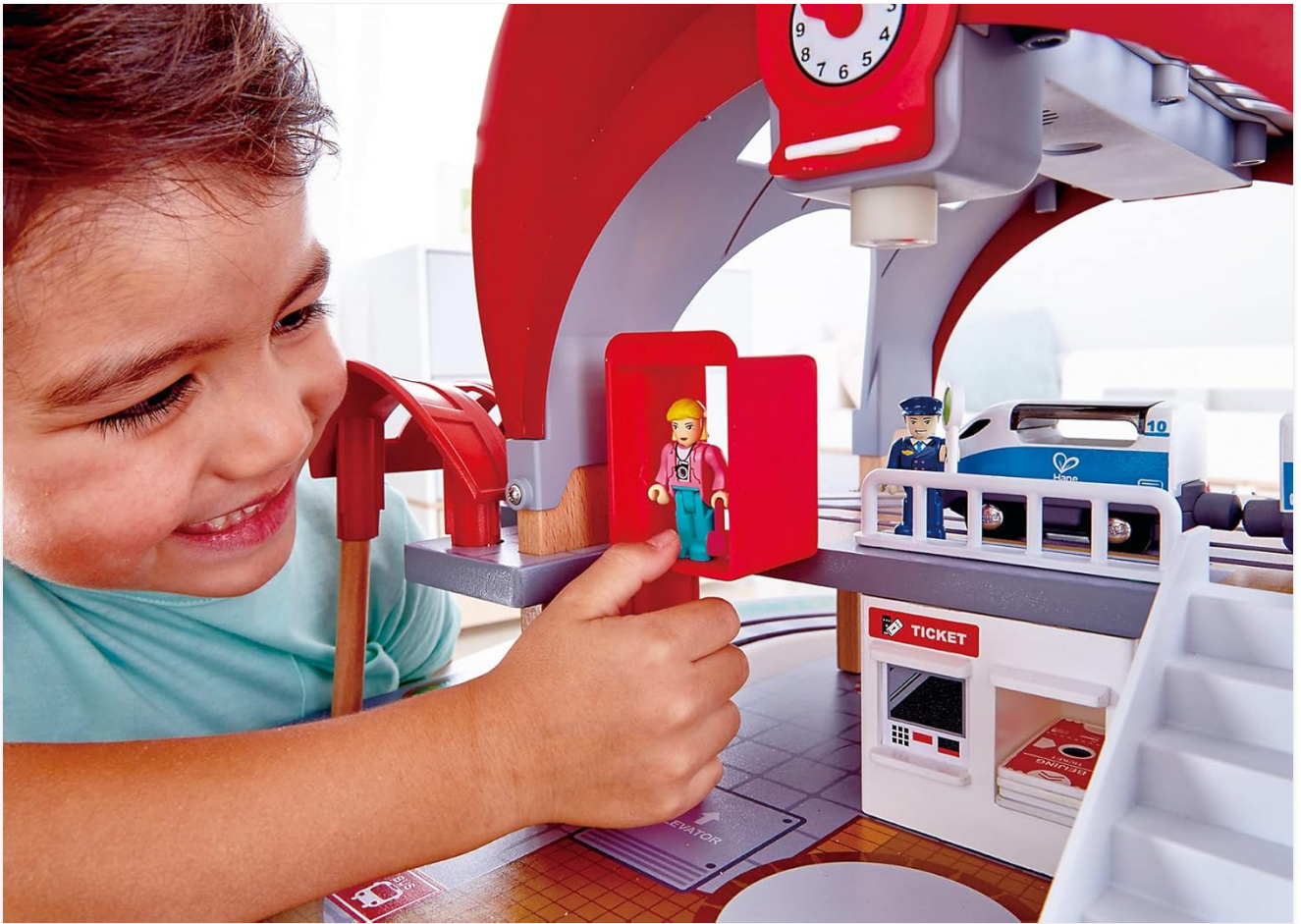
Figure 5.5: Child interacting with the station's elevator.