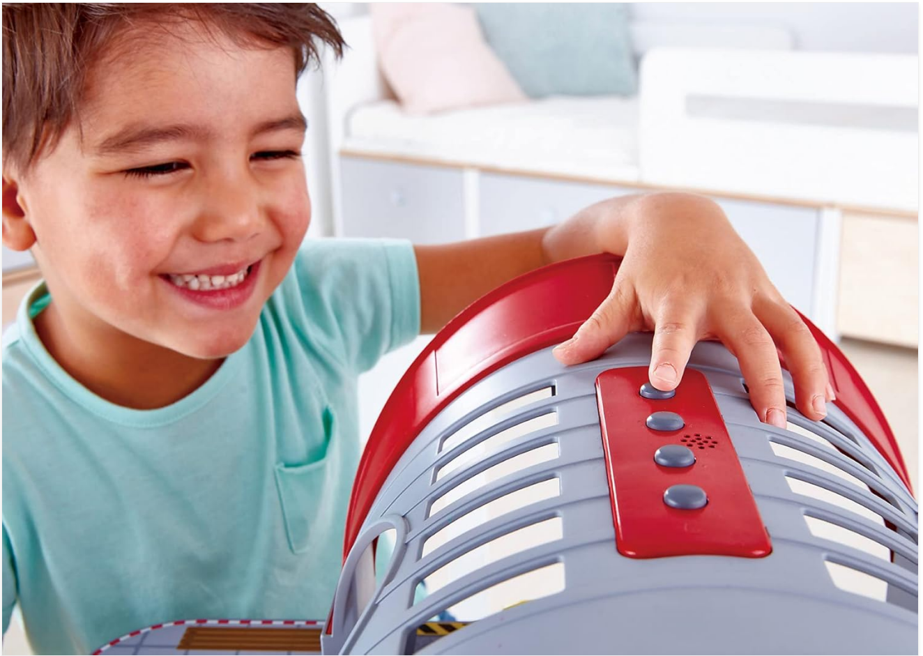
Figure 5.3: Using the record and play buttons.