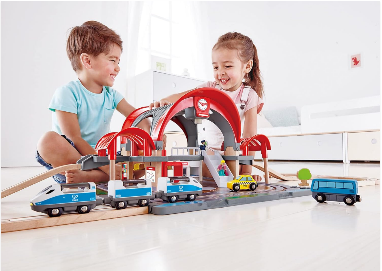
Figure 4.1: Children enjoying the assembled railway set.