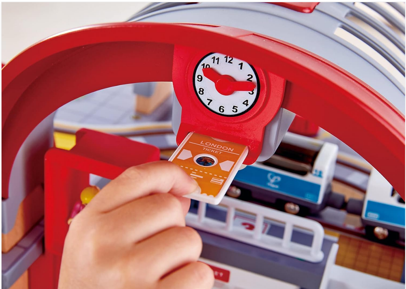
Figure 5.2: Inserting a city token into the projector.