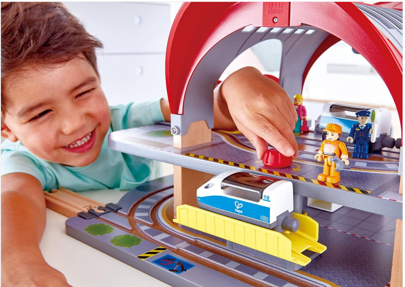
Figure 5.6: Train on the repair station.