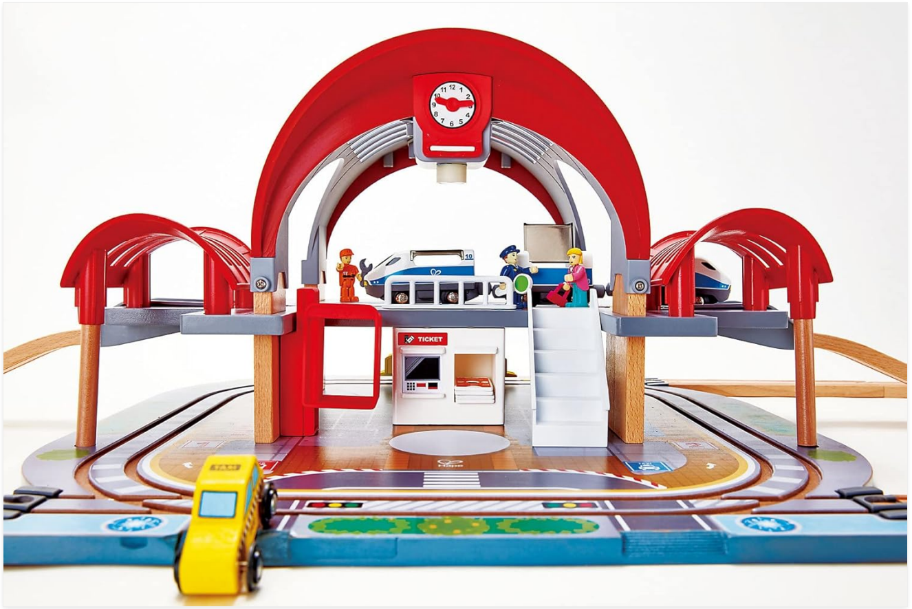
Figure 5.4: Station details and vehicles.