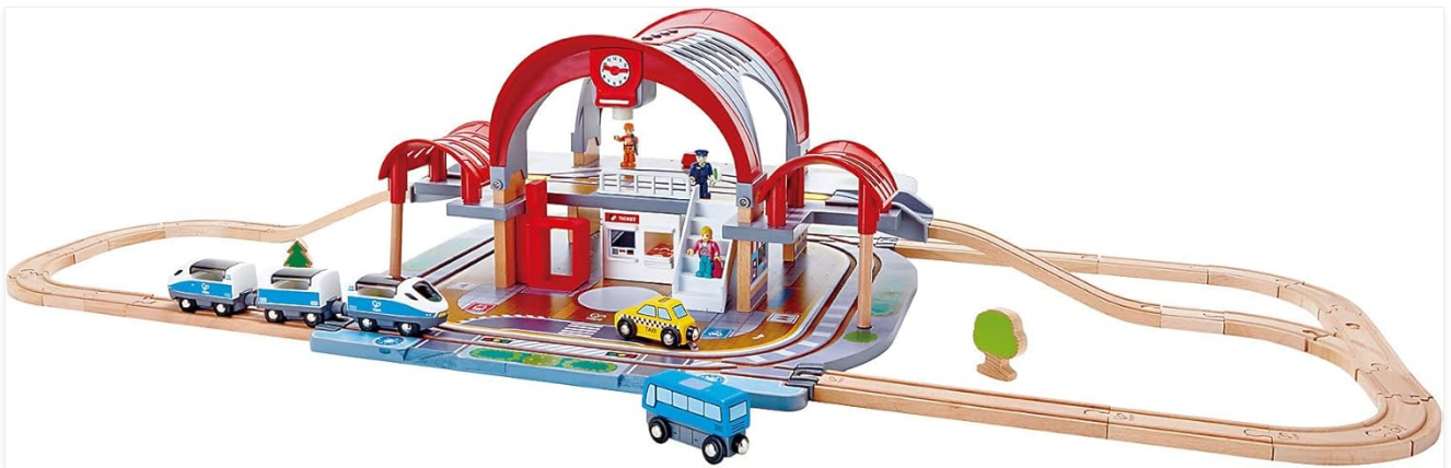
Figure 1.1: Overview of the Hape Grand City Station set.

The Hape Grand City Station is crafted from high-quality, sustainably sourced wood and finished with non-toxic, child-safe paints, meeting or exceeding all applicable safety standards.