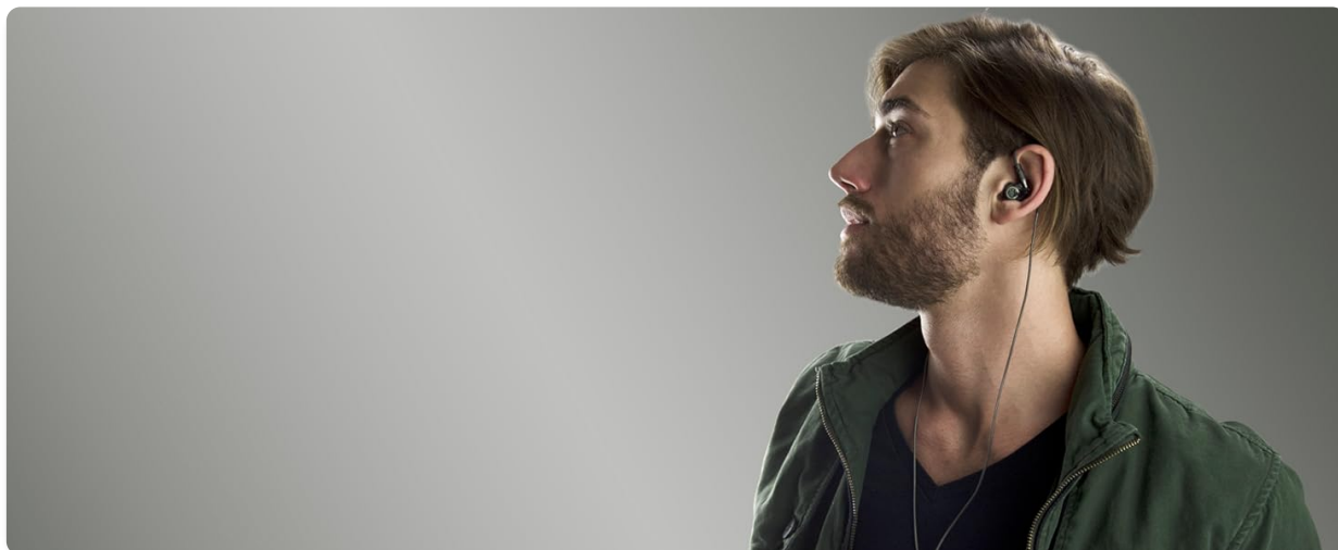
Image: MEE audio M6 PRO headphones, highlighting their design for stage and road use.

The MEE audio M6 PRO 2nd Generation In-Ear Monitor Headphones are engineered for musicians, delivering clear, full-range audio with precise movement and accurate mids. Featuring a 5um driver diaphragm and aluminum voice coil, these monitors provide enhanced sound quality. The sound-isolating design, coupled with various eartips, reduces ambient noise for safer listening volumes and an improved audio experience.