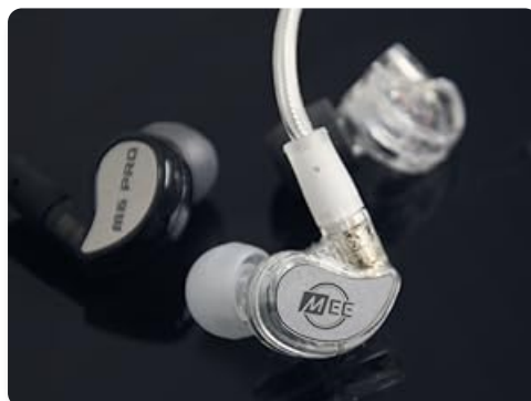
Image: A selection of eartips, including silicone and memory foam, to ensure optimal fit and sound.