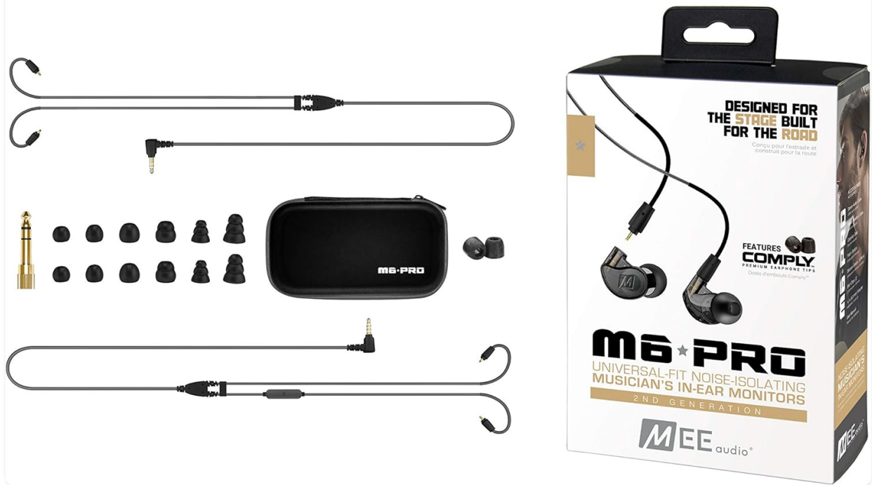
Image: A complete view of all items included in the MEE audio M6 PRO retail package.

Includes regular stereo cable, headset cable with mic/remote, protective carrying case, Comply™ memory foam eartips, 6 sets of silicone eartips, and 1/4" adapter