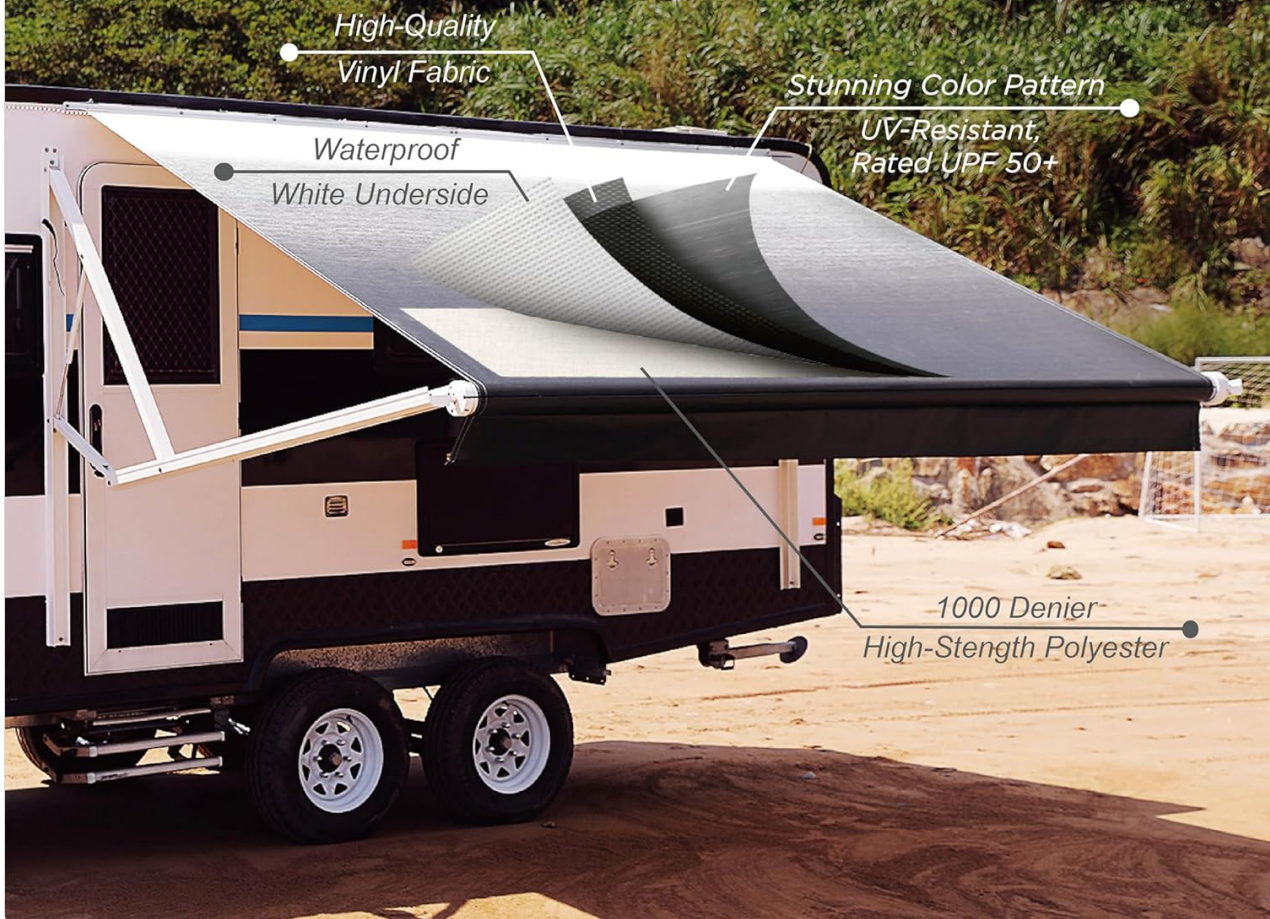
Figure 3: Awning Fabric Construction. A cross-section diagram detailing the high-quality vinyl fabric with a white underside and 1000 Denier high-strength polyester.

Enhance your outdoor adventures with superior comfort and convenience thanks to our RV tarpaulin fabric. Crafted from waterproof and insulated 16 oz. vinyl material, our fabric ensures optimal protection and insulation, elevating your travel experience.