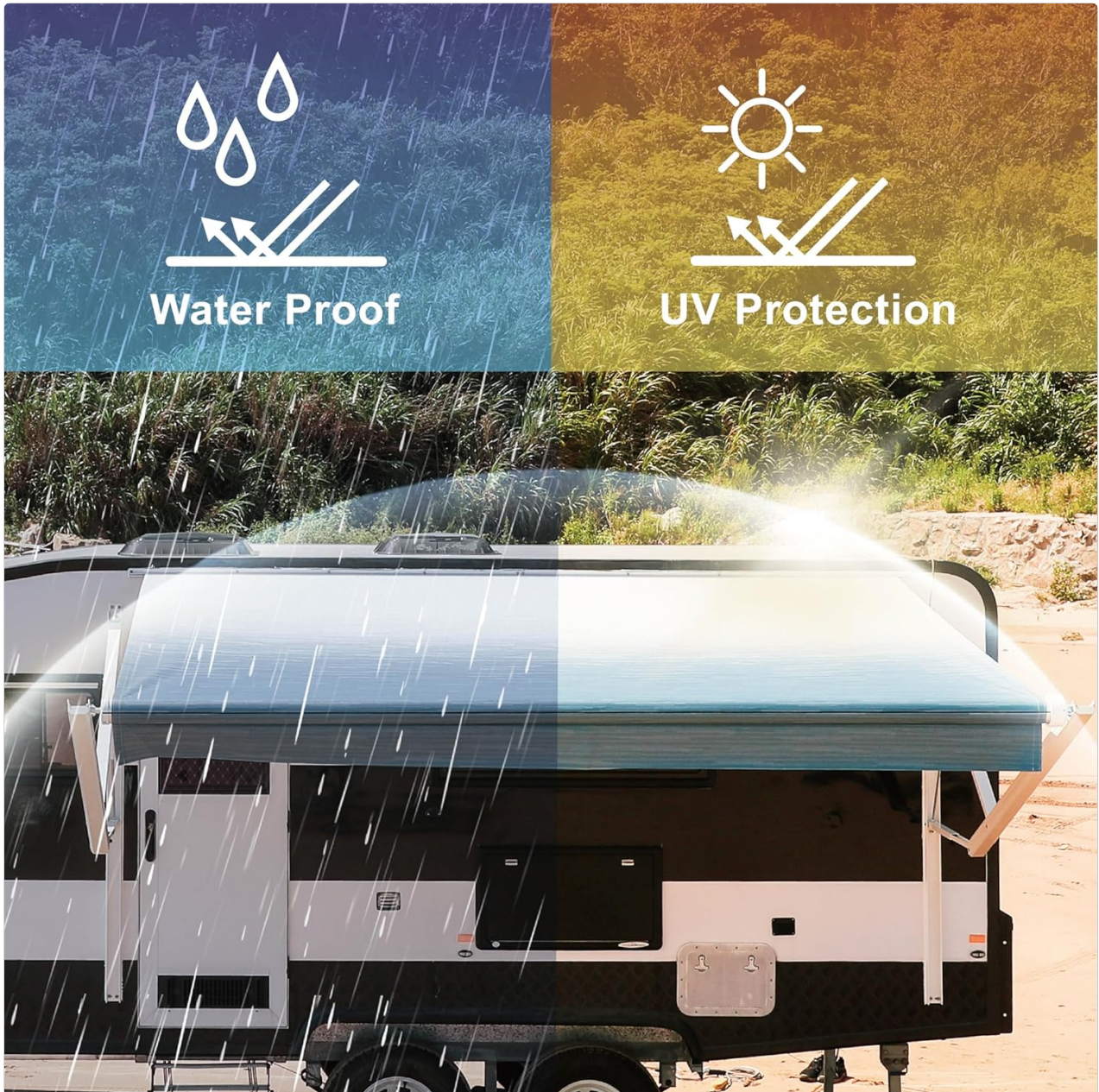
Figure 2: Fabric Protection Features. This image highlights the waterproof and UV protection capabilities of the awning's vinyl fabric.

The awning features a high-quality vinyl fabric that is waterproof and UV-resistant (rated UPF 50+), ensuring optimal protection and insulation. The fabric is crafted from 16 oz. vinyl material with a 1000 Denier high-strength polyester base.