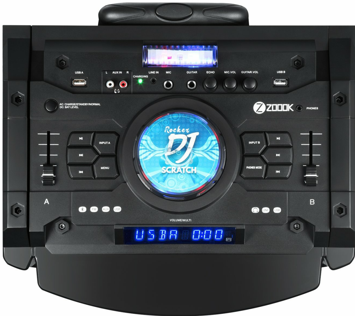
Image: Detailed view of the top control panel, illustrating the layout of inputs, volume controls, and the central DJ scratch pad.