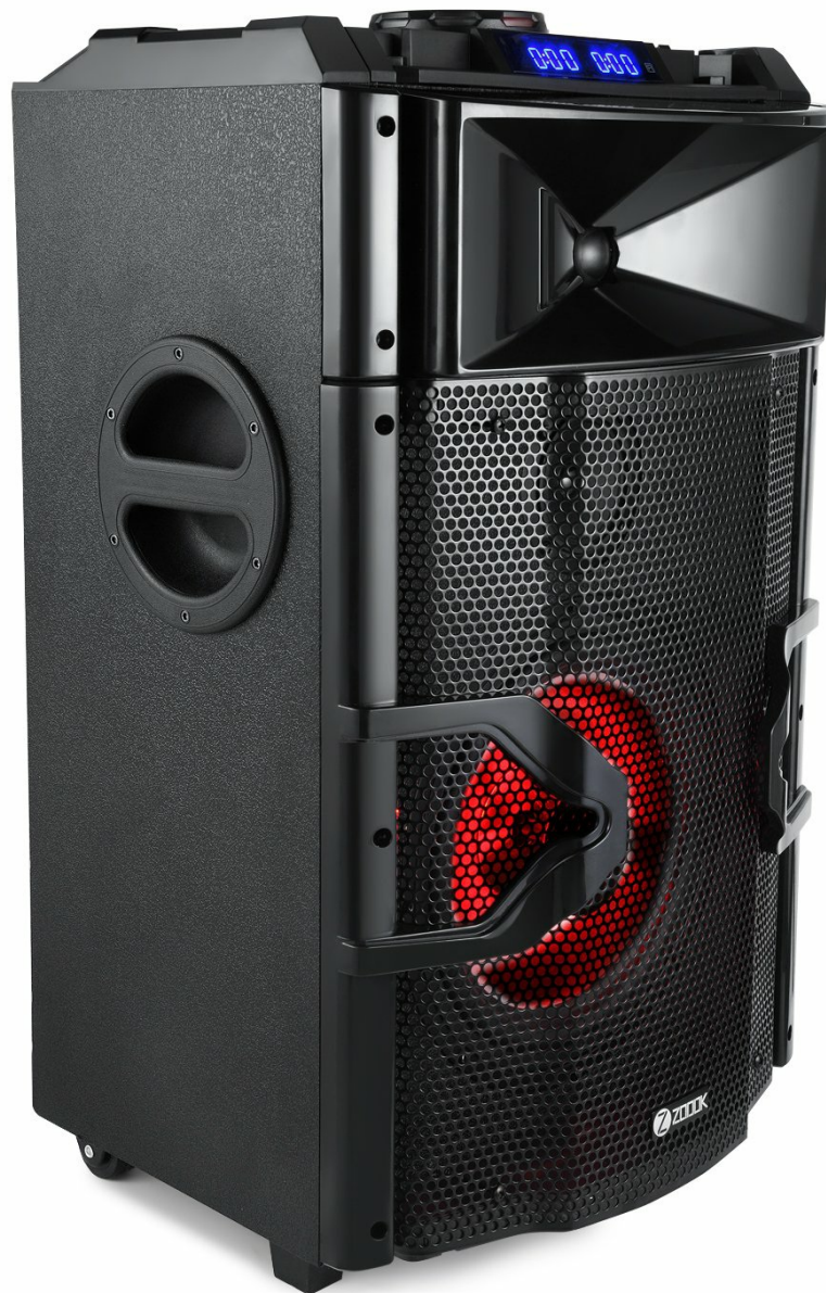
Image: The unit shown with its retractable handle extended, demonstrating its portability for easy setup in various locations.