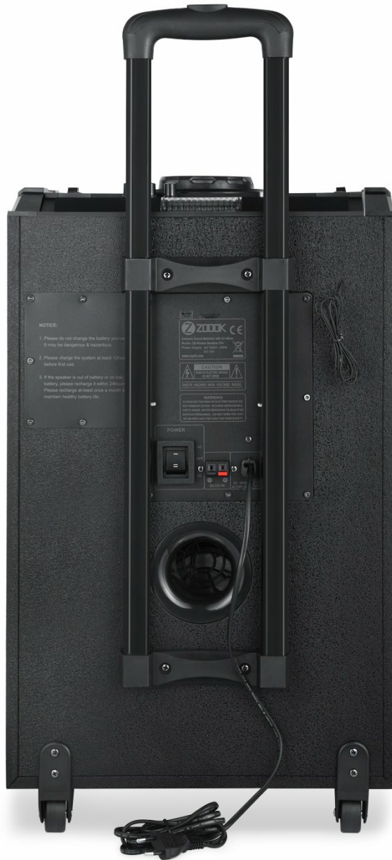
Image: Back view of the unit, detailing the power connection area and warning labels.