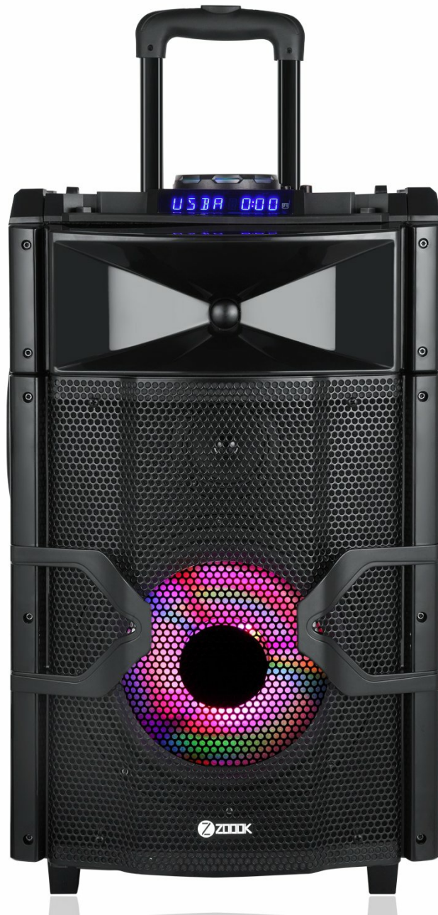
Image: Front and side view of the Zook ZB-ROCKER BEATBOX PRO, highlighting its robust design and illuminated speaker.