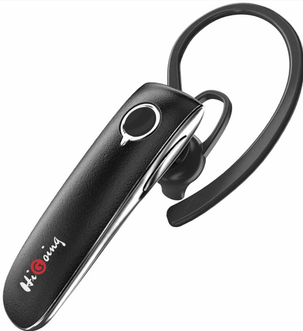
Image: The HiGoing Bluetooth Headset HB01_N, a sleek black earpiece with an ear hook.