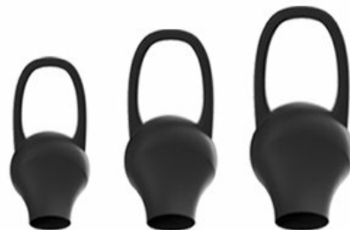
Image: Illustrations showing the HiGoing Bluetooth Headset securely fitted in an ear, along with the three sizes of ear tips provided for a comfortable fit.