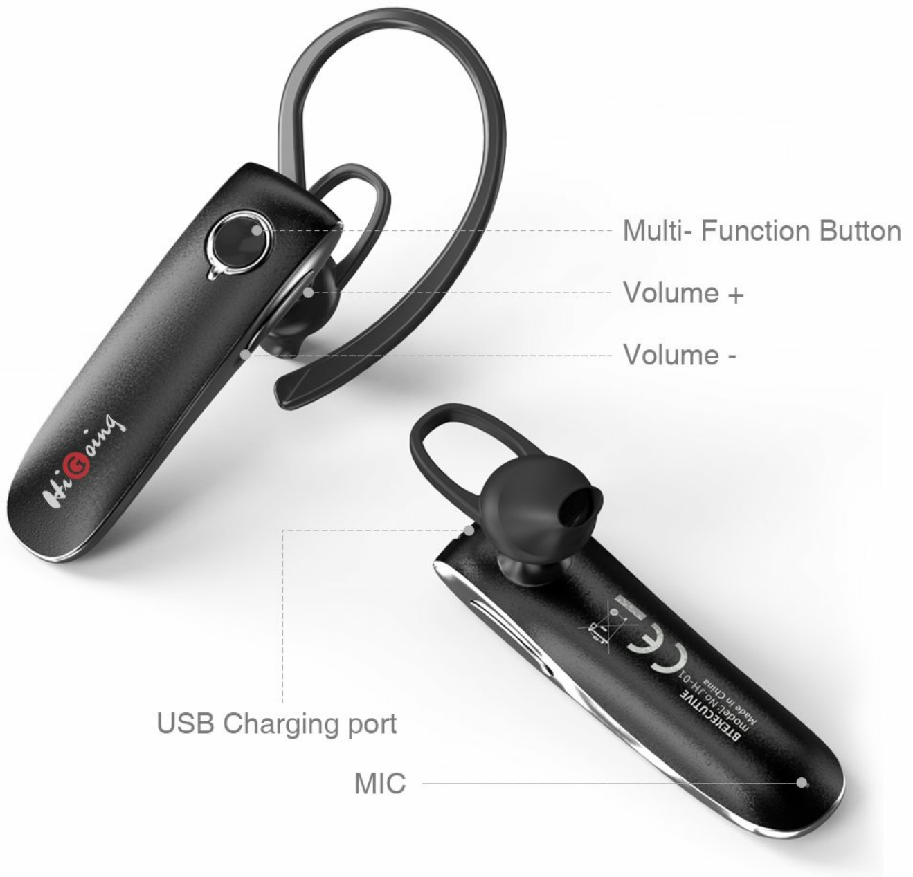
Image: An overhead view of the HiGoing Bluetooth Headset showing the Multi-Function Button, Volume + and Volume - buttons, USB Charging Port, and Microphone.