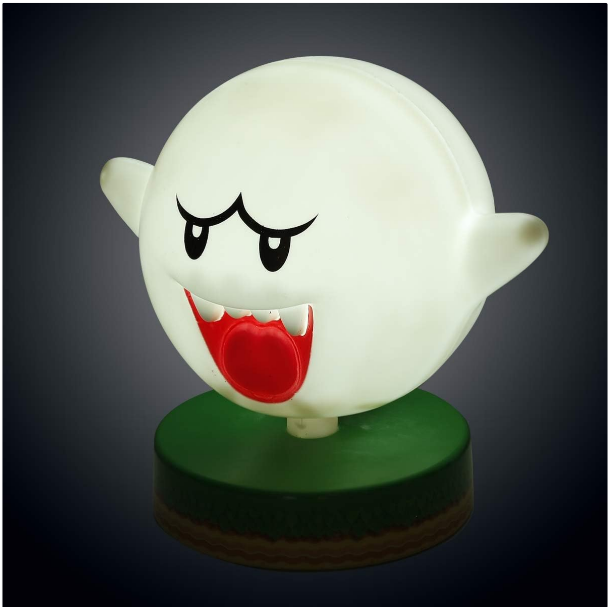
Figure 1: Front view of the Paladone Boo Mini Lamp, unlit.