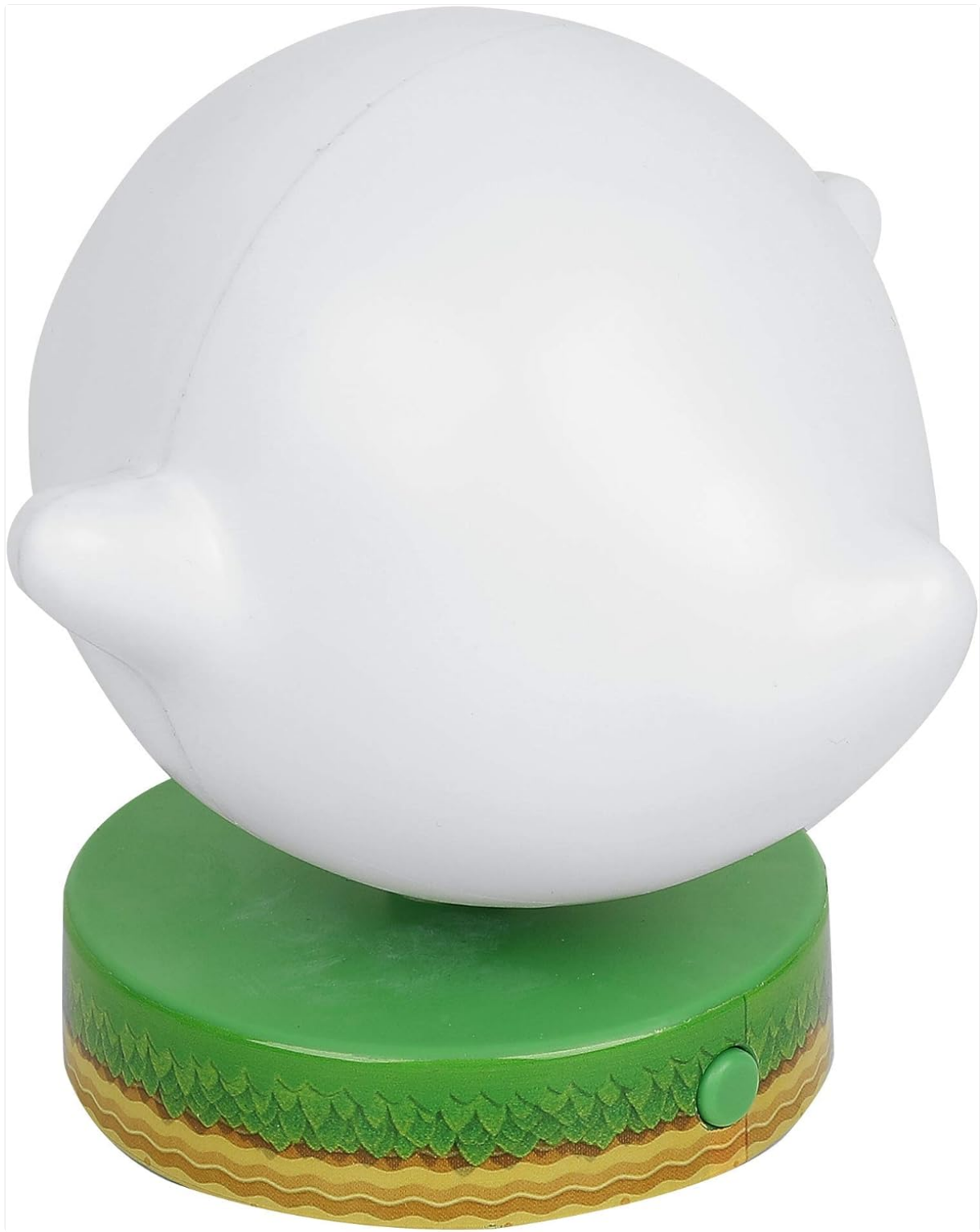
Figure 2: The Paladone Boo Mini Lamp in its retail packaging.