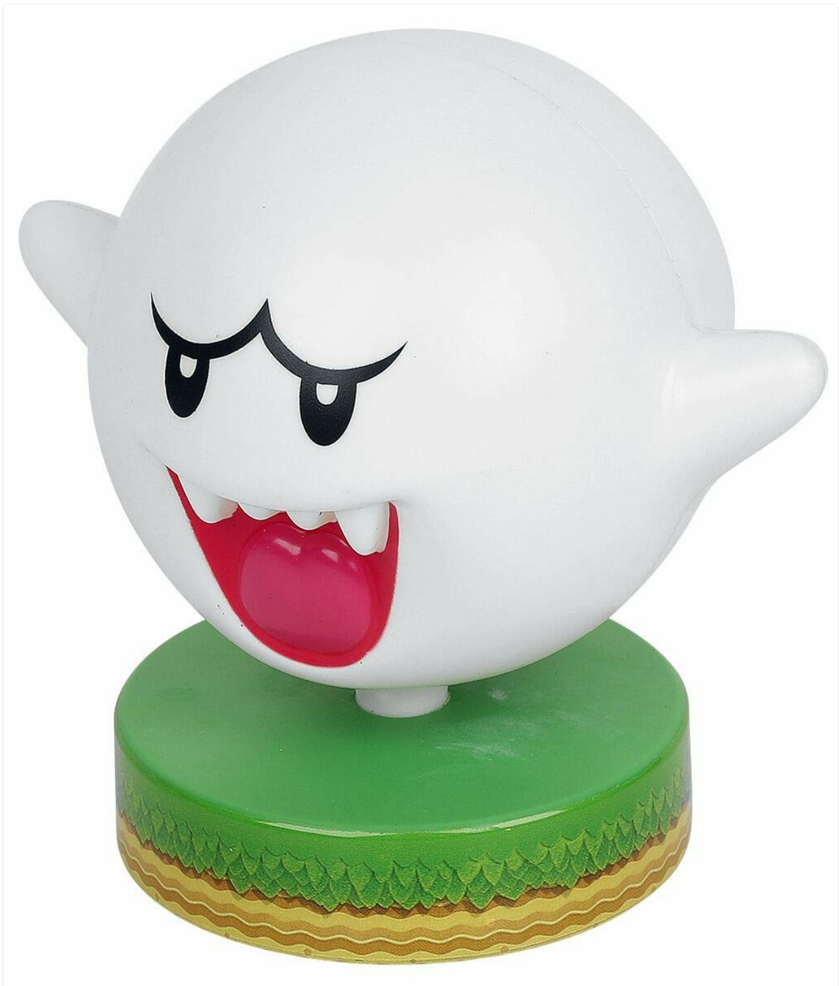
Figure 4: The Paladone Boo Mini Lamp illuminated.