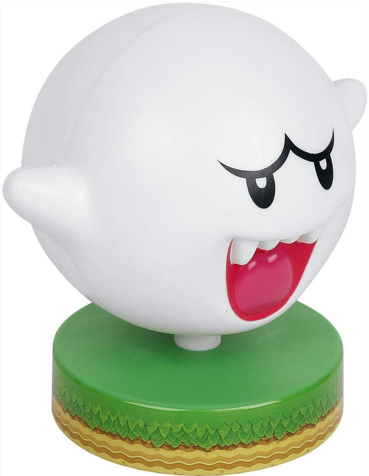
Figure 3: Side view of the lamp, indicating the location of the power switch and typical battery compartment area.