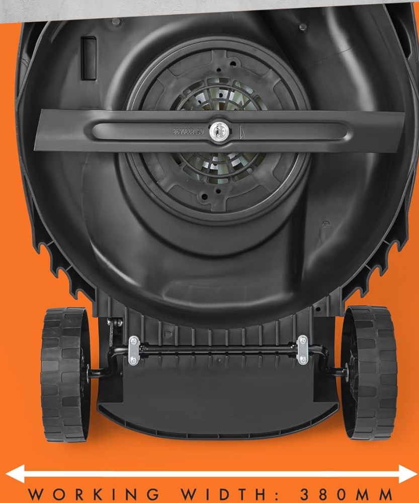
Figure 4.2: Wide Working Width

Get your lawn mown quickly with a generous 380mm working width.