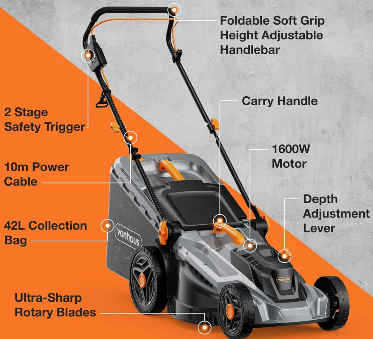
Figure 2.1: Key Features of the Lawnmower