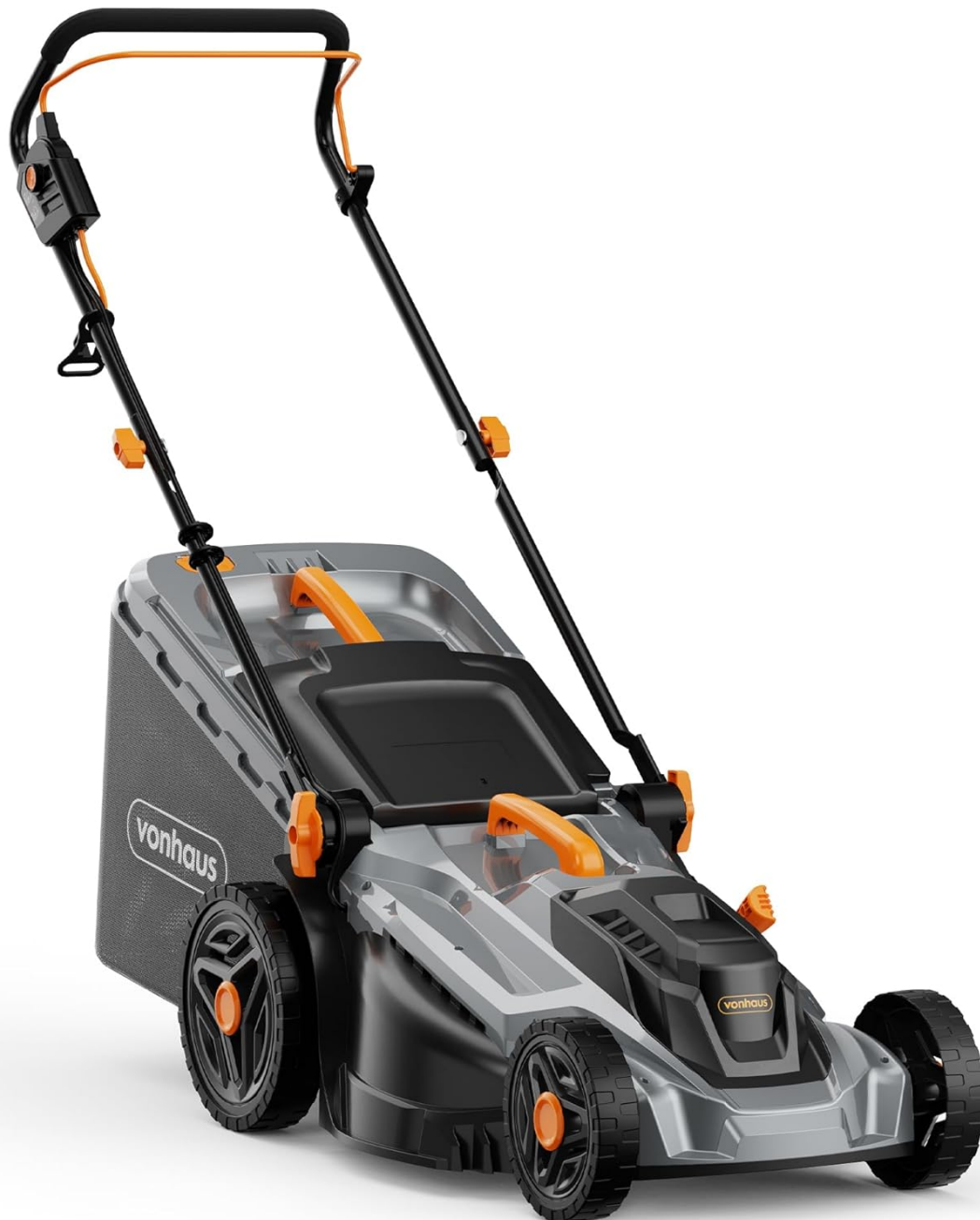
Figure 2.2: VonHaus 1600W Electric Corded Lawnmower