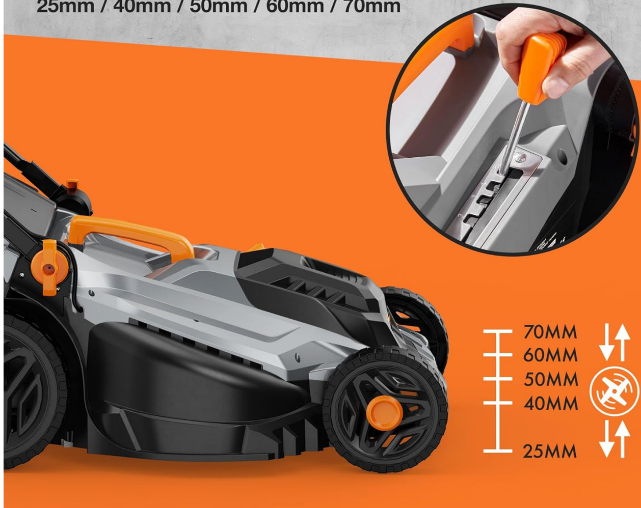
Figure 4.1: Cutting Height Adjustment