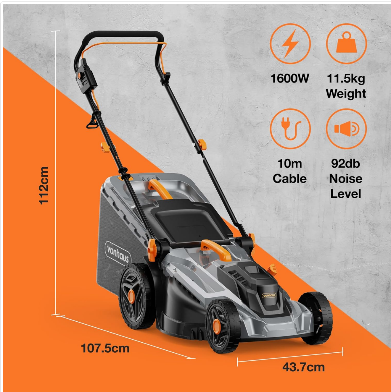
Figure 7.1: Product Dimensions and Key Specifications