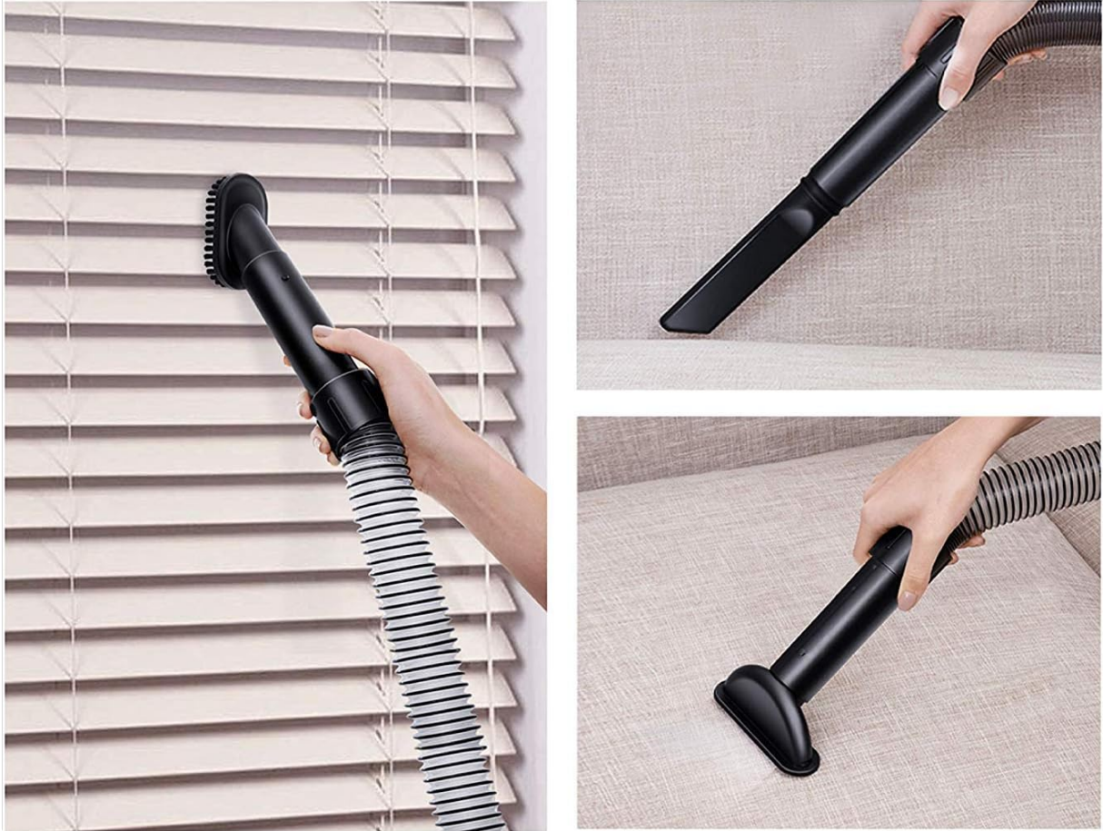
Image: The Eureka PowerSpeed vacuum cleaner is shown with its three primary accessories: a dusting brush, an upholstery tool, and a crevice tool, highlighting their convenient onboard storage.

Conveniently store all accessories right on board your Eureka vacuum cleaner.