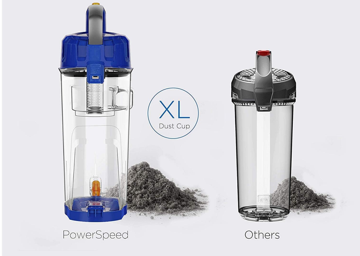
Image: A visual comparison highlighting the Eureka PowerSpeed's extra-large 2.6L dust cup, demonstrating its generous capacity compared to a standard dust cup from another vacuum.

Less trips to the trash can saves you time and energy. Clean faster and more efficiently.