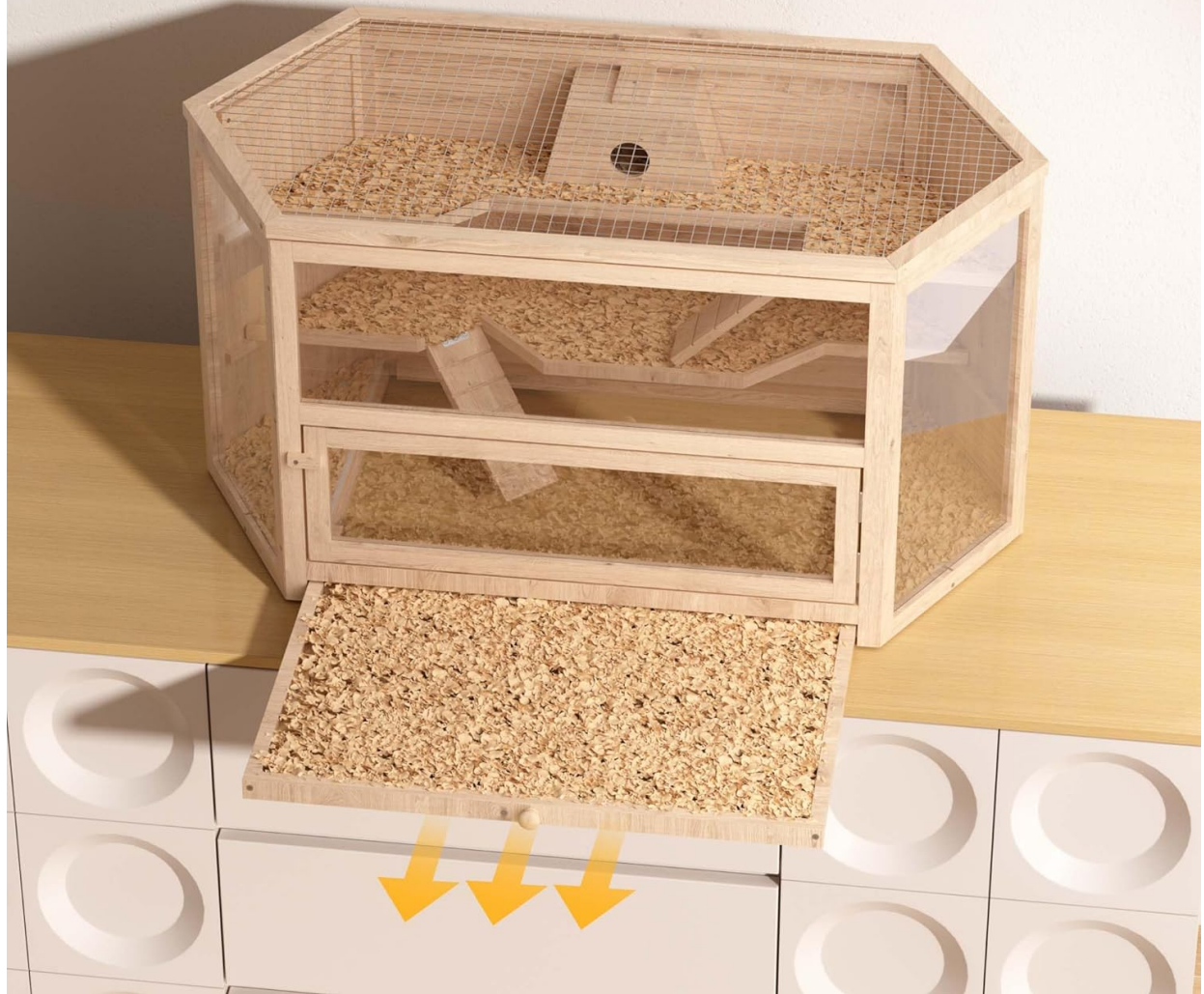
Figure 6.1: Removable Tray. The pull-out base tray simplifies the cleaning process, allowing for quick and efficient removal of soiled bedding.