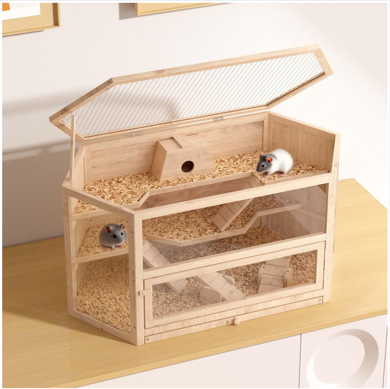
Figure 4.2: Assembled Cage. A view of the fully assembled Wiltec XXL 3-Tier Wooden Hamster Cage, showing its spacious interior and multiple levels.