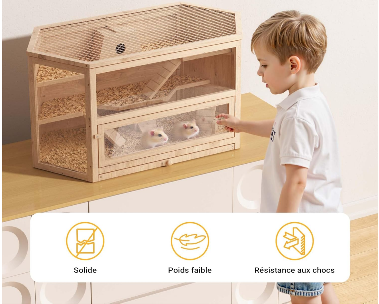
Figure 5.2: Observation Window. The large acrylic windows allow for comfortable and continuous monitoring of your pets without disturbing their environment.