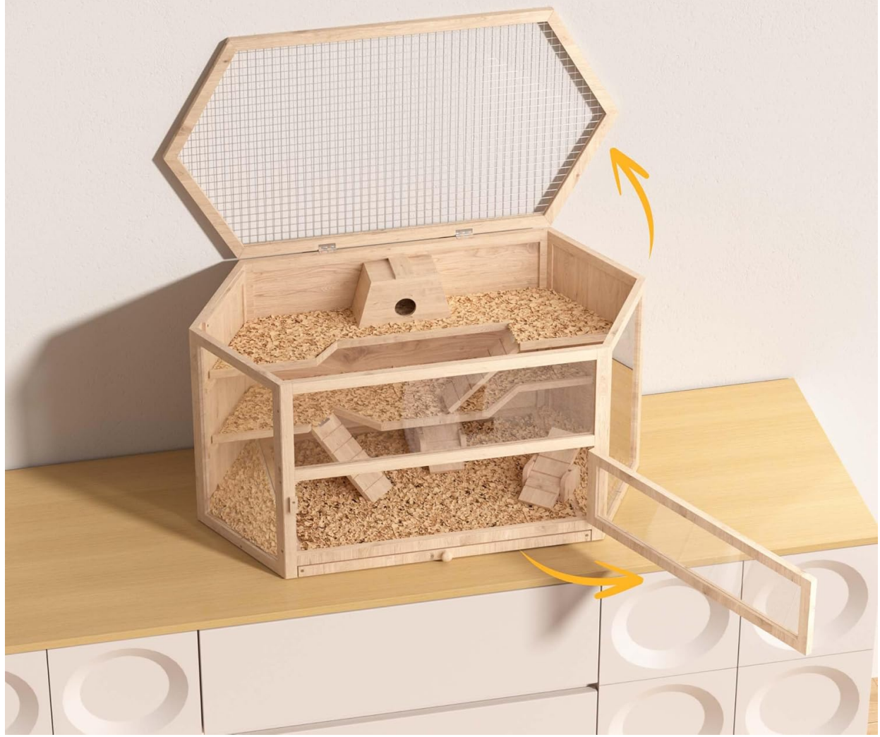
Figure 6.2: Easy Access. The hinged roof and front door provide convenient access for cleaning, feeding, and interacting with your pets.