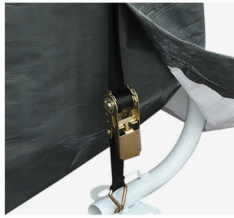
Cover Tension System