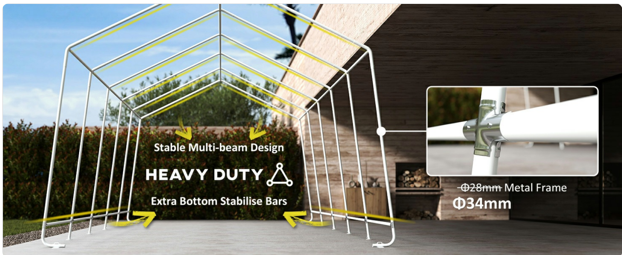
Figure 3: Illustration of the heavy-duty frame with stable multi-beam design and extra bottom stabilizing bars for enhanced rigidity.