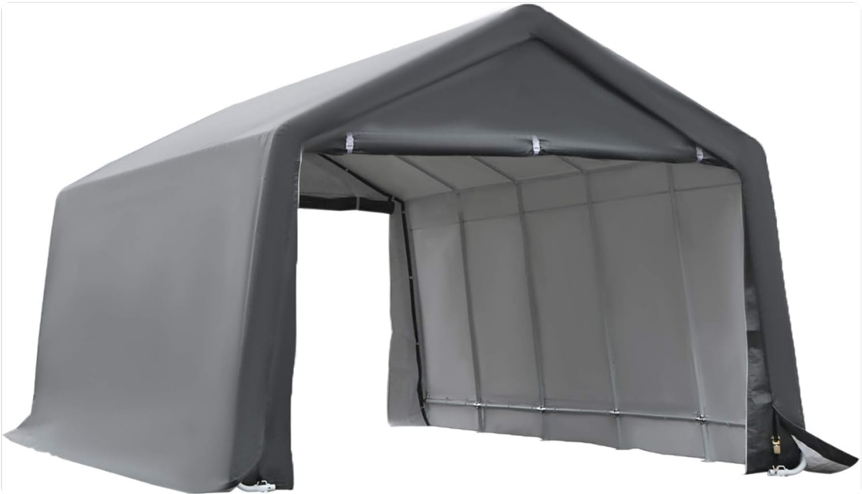
Figure 1: The Outsunny 12' x 20' Carport Portable Garage, showcasing its overall design and gray color.