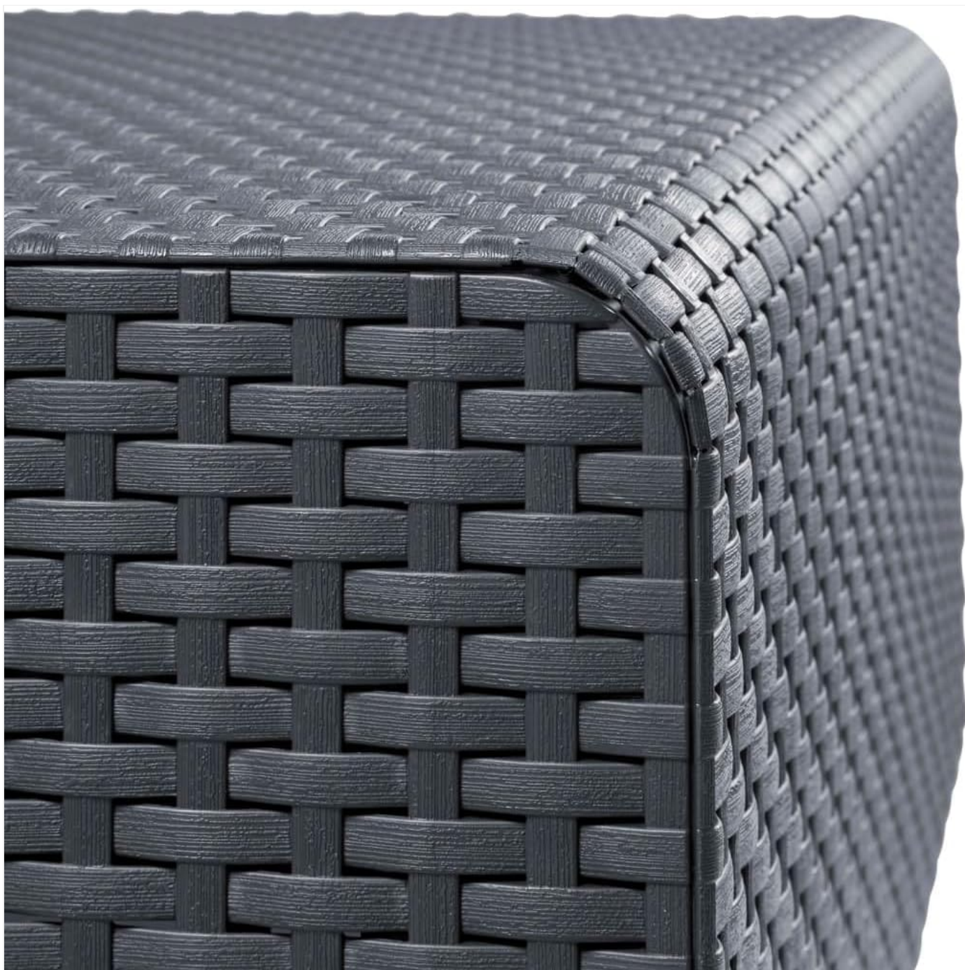
Figure 4: A close-up view of the table's surface, highlighting the durable, weather-resistant plastic material with a woven texture.