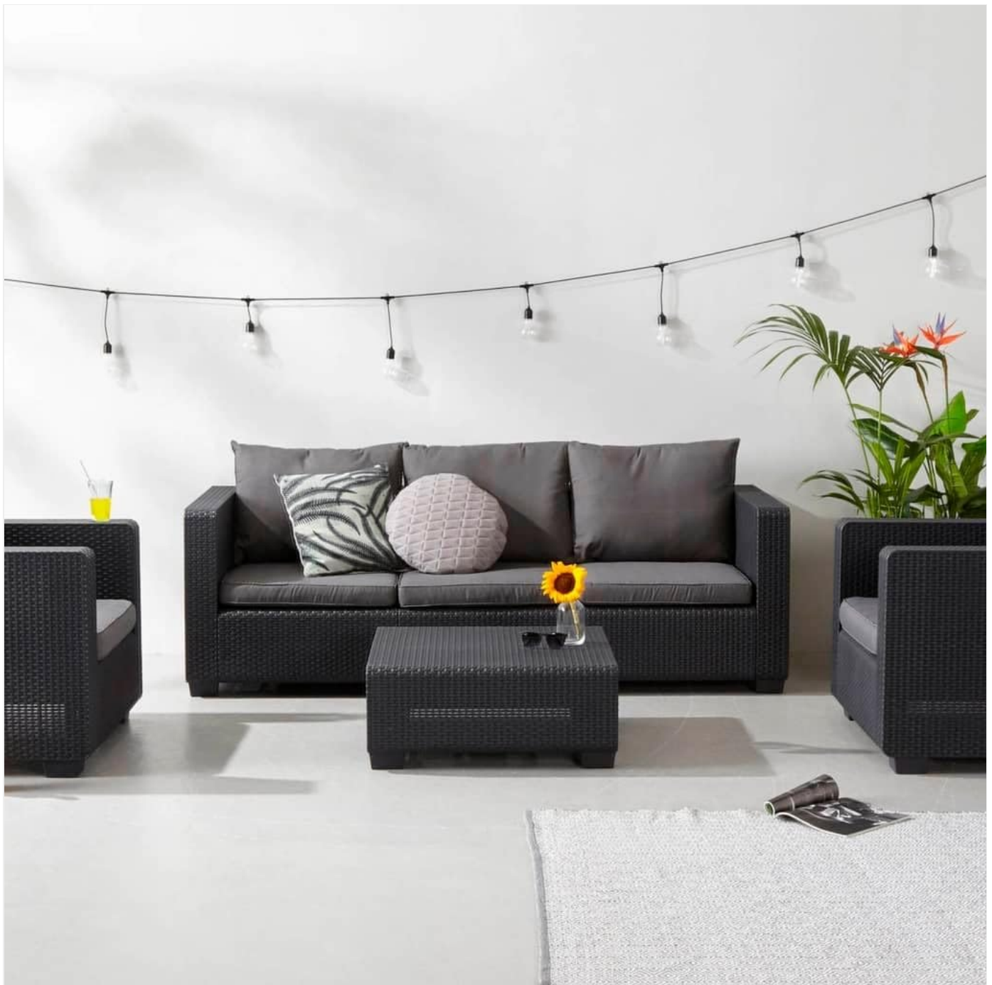
Figure 2: The Salta Lounge Table integrated into an outdoor lounge area, demonstrating its intended use and scale.