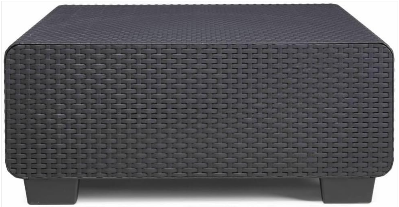
Figure 1: Keter Allibert Salta Lounge Table, showcasing its square design and graphitegray finish.

Thank you for choosing the Keter Allibert Salta Lounge Table. This manual provides essential information for the safe and proper assembly, operation, and maintenance of your new lounge table. Please read these instructions carefully before use and retain them for future reference.