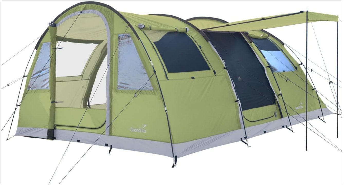
Image: The Skandika Gotland 5-person tunnel tent fully pitched, showcasing its overall structure and design.