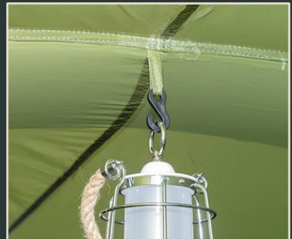
Haken für Campinglampe

Image: Interior view of the tent's living area, highlighting the sewn-in groundsheet, cable openings, organizer pockets, and a camping lamp hook.