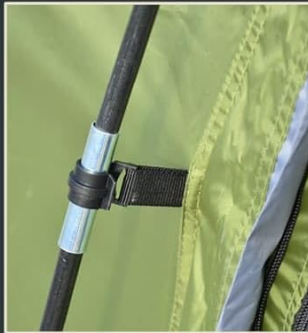
Flexible, robuste Fiberglasstangen