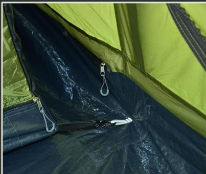
Kabelöffnungen in Kabine + Außenzelt