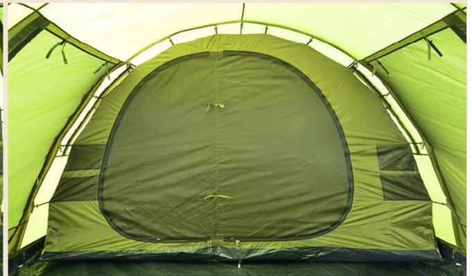
Kabinentüren komplett aus Mesh + Verdunkelung

Image: The spacious sleeping cabin, demonstrating the roll-up room divider and cabin doors with both mesh and blackout panels.