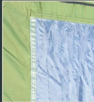
Verdunkelungen für Türen und Fenster