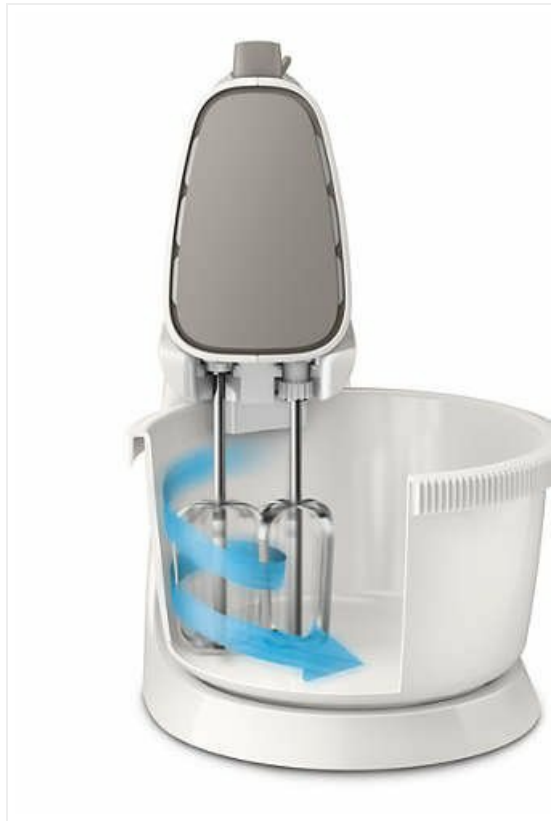
Image 2.1: The Philips HR1559/55 Stand Mixer assembled with the mixing bowl and beaters, illustrating the mixing action with blue arrows.