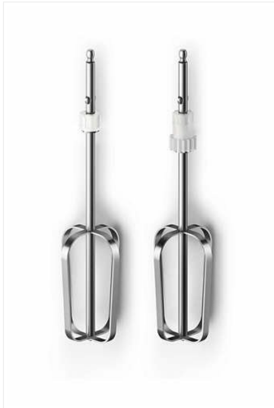
Image 2.2: A pair of stainless steel beaters, designed for whisking and mixing lighter ingredients.