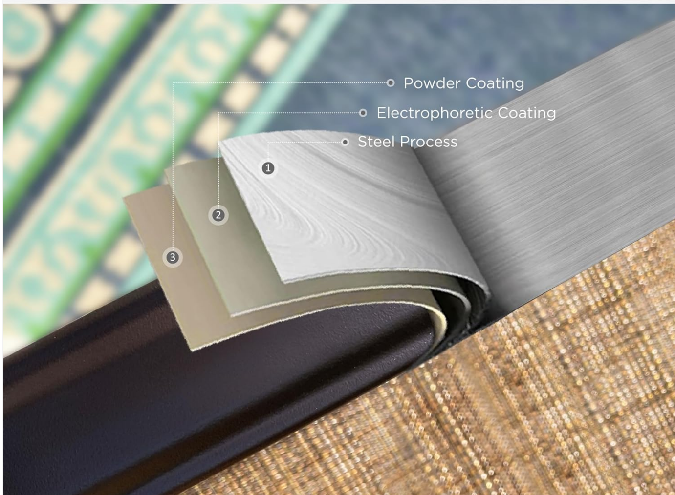
Image: Illustration of the Powder E-coating Frame technology, highlighting its rust-proof, heavy-duty, and long-lasting properties for the PHI VILLA Outdoor Swivel Bar Stools.