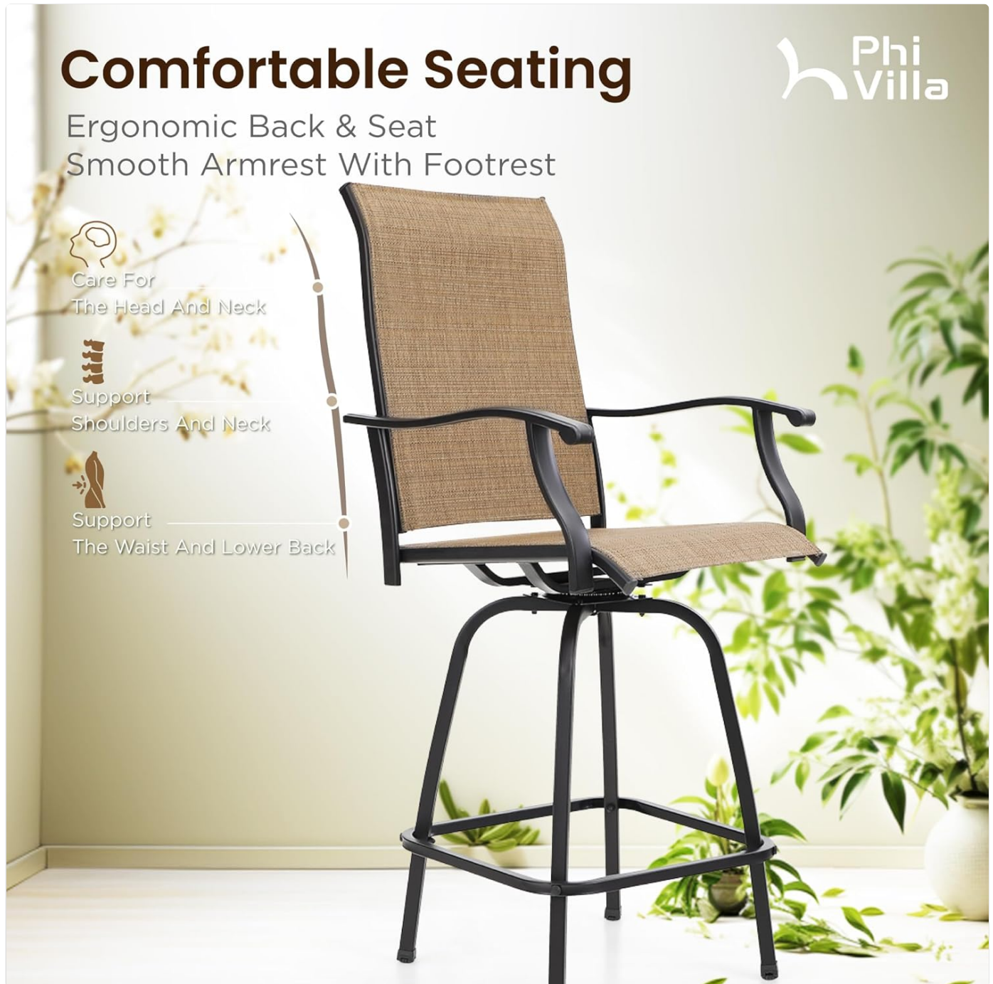
Image: Close-up of the PHI VILLA Outdoor Swivel Bar Stool highlighting its 360-degree swivel function with a rotating gear mechanism.

These bar stools are designed for outdoor use and feature a 360-degree swivel mechanism. To operate, simply sit comfortably and rotate the seat in any direction. The integrated footrest provides additional comfort and support.