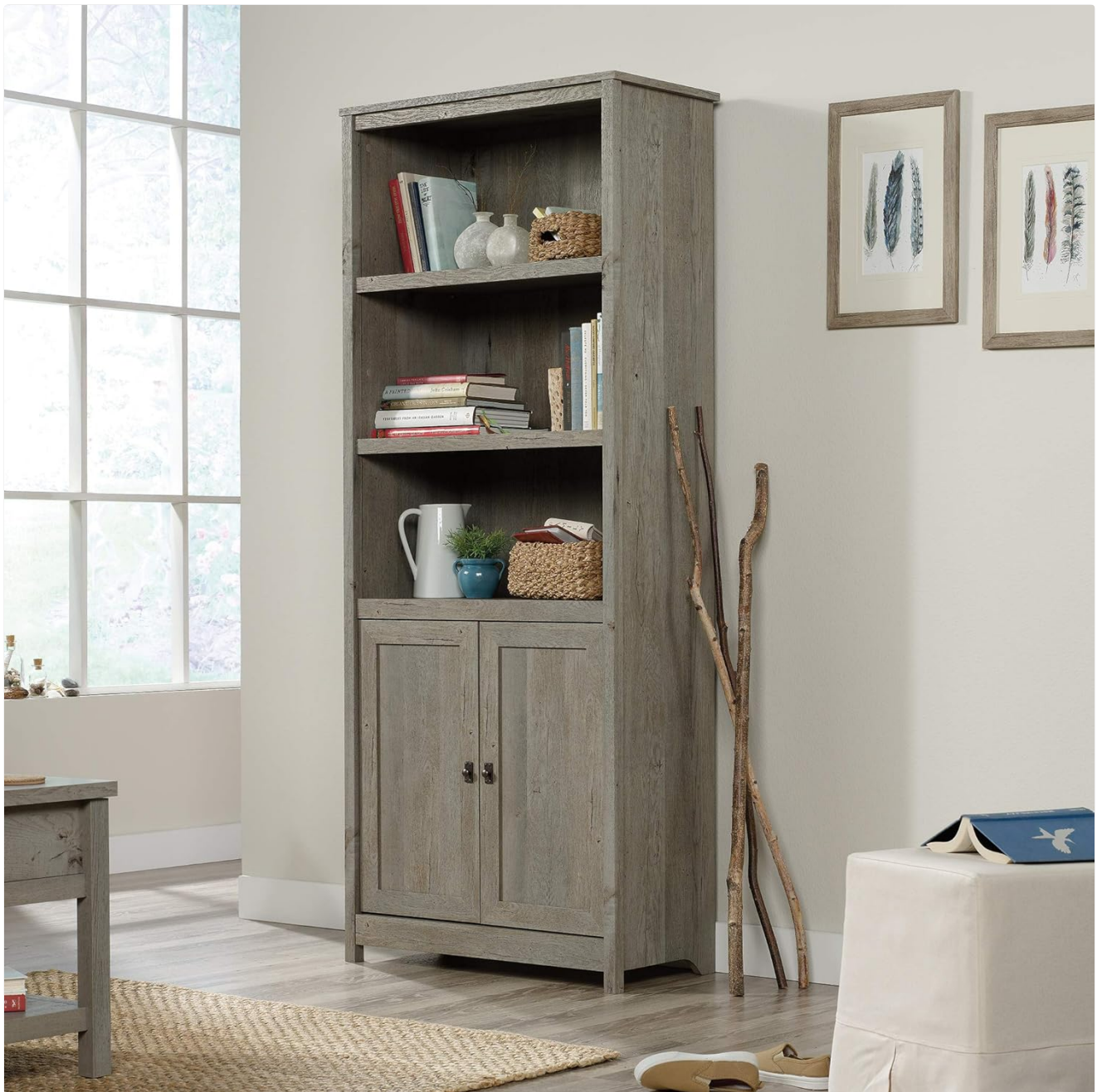
Figure 1.1: Sauder Cottage Road Book Shelf in a home environment.