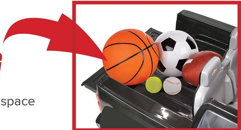
Image: A front view of the black Rollplay Chevy Silverado ride-on truck with both doors open, showing easy access. The tailgate is also open, revealing a storage area in the truck bed, which contains various sports balls.

OPENING TAILGATE for extra storage and space