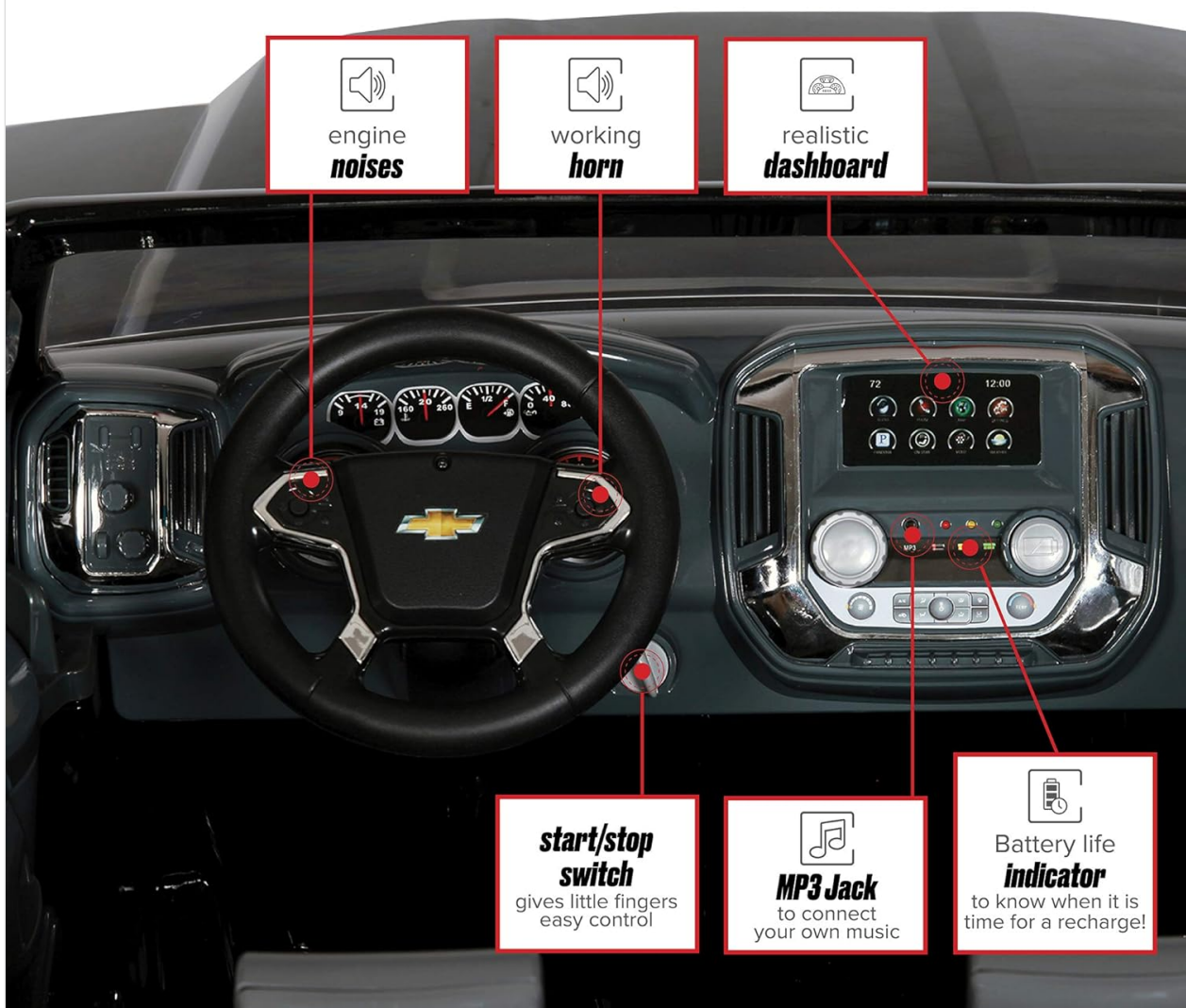
Image: A detailed view of the interactive dashboard of the ride-on truck. Labels point to features such as engine noises, a working horn, the realistic dashboard design, the start/stop switch, an MP3 jack for connecting external music devices, and a battery life indicator.

Your browser does not support the video tag.