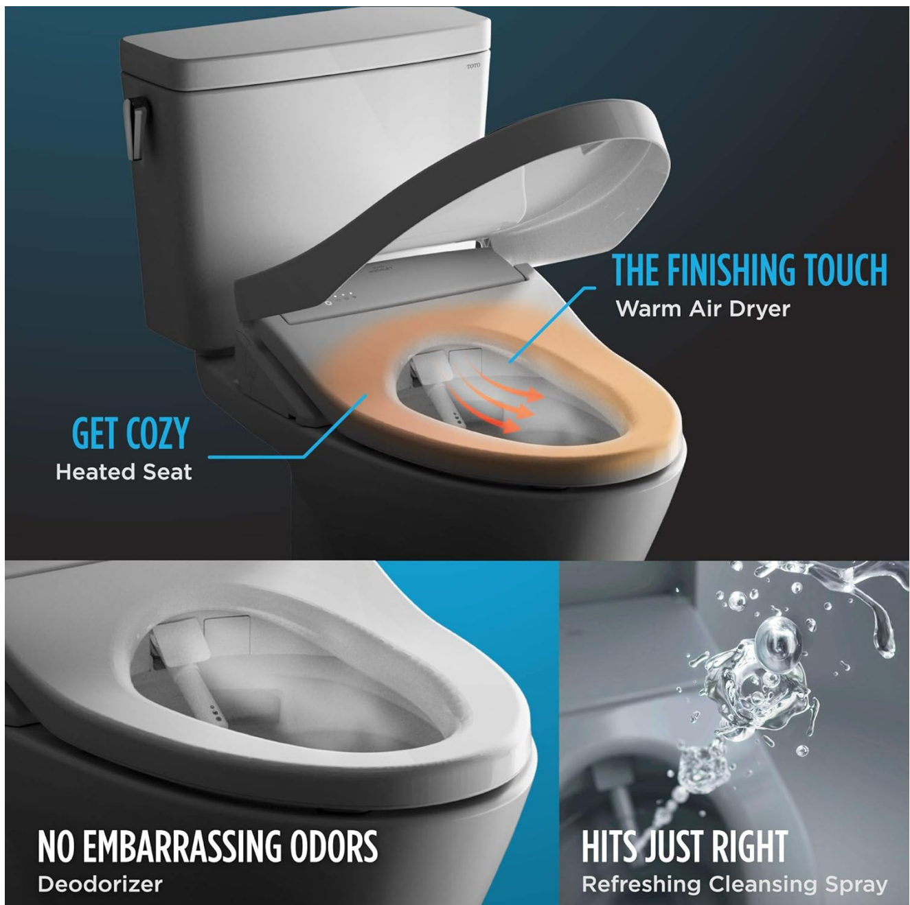
Figure 1: TOTO K300 Bidet Seat with highlighted features.