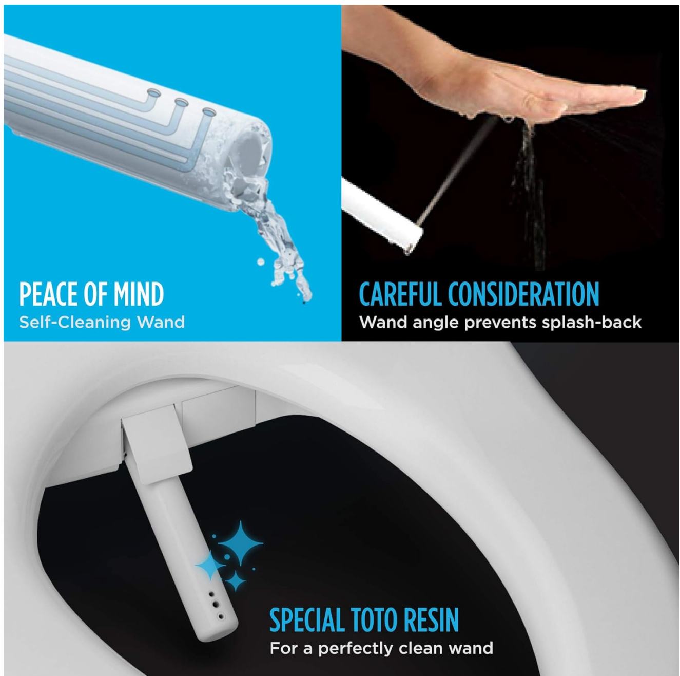
Figure 8: Self-cleaning wand mechanism.