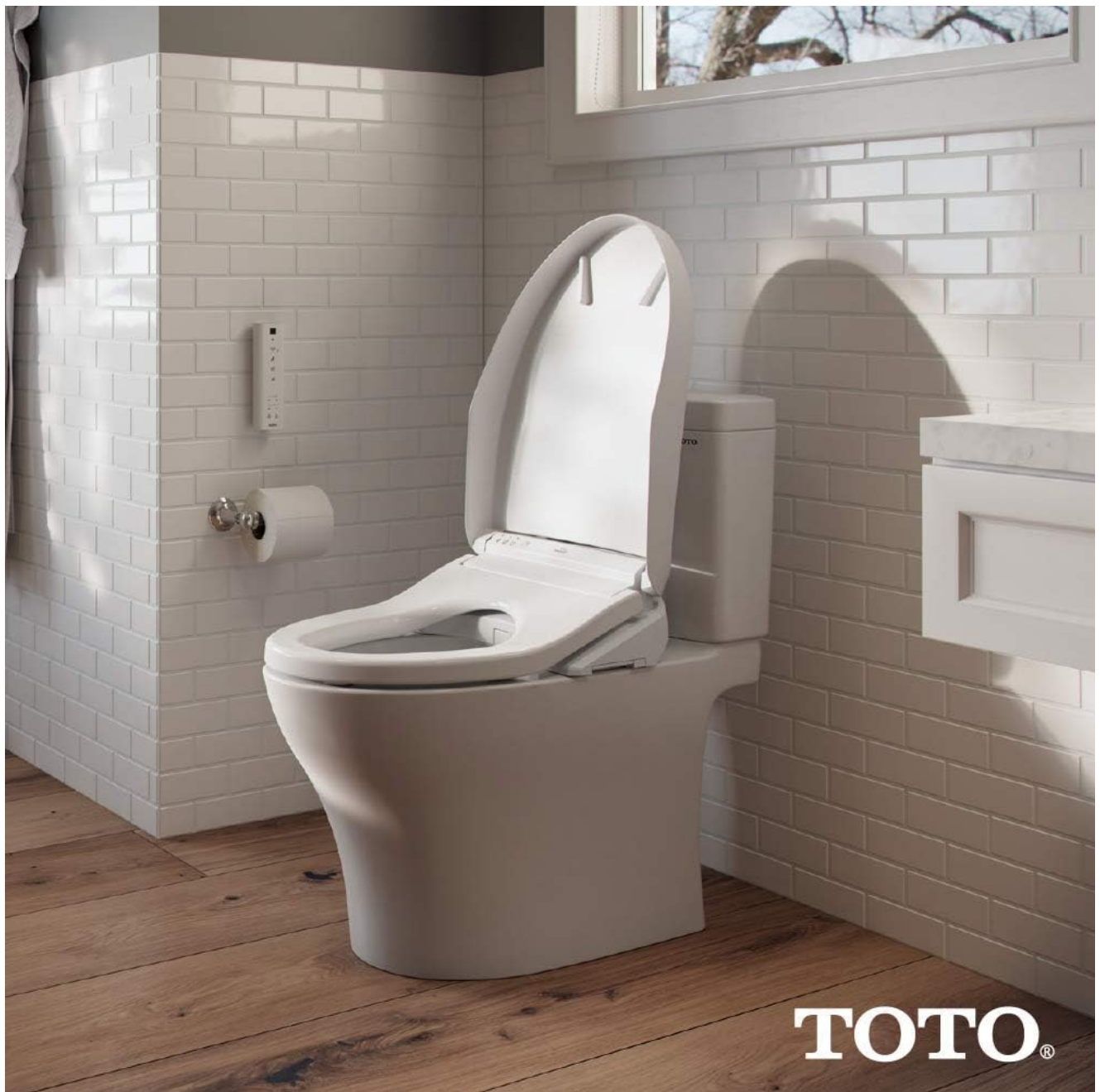
Figure 9: TOTO K300 Elongated Measurements.