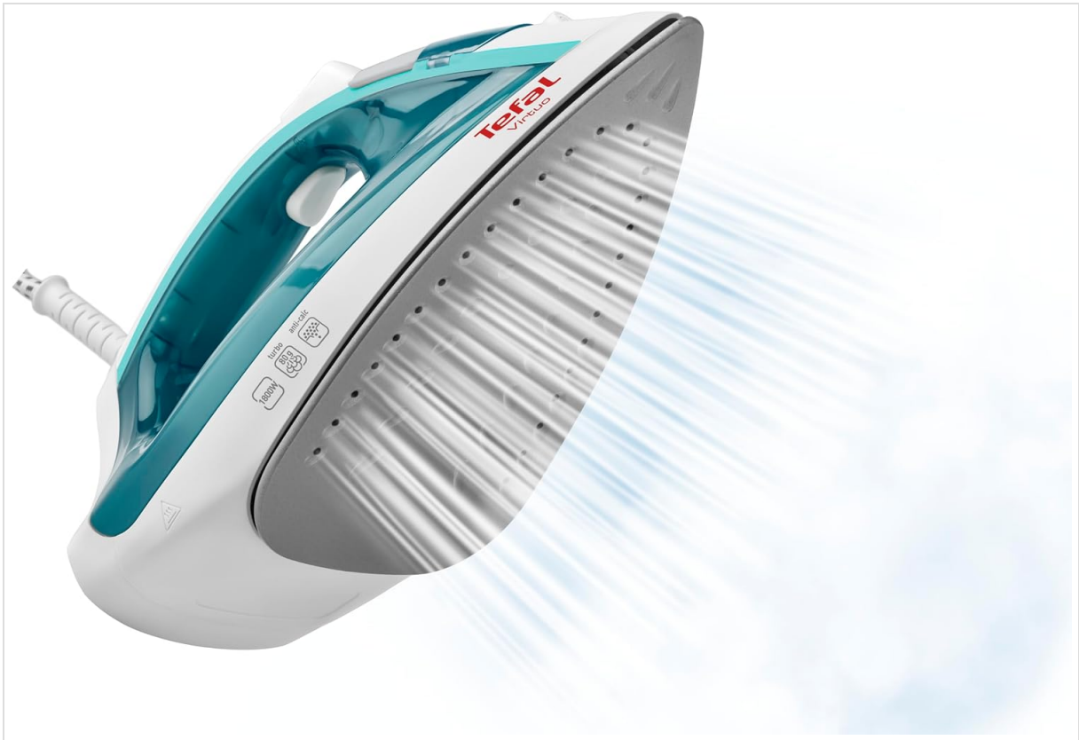
Image 4.1: The iron actively emitting steam from its soleplate, demonstrating the steam ironing function for effective wrinkle removal.