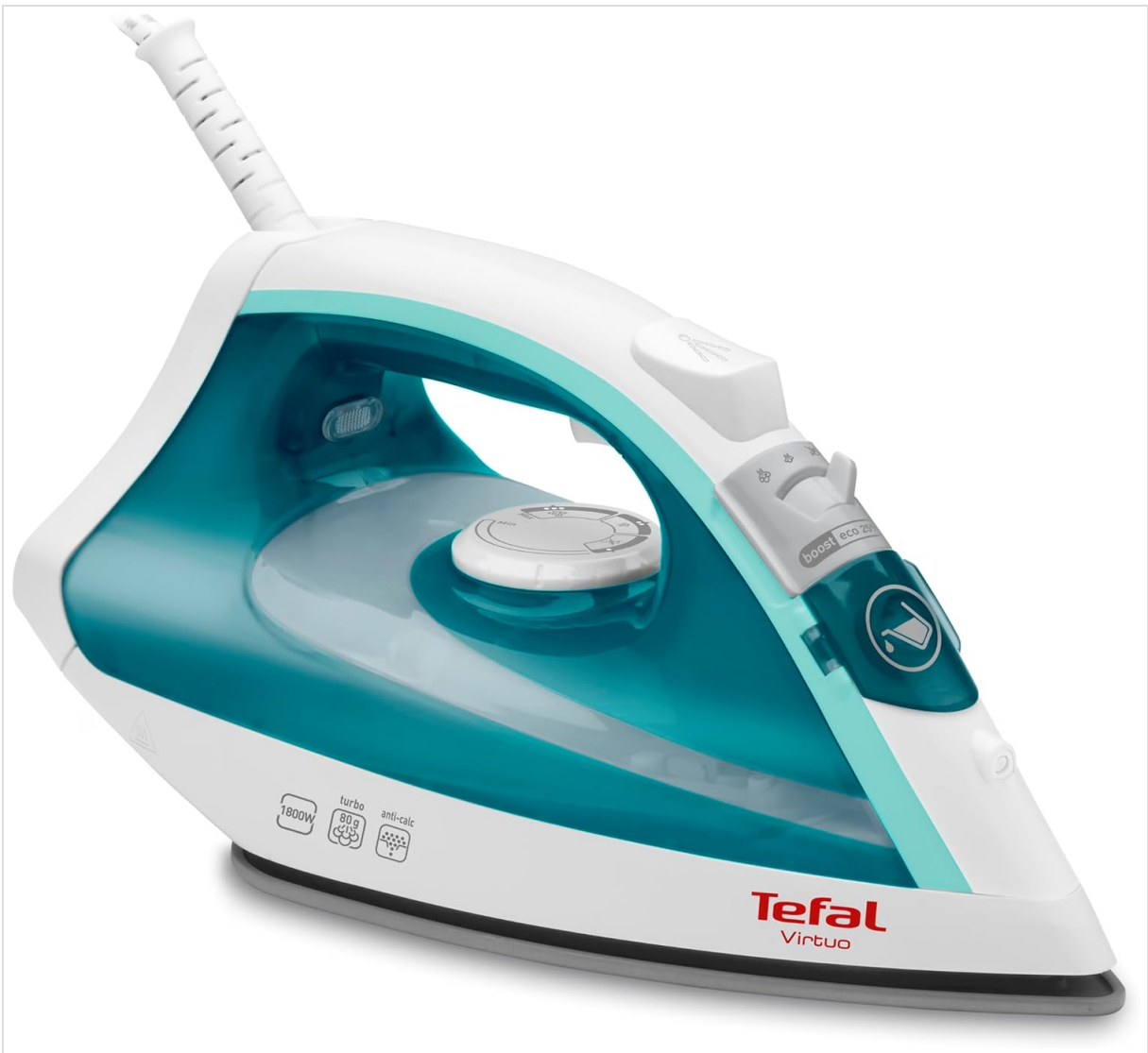
Image 2.2: A top-down view of the iron, highlighting the water tank, temperature dial, and steam/spray buttons for easy identification of controls.