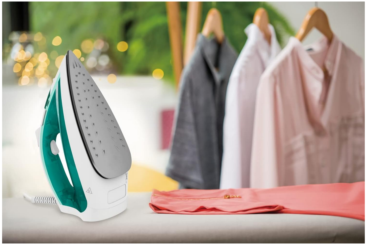
Image 4.2: The iron resting on an ironing board, with various garments hanging in the background, illustrating its use for both traditional and vertical steaming.