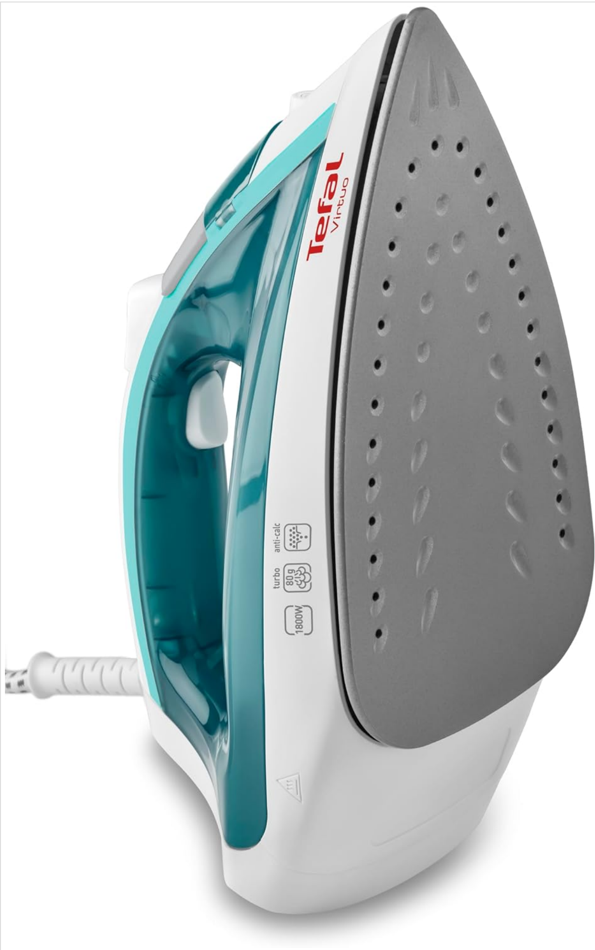
Image 2.3: A detailed view of the Durilium AirGlide soleplate, illustrating its numerous steam vents designed for even steam distribution and smooth gliding.