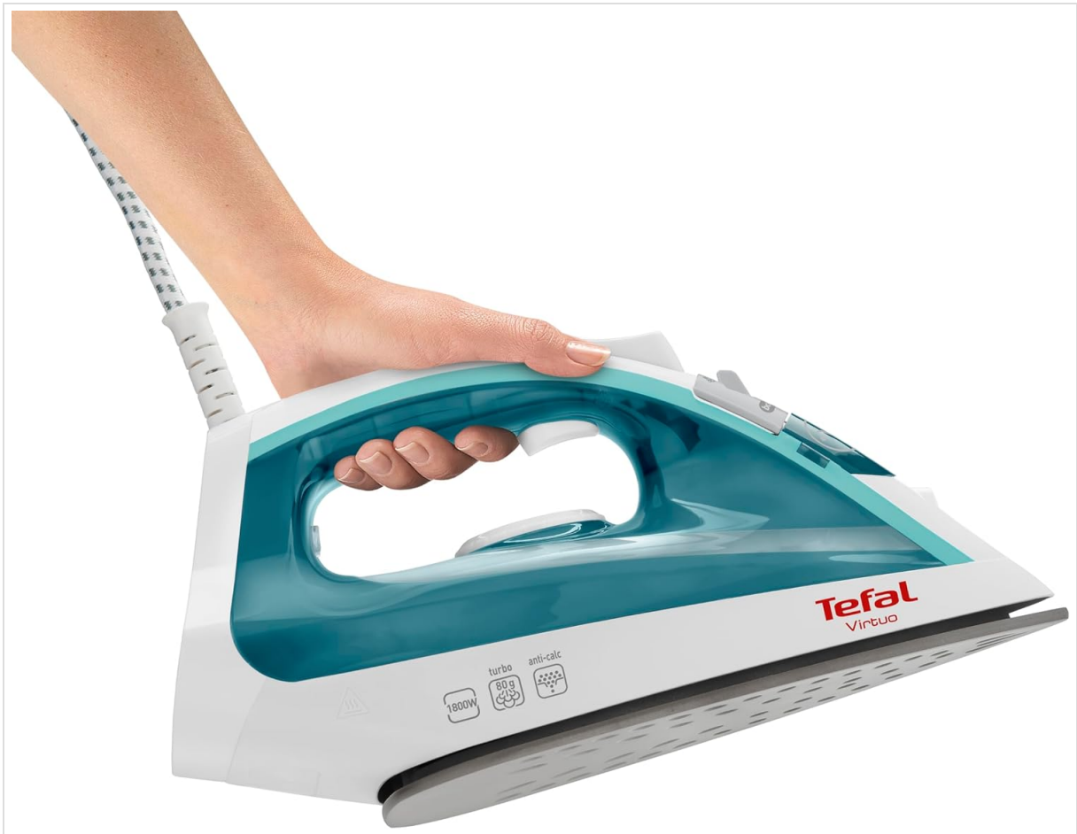
Image 2.1: The Tefal Virtuo FV1710 Steam Iron, showcasing its ergonomic design and vibrant green and white color scheme, held comfortably in a user's hand.