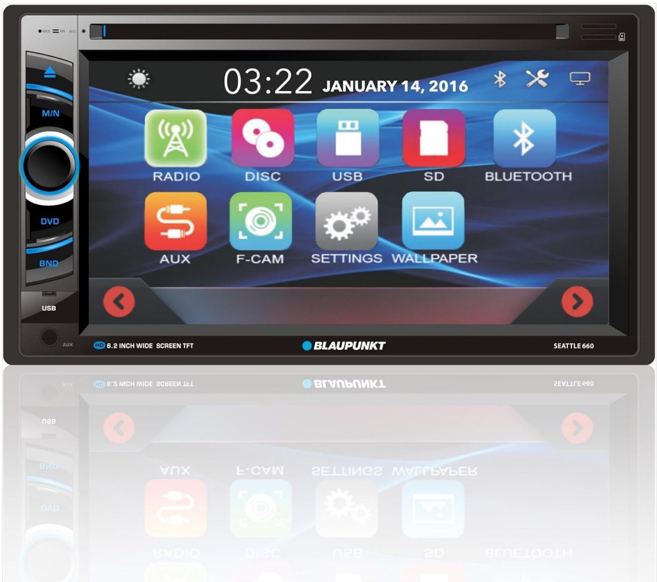
Figure 1: Front Panel and Touch Screen Display

This image displays the front of the SEATTLE 660 unit, highlighting the 6.2-inch touch screen. The screen shows a user interface with large, clear icons for different functions such as Radio, Disc, USB, SD, Bluetooth, AUX, F-CAM (Front Camera), Settings, and Wallpaper. On the left side of the unit, physical buttons for Menu/Navigation, DVD eject, and Band selection are visible, along with a rotary knob for volume and selection. A USB port is also located on the lower left.