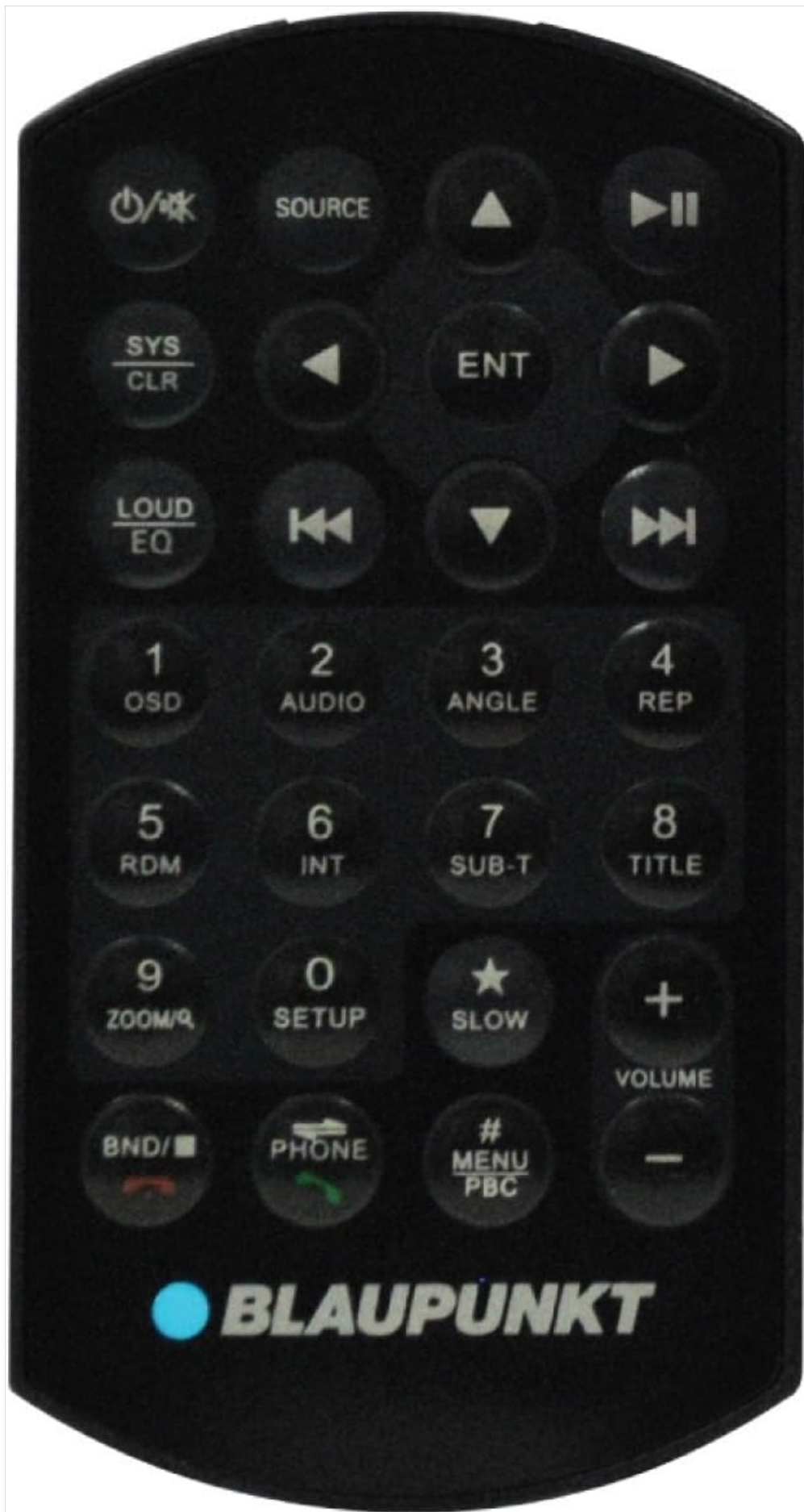
Figure 3: Remote Control

This image shows the included infrared remote control for the SEATTLE 660. The remote provides convenient access to various functions, including power on/off, source selection (Source), system clear (SYS CLR), audio settings (LOUD EQ), navigation buttons, numeric keypad for direct input, volume up/down, and dedicated buttons for Bluetooth phone calls (Phone, BND/Answer, Hang Up). This allows for control of the unit without directly interacting