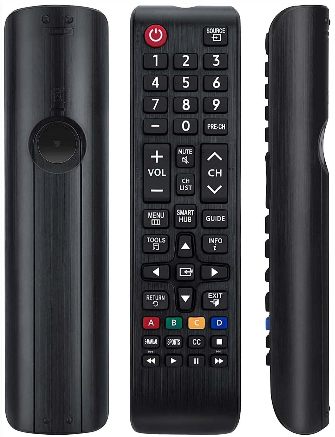
Figure 1: Front View of Remote Control