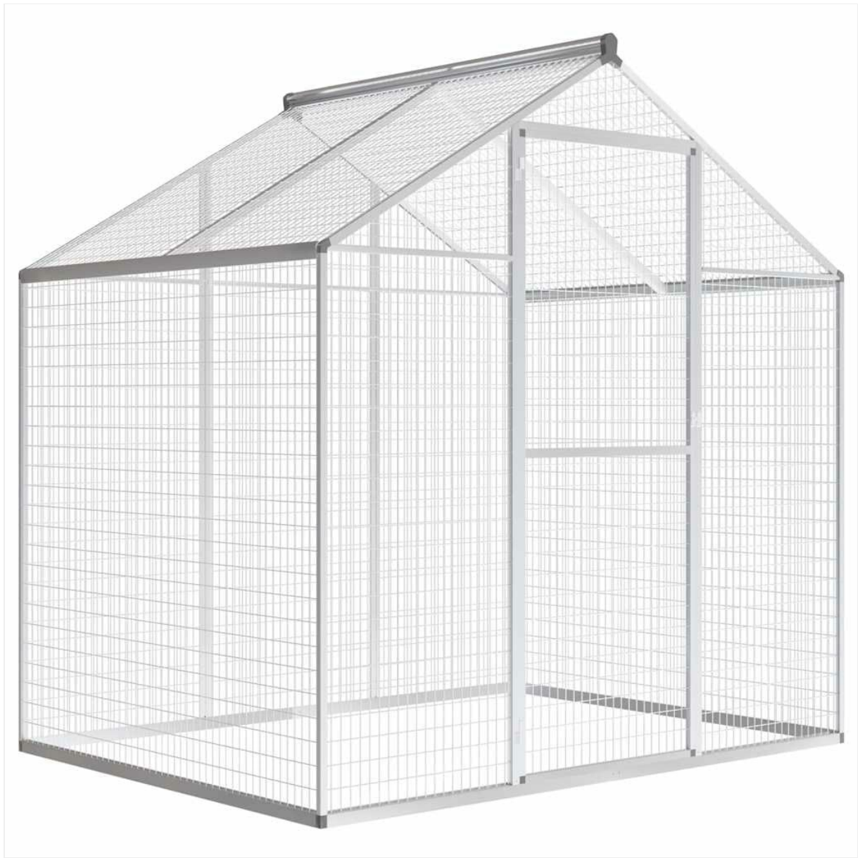
Figure 1: Overall dimensions of the aviary.