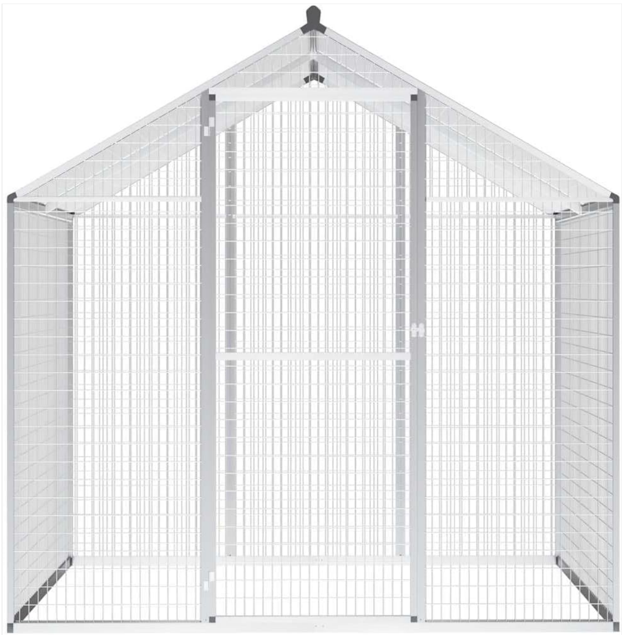
Figure 2: Front view of the aviary.