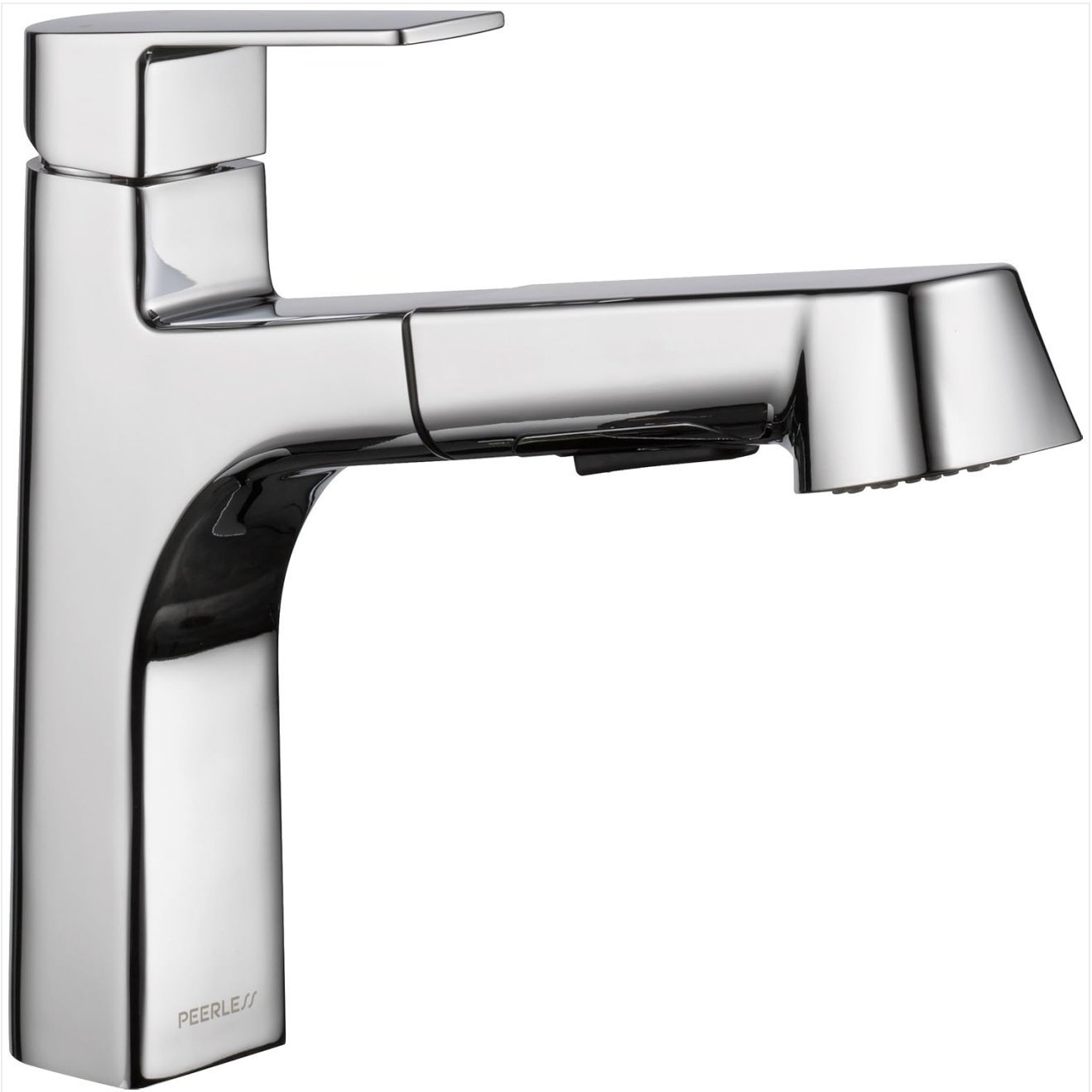
Image: The Peerless Xander P6919LF Chrome Pull-Out Kitchen Faucet, showcasing its modern design and chrome finish, installed in a kitchen setting.