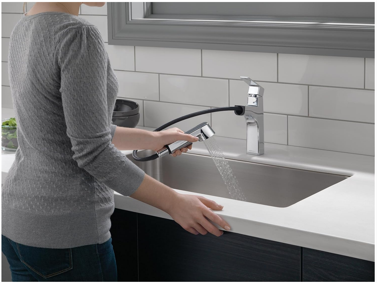
Image: A person demonstrating the use of the pull-out sprayer feature of the Peerless Xander kitchen faucet, showing the extended hose and spray function.