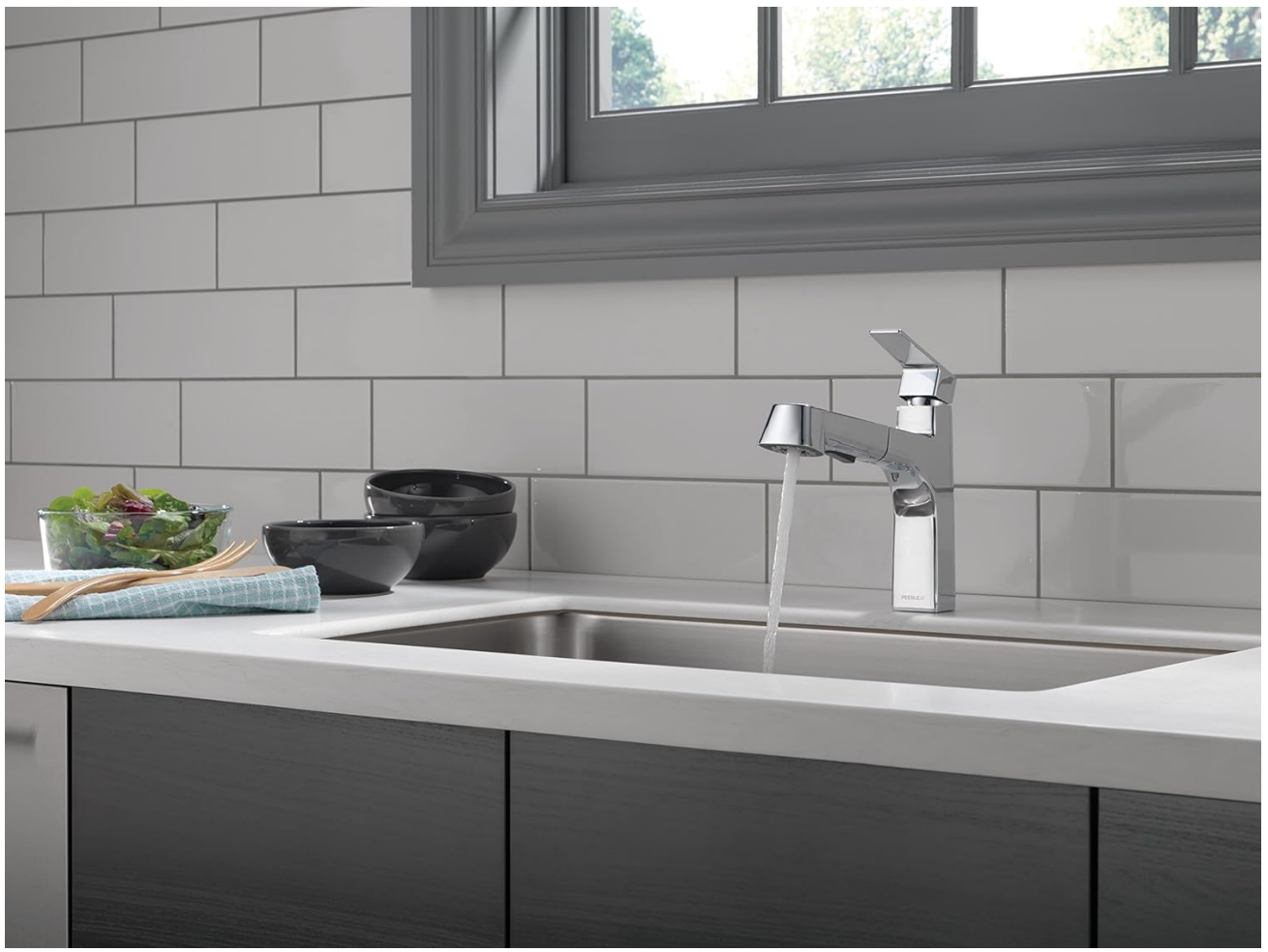
Image: The Peerless Xander kitchen faucet in operation, showing a steady stream of water flowing into the sink, demonstrating its standard water delivery mode.