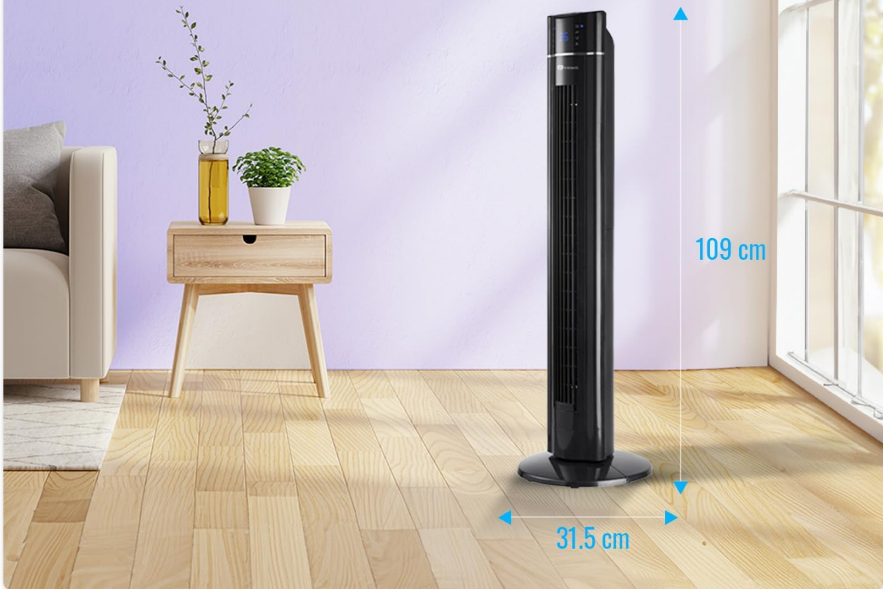
Image: The PureMate Tower Fan with its height (109 cm) and base width (31.5 cm) clearly marked, illustrating its compact and space-saving design.