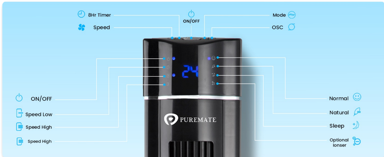
Image: Detailed diagram of the fan's control panel, illustrating the various buttons and their corresponding functions such as ON/OFF, Speed, Mode, and Oscillation.