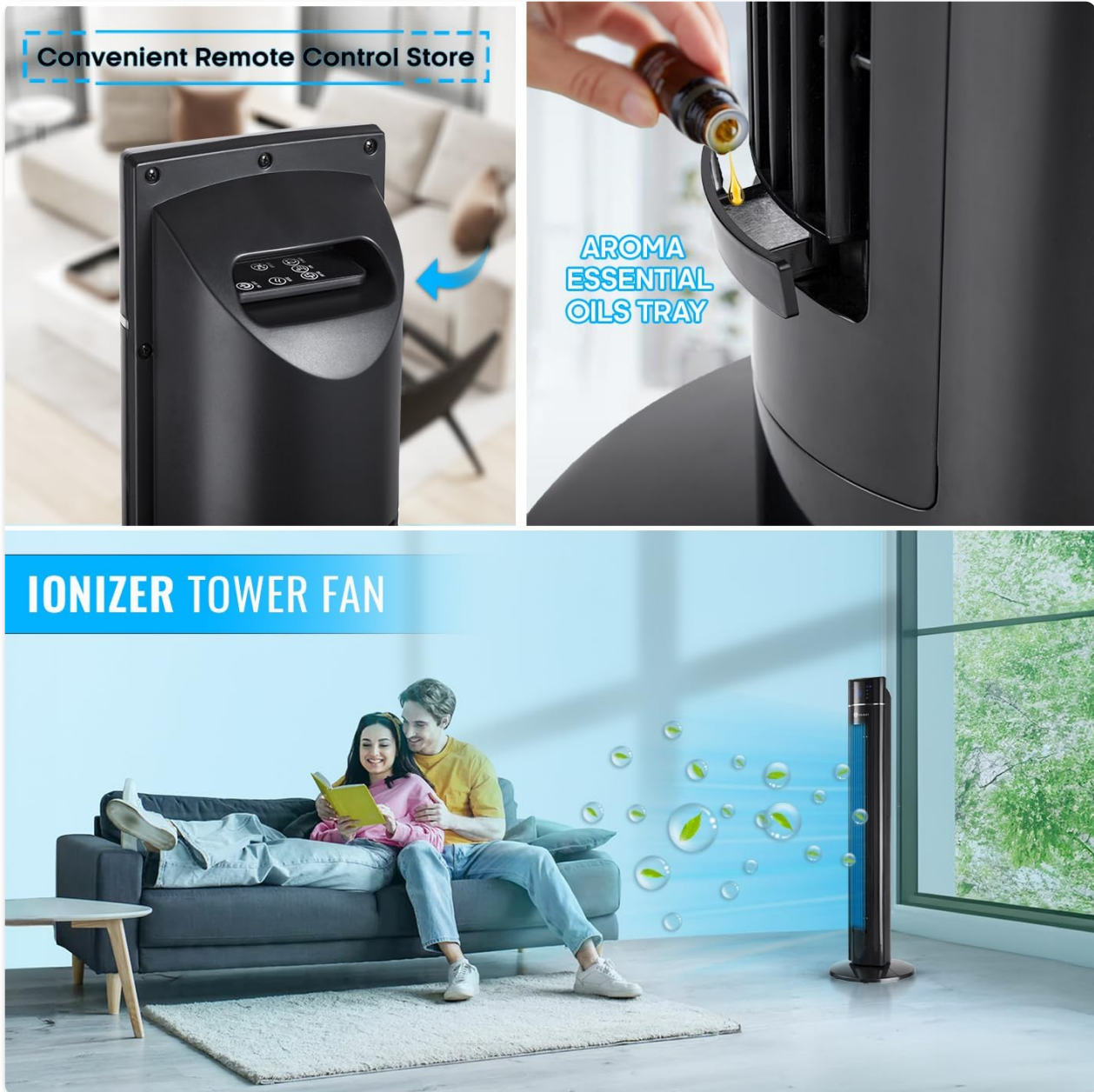
Image: A close-up view of the PureMate Tower Fan's aroma essential oils tray, showing how to add drops of oil for fragrance diffusion.