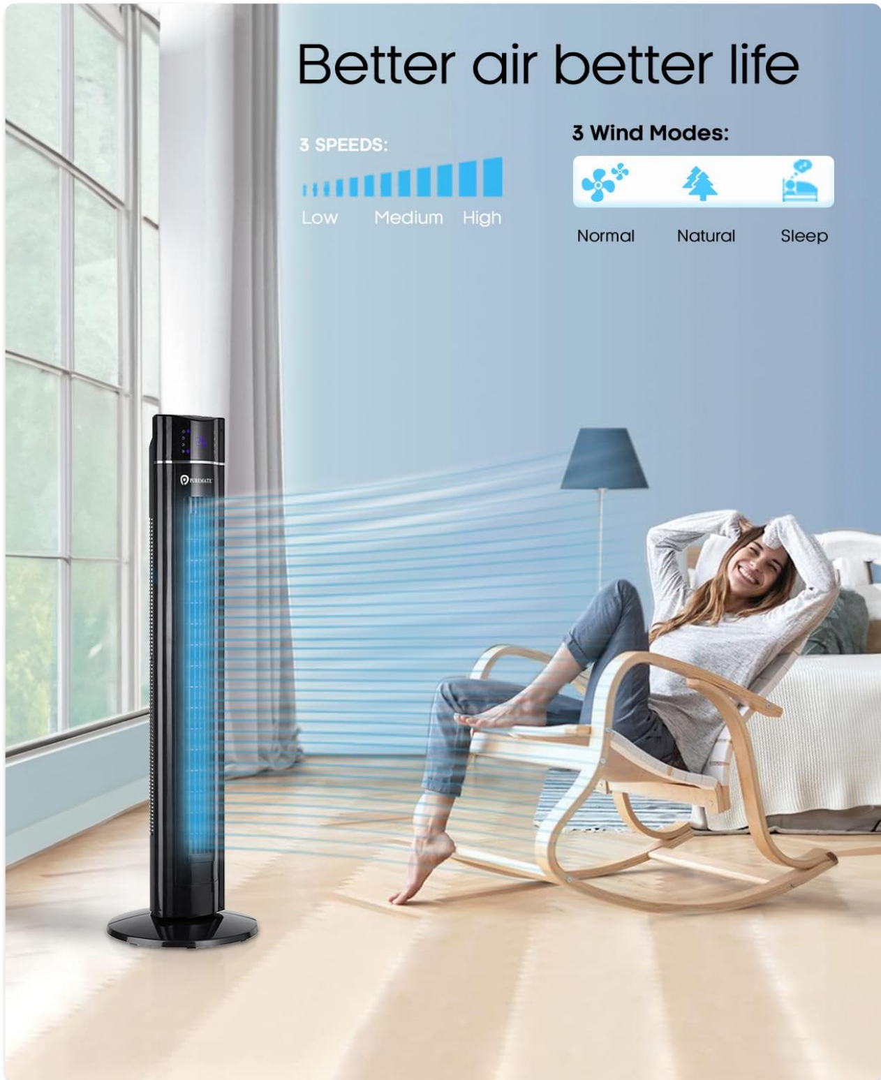
Image: The PureMate Tower Fan demonstrating its three speed settings (Low, Medium, High) and three wind modes (Normal, Natural, Sleep) for customized comfort.