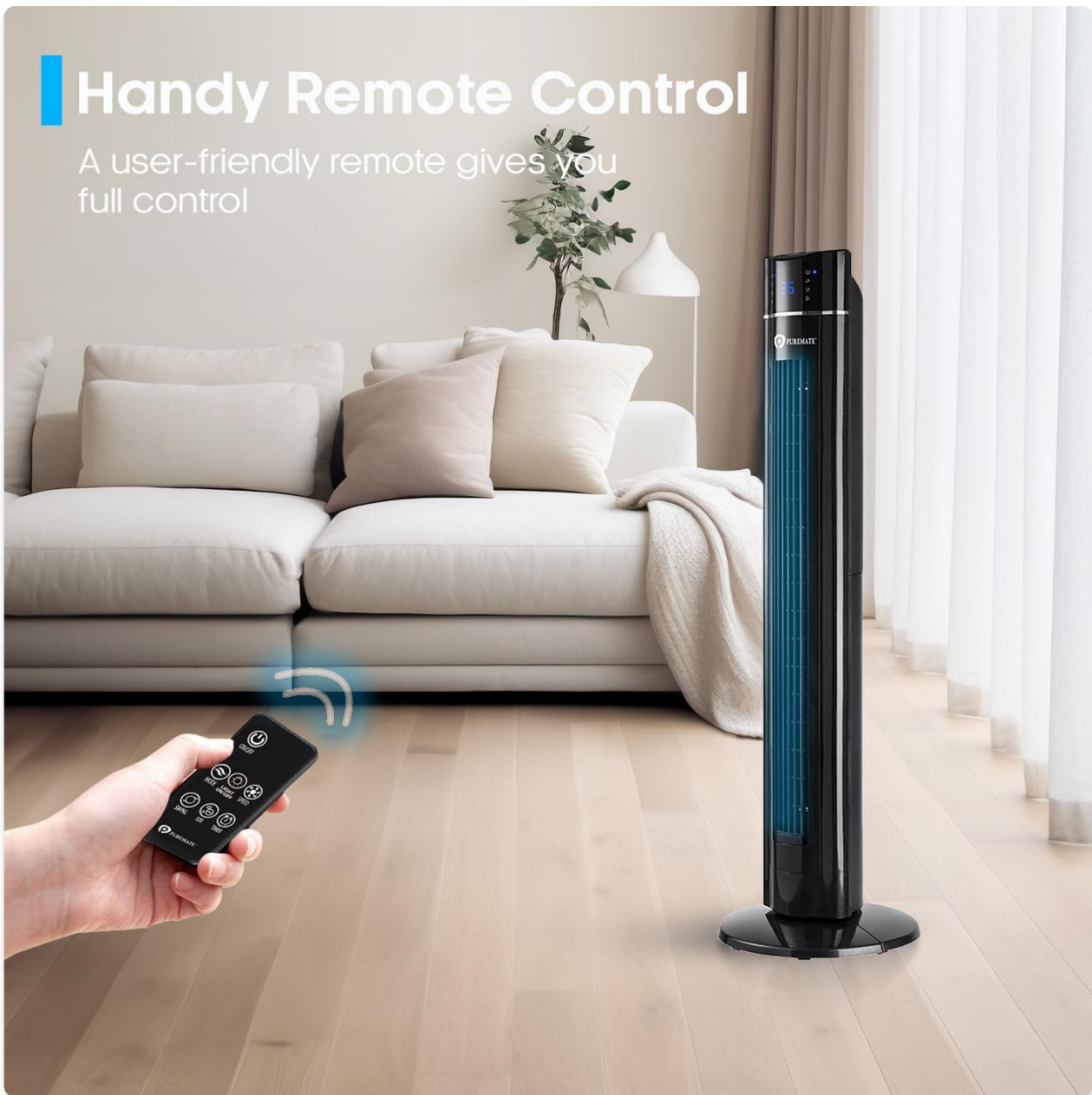
Image: A hand holding the remote control, demonstrating its use to operate the PureMate Tower Fan from a comfortable distance.

A user-friendly remote gives you full control