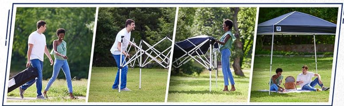
Image: A visual guide demonstrating the steps to set up the canopy, including unfolding the frame, extending the legs, and securing it.