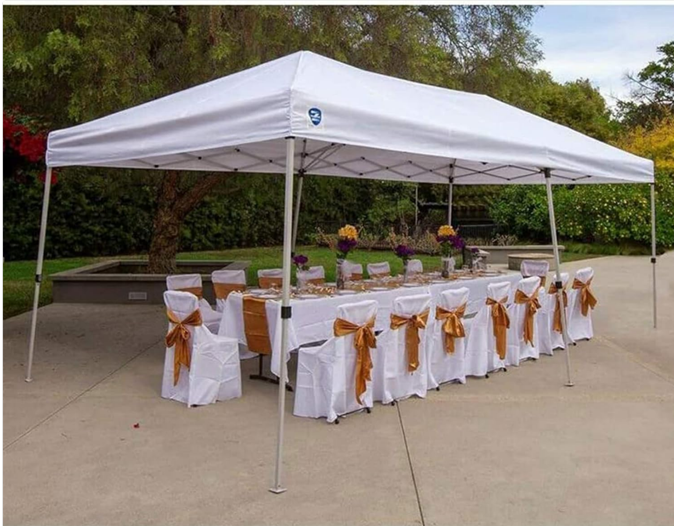
Image: The Z-Shade canopy providing shade over a long dining table setup on a patio, illustrating its use for events.