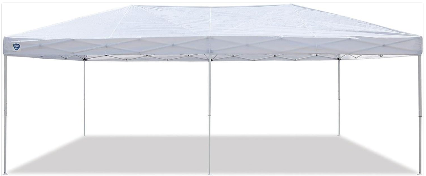
Image: The Z-Shade Everest Instant Canopy in its fully extended state, showcasing its large coverage area.