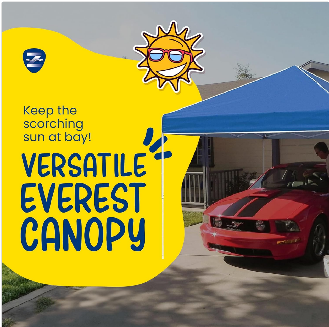
Image: The Z-Shade Everest canopy fully set up, providing shade in an outdoor environment.