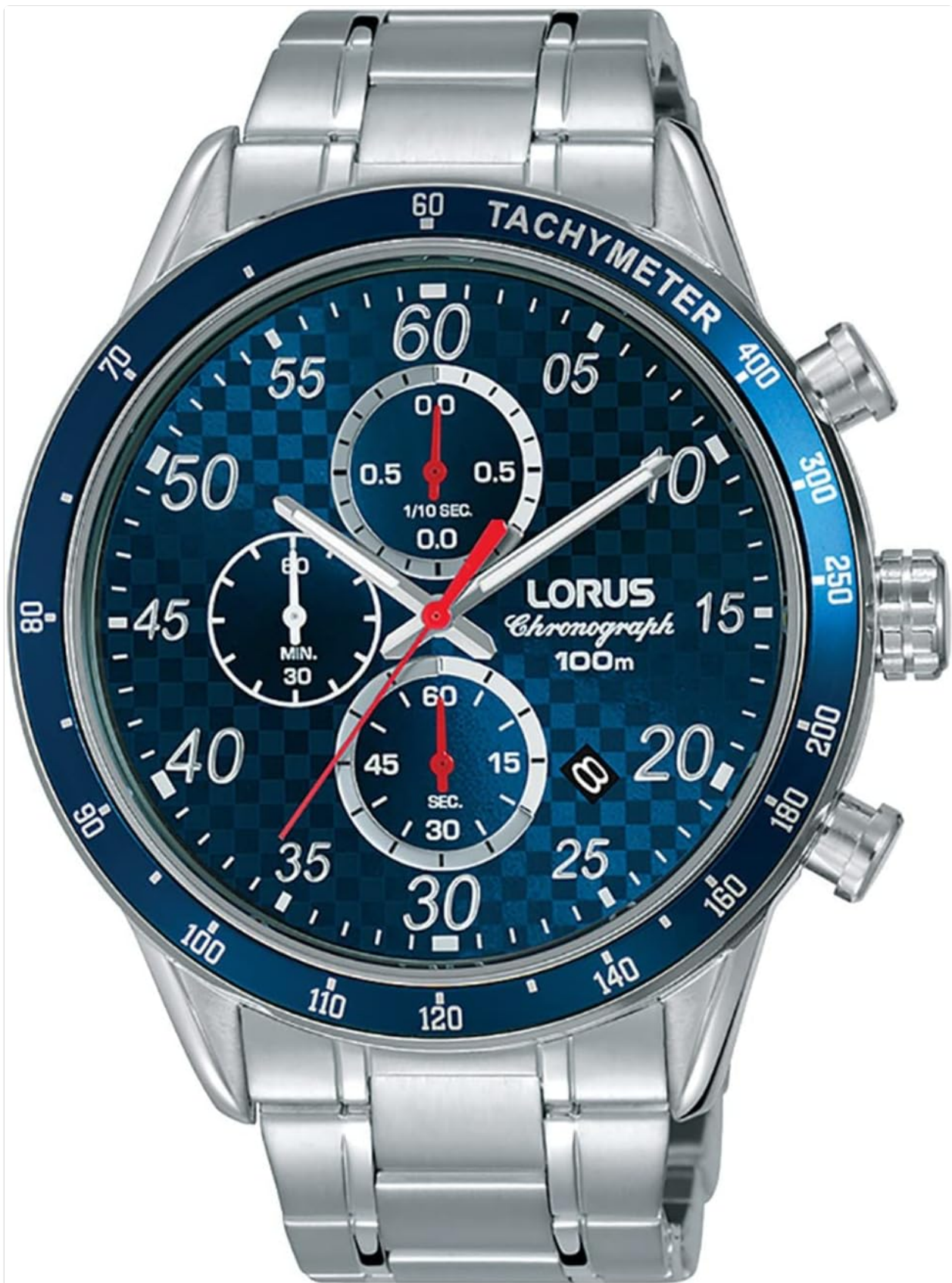
Image of the Lorus RM329EX9 chronograph watch, featuring a blue dial with a checkered pattern, three sub-dials, a date window, and a silver-tone stainless steel bracelet. The bezel includes a tachymeter scale.