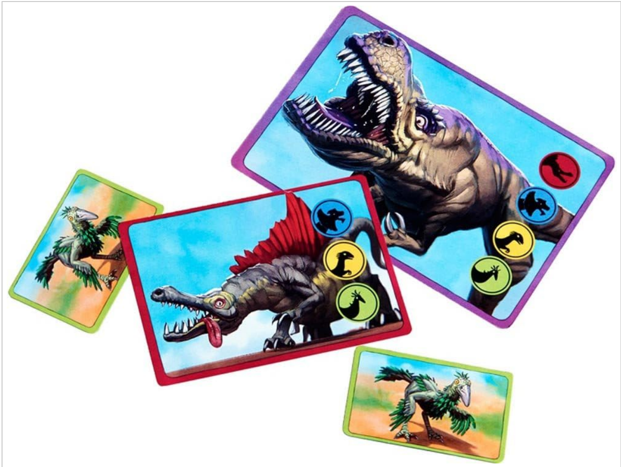
Image: A selection of dinosaur cards, including T-rex, Spinosaurus, and Archaeopteryx, showing their different sizes and colors.