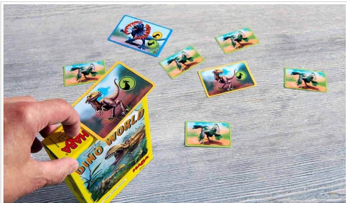
Image: A hand is shown flicking a yellow Velociraptor card off the game box, aiming for other cards on the table.