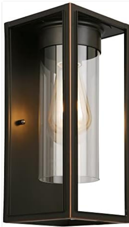
Image: Product dimensions for installation planning. The light measures 5.37 inches in length, 5.23 inches in width, and 12.01 inches in height.

Carefully align the fixture with the mounting bracket and secure it using the provided screws or nuts. Ensure a tight seal against the mounting surface to prevent water intrusion.