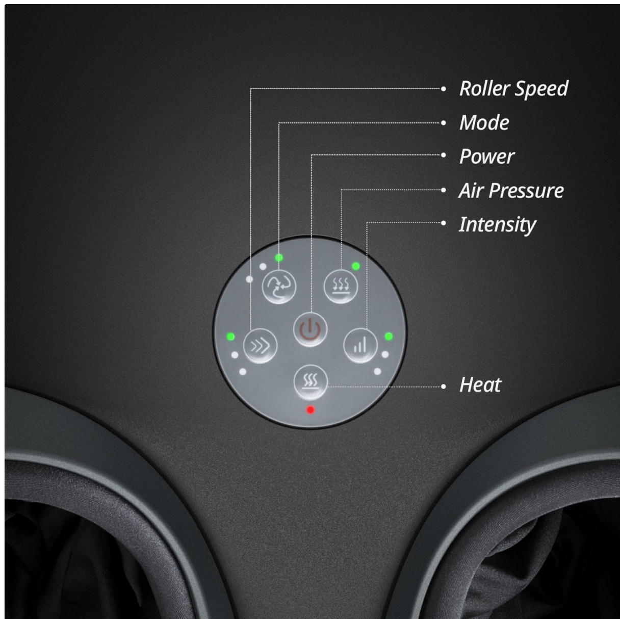
Figure 5: Control Panel Layout