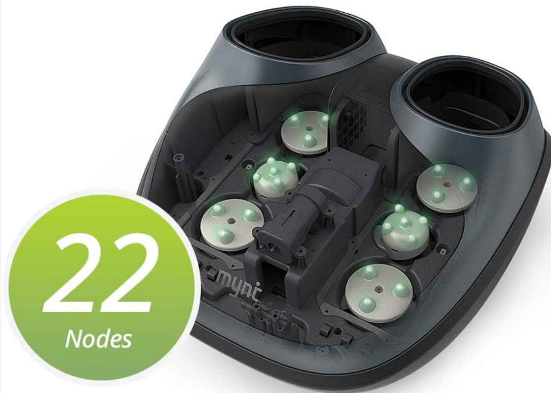
Figure 3: 22 Massage Nodes for Targeted Relief

Innovative design ensures masseuse-grade, pressure point treatment.