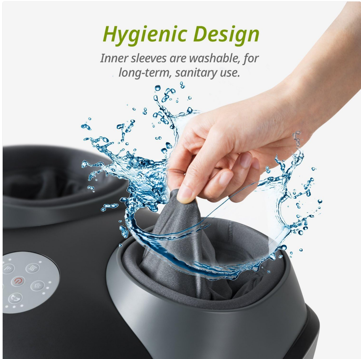
Figure 6: Removing Washable Inner Sleeves