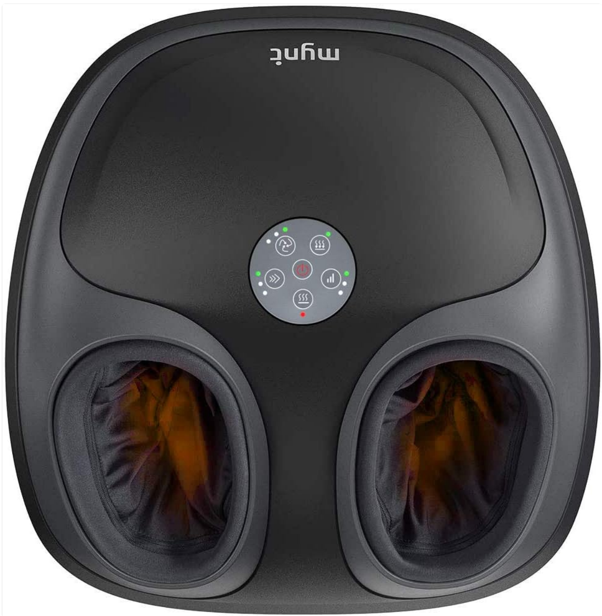
Figure 1: Mynt Foot Massager (Top View)