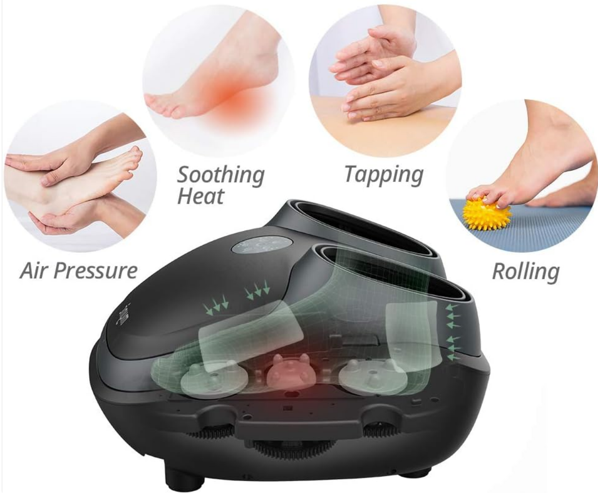
Figure 2: Internal Massage Mechanisms

Total coverage and air compression deliver a fuller-foot massage.