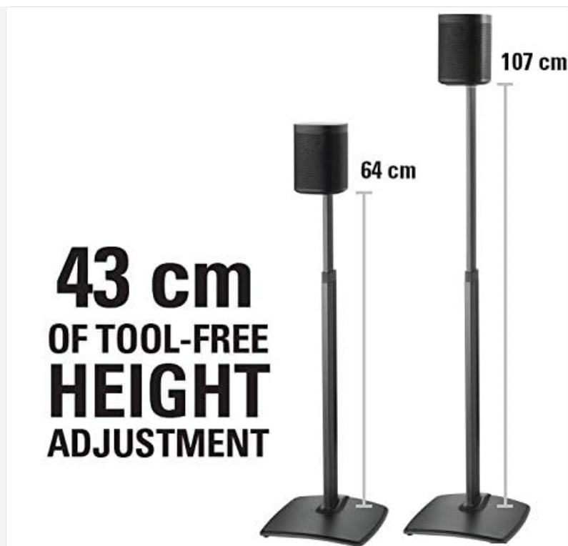
Image: Diagram illustrating the height adjustment range of the stand, showing minimum height at 64 cm and maximum height at 107 cm, providing 43 cm of tool-free adjustment.