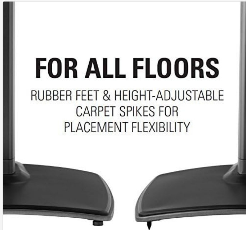
Image: Close-up of the stand's base showing both rubber feet for hard floors and height-adjustable carpet spikes for carpeted floors, offering placement flexibility.