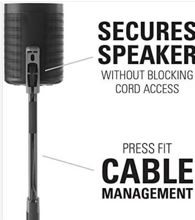
Image: A detailed view of the speaker stand's column, illustrating the Press Fit cable management system that conceals speaker cords for a clean look.