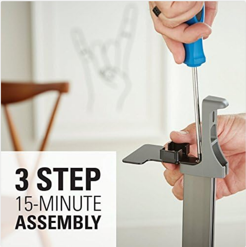
Image: A close-up of a hand using a screwdriver to attach a component, illustrating the simple 3-step, 15-minute assembly process.