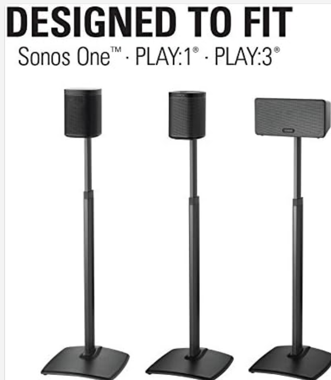
Image: A visual representation of the stand's compatibility with Sonos One, Play:1, and Play:3 speakers, showing how each speaker model fits on the stand.