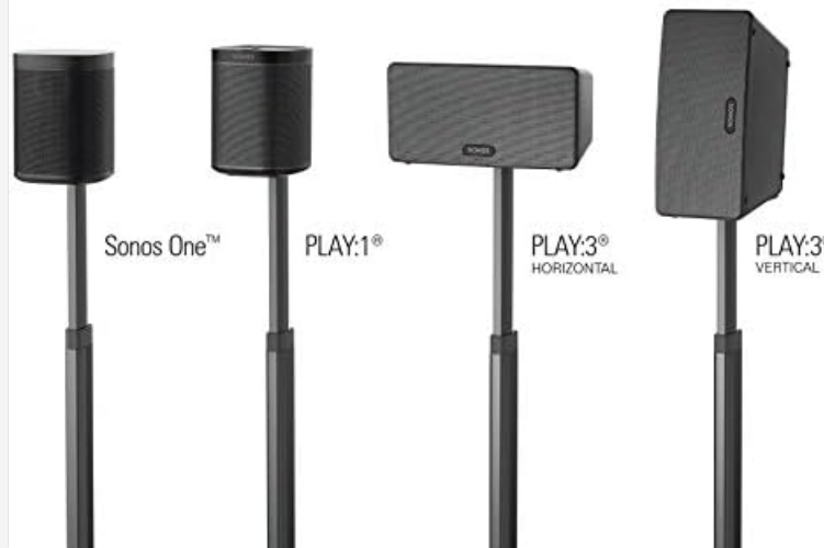
Image: A diagram illustrating the versatility of the stand, showing how it can be used with Sonos One, Play:1, and Play:3 (both horizontally and vertically mounted).