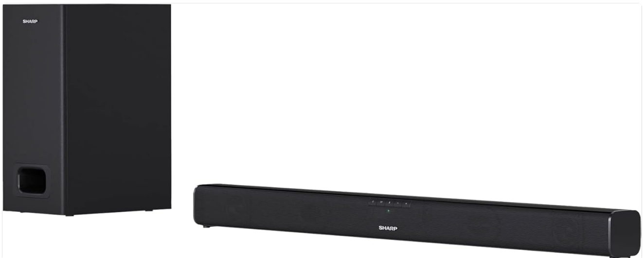
Figure 1.1: Sharp HT-SBW110 Soundbar and Subwoofer

The HT-SBW110 is a powerful 2.1 channel soundbar system designed to enhance your audio experience, featuring 180W total RMS power, a dedicated wireless subwoofer, and versatile connectivity options including Bluetooth, HDMI ARC, Optical, and AUX inputs.