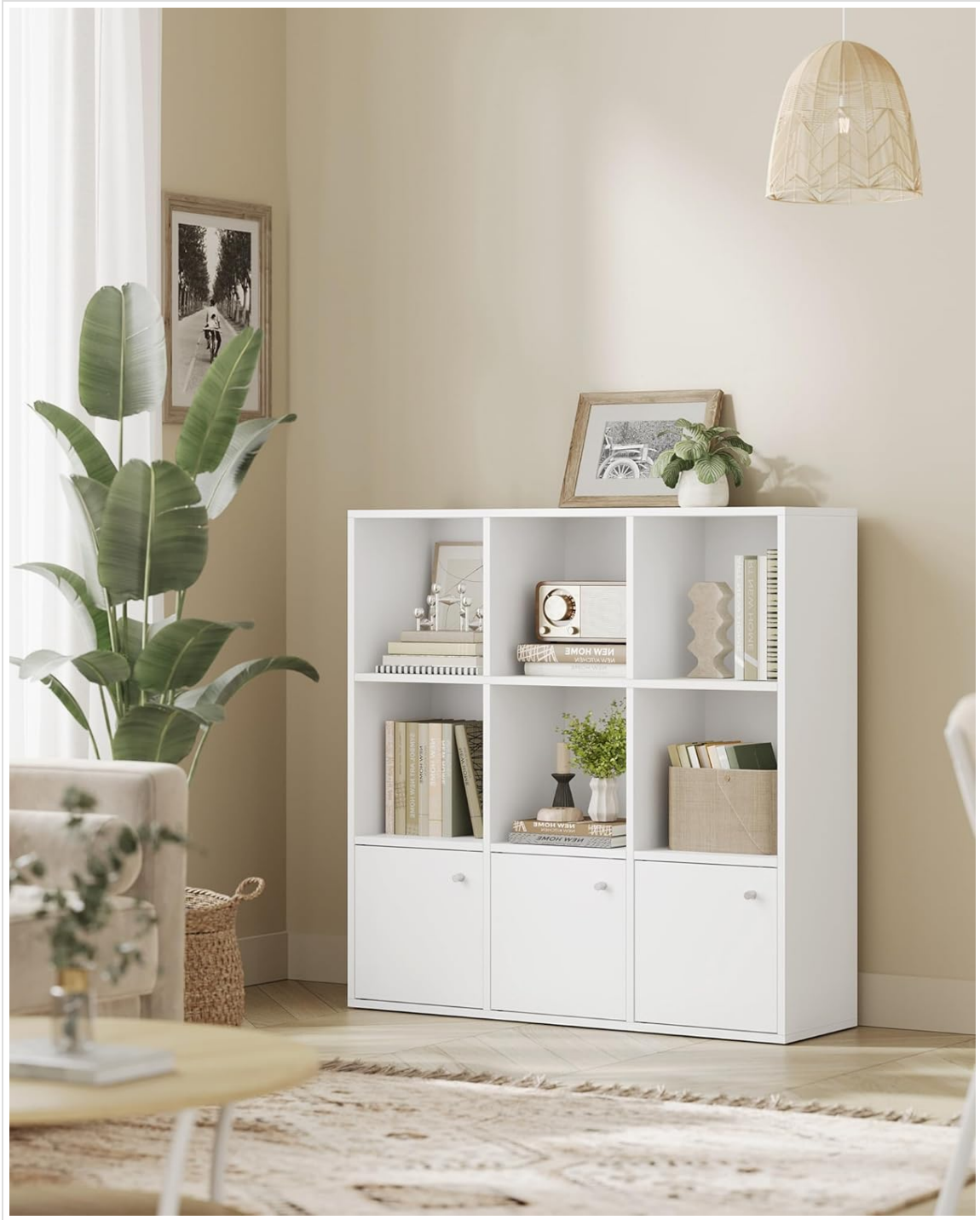
The fully assembled VASAGLE LBC33WT Bookshelf, showcasing its 6 open cubes and 3 closed compartments.