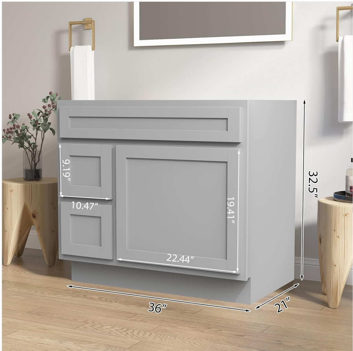
Image: A detailed view of the vanity cabinet with key dimensions (width, depth, height, drawer sizes) clearly labeled for reference.