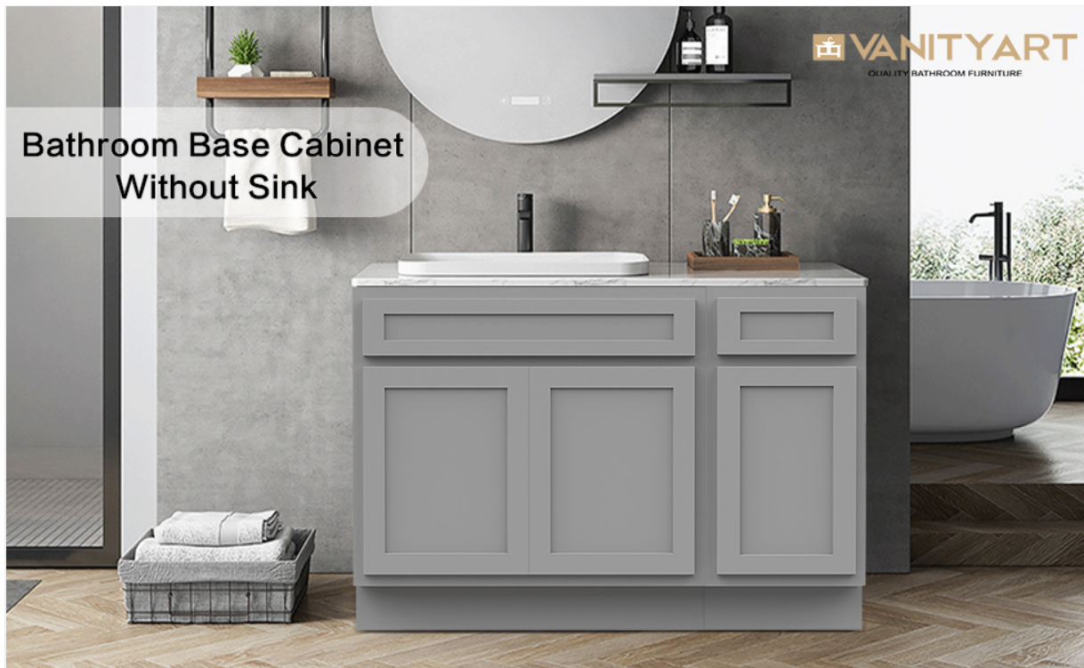
Image: The Vanity Art 36-inch single bathroom vanity base cabinet, shown without a sink, highlighting its design and potential use in a bathroom setting.

This manual provides detailed instructions for the assembly, installation, and maintenance of your Vanity Art 36 Inch Single Bathroom Vanity Base Cabinet, model VA4036-2LG. Please read all instructions carefully before beginning assembly to ensure safe and correct installation. Keep this manual for future reference.