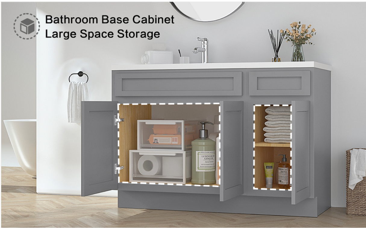
Image: An illustration of the vanity cabinet with its doors and drawers open, demonstrating the large storage capacity for various bathroom items.