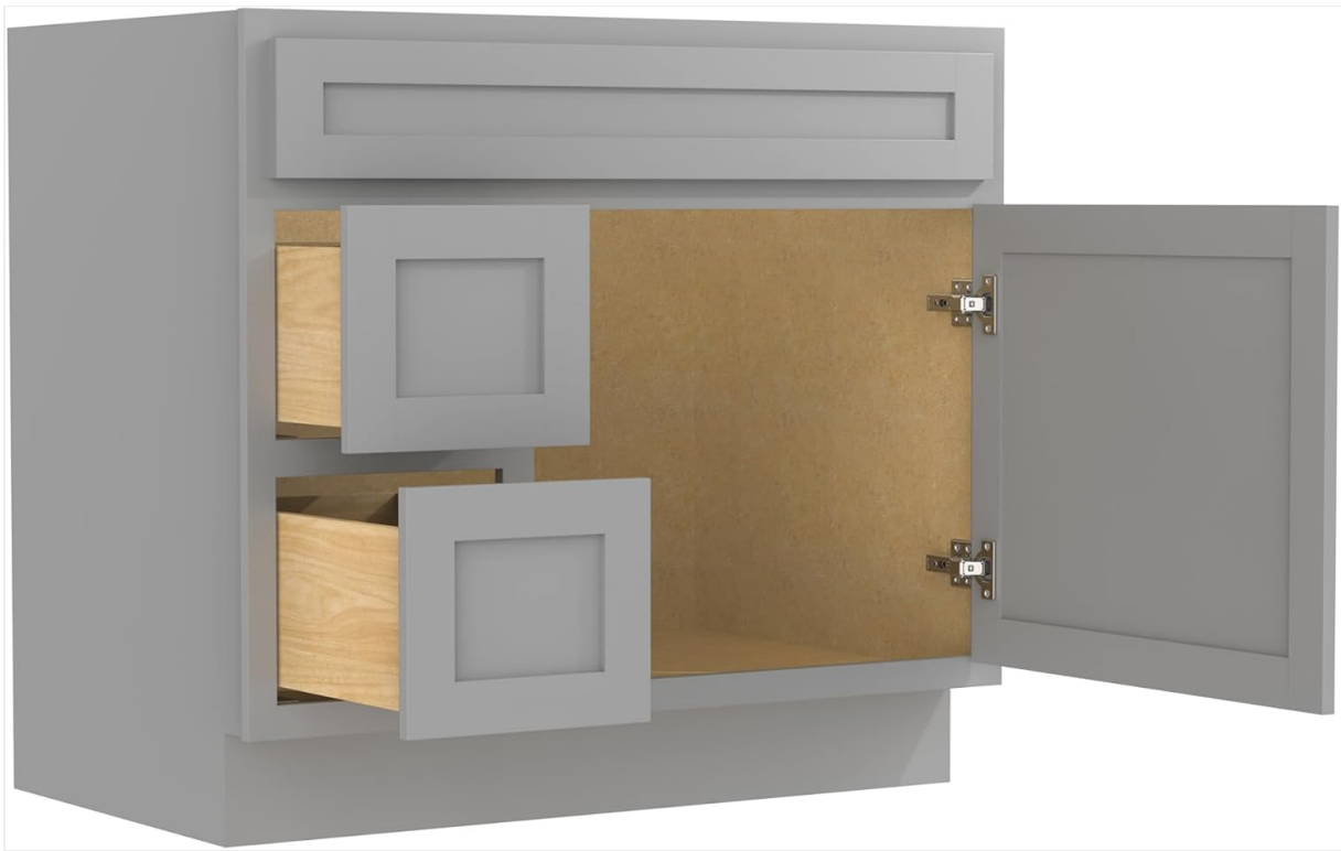
Image: The vanity cabinet with its main door open, showing the interior storage space and the installed hinges.