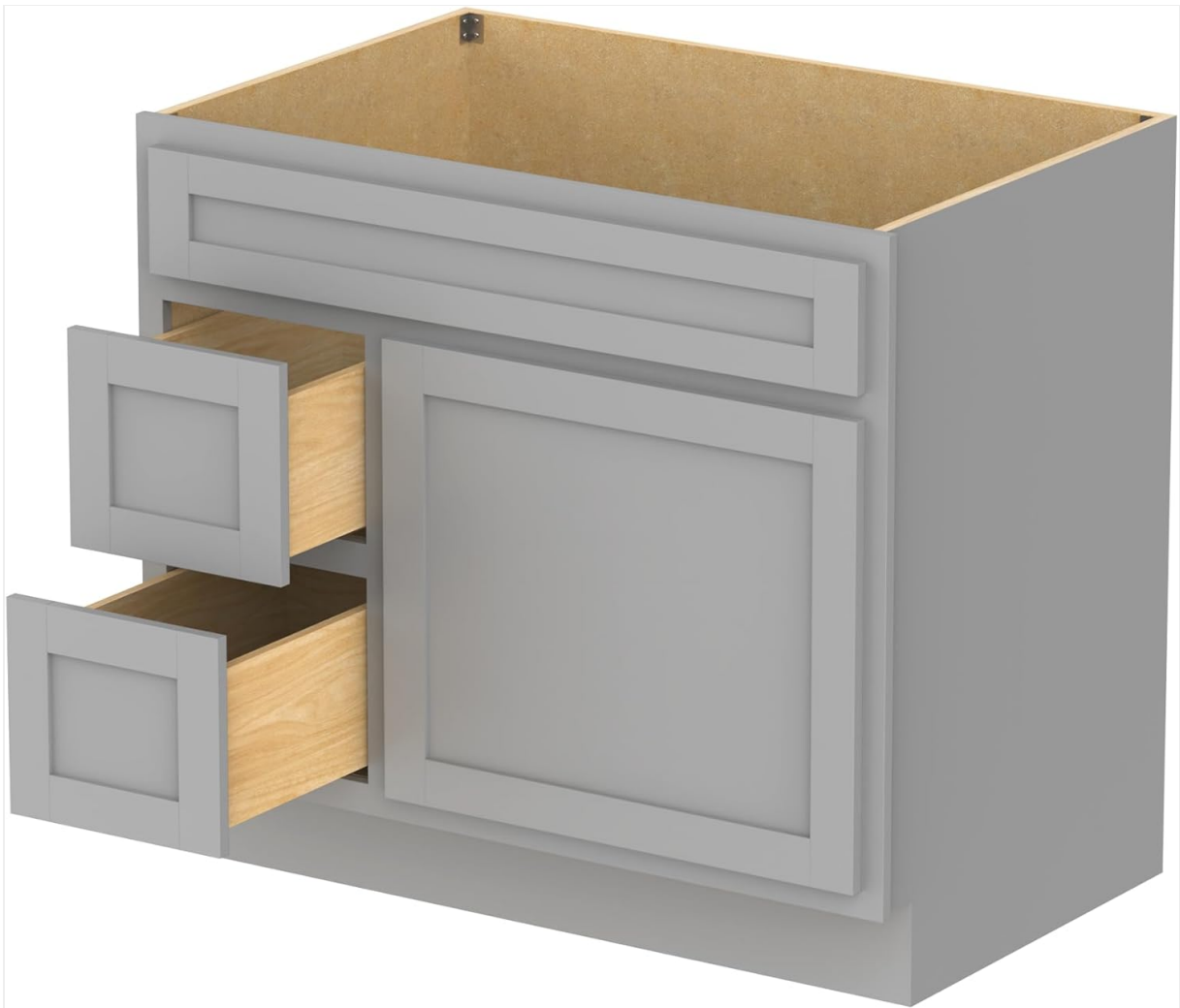
Image: The vanity cabinet with its two shaker-style drawers partially open, revealing the interior and drawer construction.