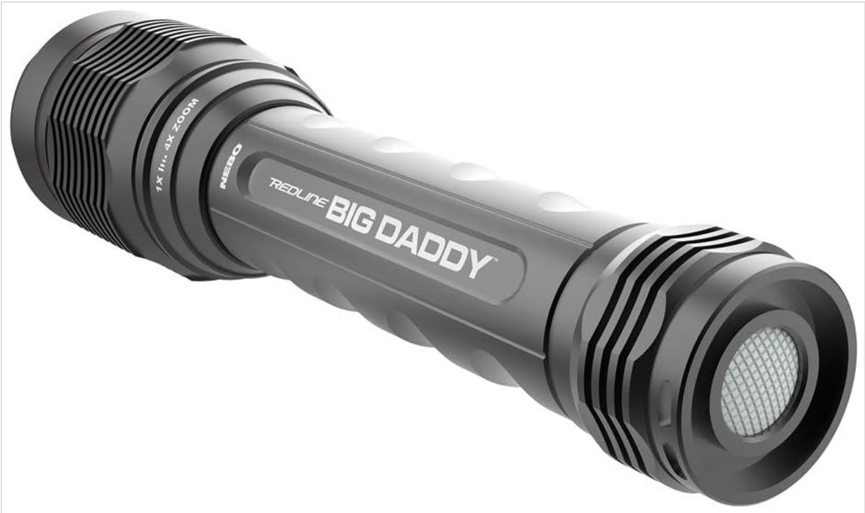
Figure 2: Angled view highlighting the 4x zoom markings and durable aluminum body.