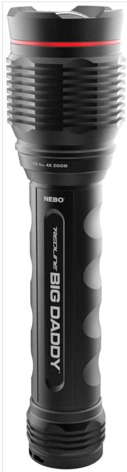
Figure 1: Front view of the NEBO Big Daddy 2000-Lumen Flashlight.