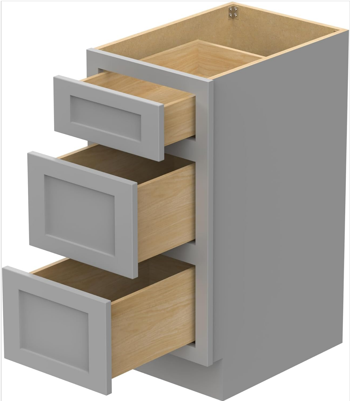
Image: The vanity cabinet with its three soft-closing drawers partially extended, showcasing the internal drawer boxes.