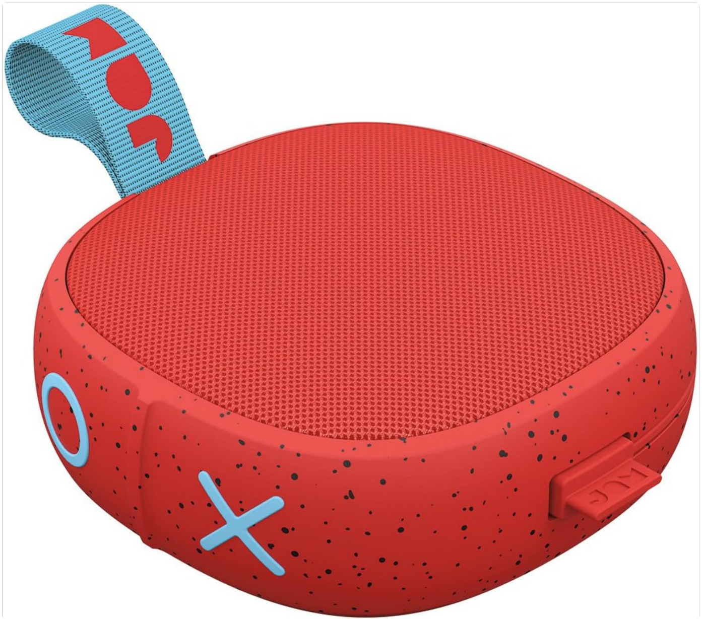
Figure 1: JAM Audio Hang Up Bluetooth Speaker (Red)

The JAM Audio Hang Up speaker is a compact, red portable Bluetooth speaker with a blue strap. It features a durable design, making it ideal for outdoor and wet environments.