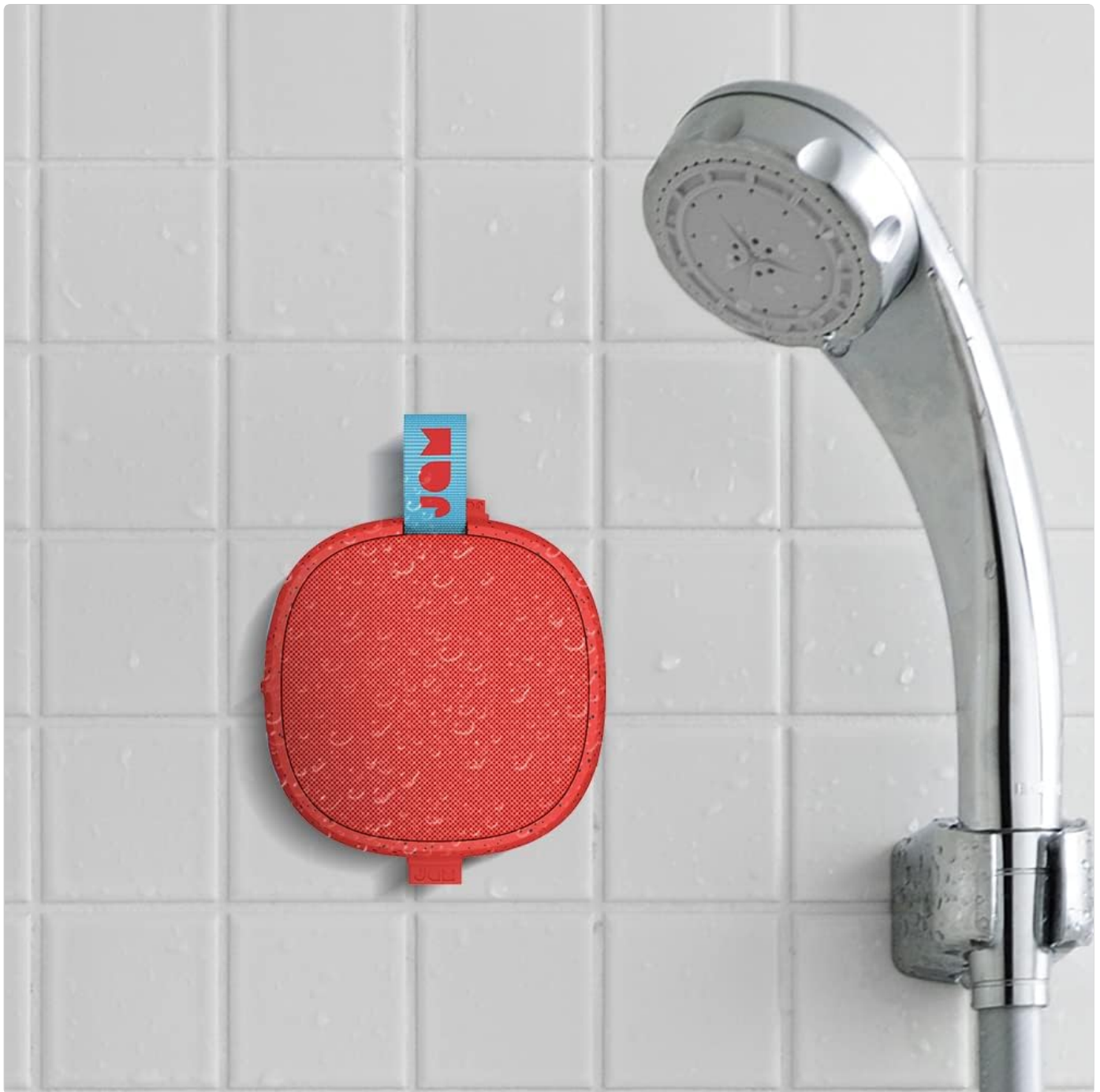
Figure 3: Speaker mounted on a shower wall

This image shows the JAM Audio Hang Up speaker in red, attached to a tiled shower wall, demonstrating its intended use in wet environments thanks to its stick pad and waterproof design.