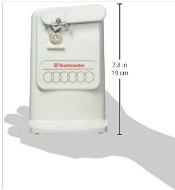
Image 2: Side view of the Toastmaster 498002 Electric Can Opener, illustrating its approximate height of 7.8 inches (19 cm).