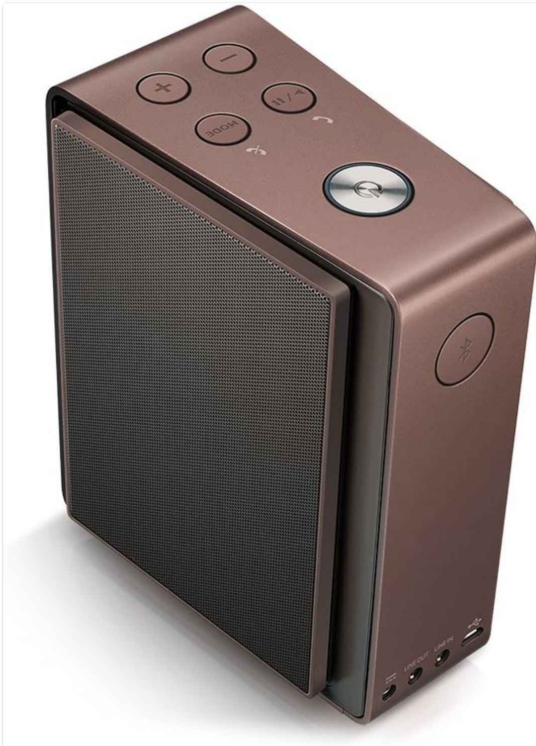
Image 4.4: The rear panel of the BenQ Trevolo 2 speaker, displaying its various input and output ports for connectivity.