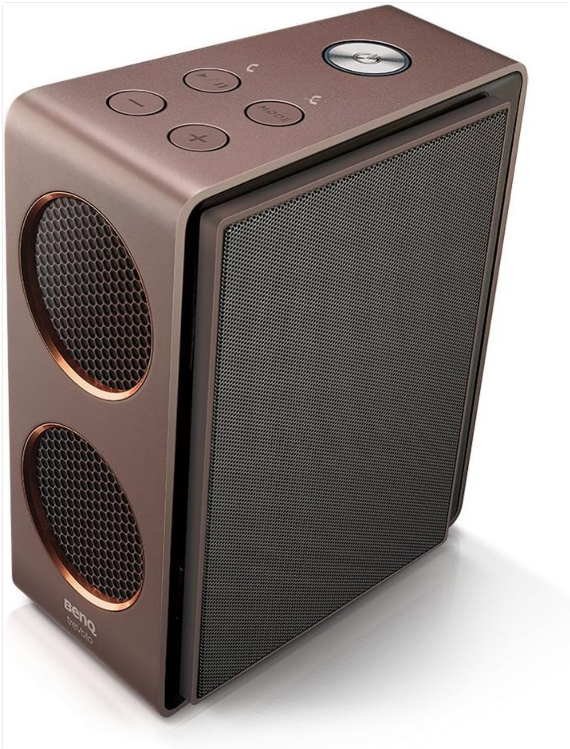
Image 4.2: The BenQ Trevolo 2 speaker with its electrostatic panels folded inwards, demonstrating its compact, closed configuration.