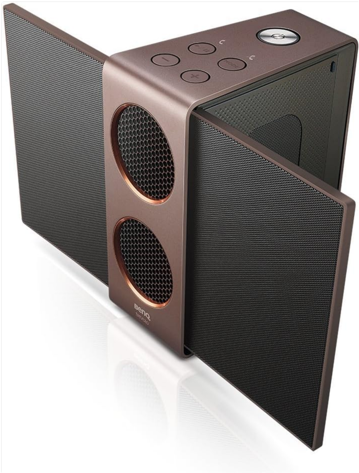
Image 4.1: The BenQ Trevolo 2 speaker with its side electrostatic panels fully extended, viewed from an angle to show its open configuration.