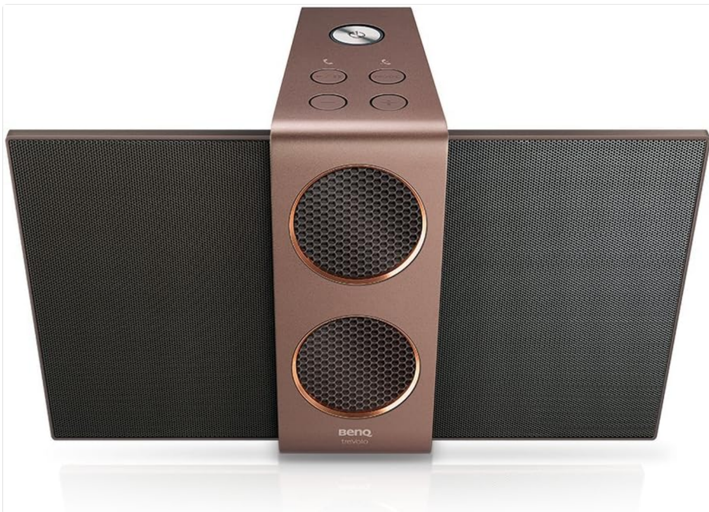
Image 1.1: BenQ Trevolo 2 speaker with its electrostatic wings extended, showcasing its unique design from a top-down perspective.

Thank you for choosing the BenQ Trevolo 2 Wireless Bluetooth Portable Electrostatic Speaker. This manual provides essential information for setting up, operating, maintaining, and troubleshooting your device. Please read this manual thoroughly before use to ensure optimal performance and longevity of your speaker.