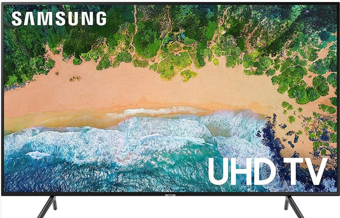
Figure 1: Front view of the Samsung 7 Series NU7100 55-inch 4K UHD Smart LED TV.

This manual provides essential information for the setup, operation, maintenance, and troubleshooting of your Samsung 7 Series NU7100 55-inch Flat 4K UHD Smart LED TV. This television offers a clear, vibrant 4K resolution picture and integrated smart features for an enhanced viewing experience.