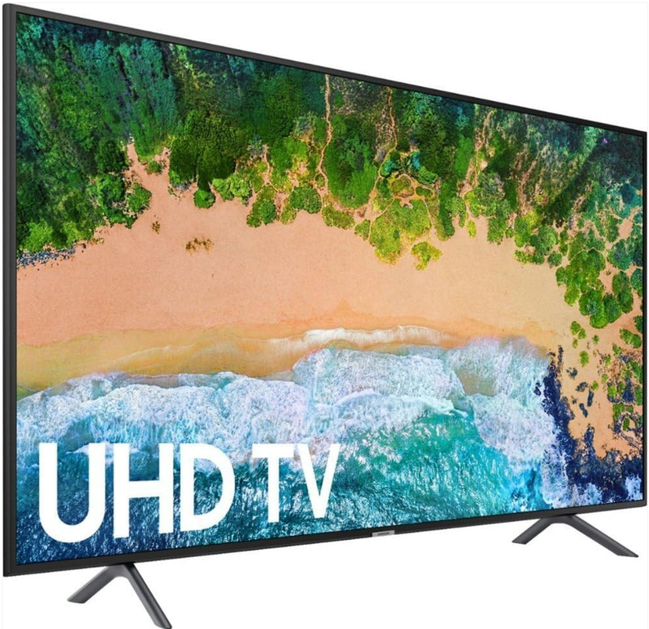
Figure 4.1: Front view of the Samsung 75NU7100 4K UHD Smart TV.

Carefully remove the TV from its packaging. It is recommended to have at least two people for handling due to the size and weight of the unit. Place the TV on a stable, flat surface or prepare for wall mounting.