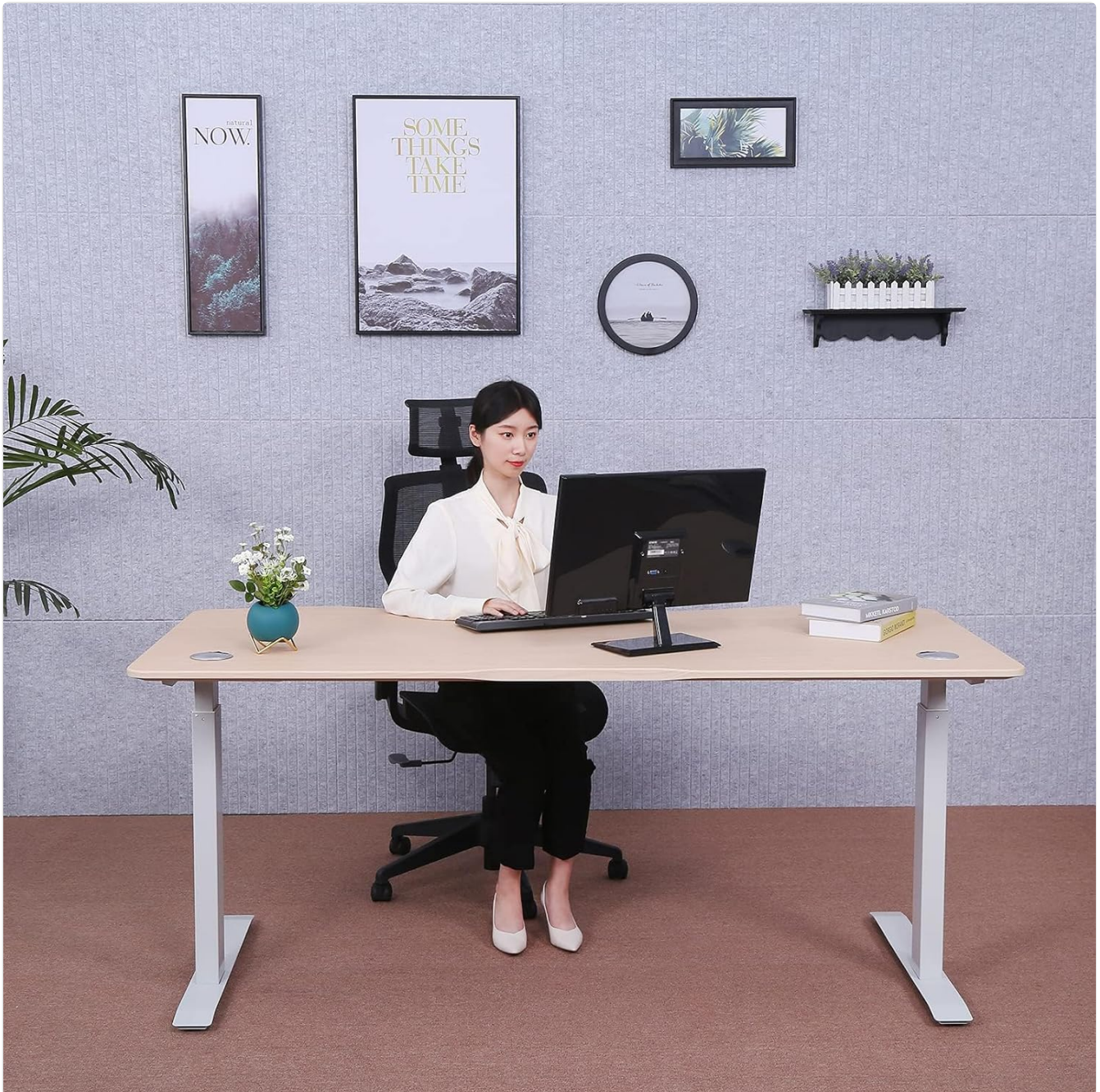
Figure 4: User seated at the desk, demonstrating a comfortable sitting position.