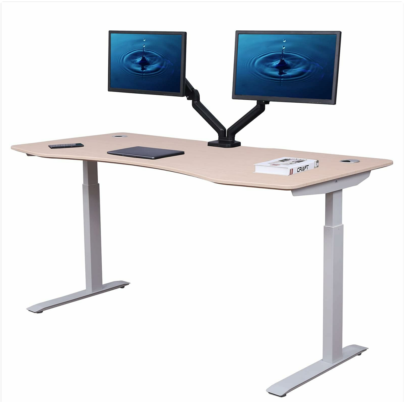
Figure 1: ApexDesk Elite Pro Series 60x27 Curved Oak Standing Desk in a home office setting.