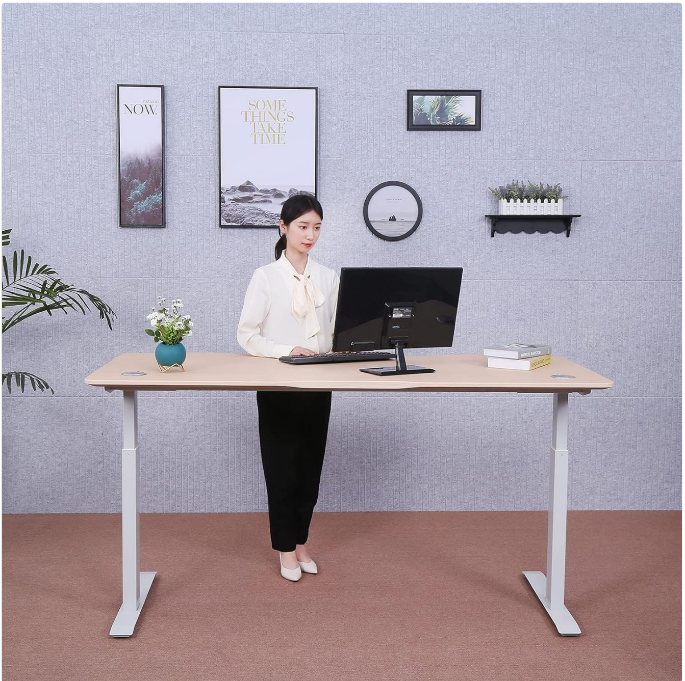
Figure 5: User standing at the desk, demonstrating an ergonomic standing position.