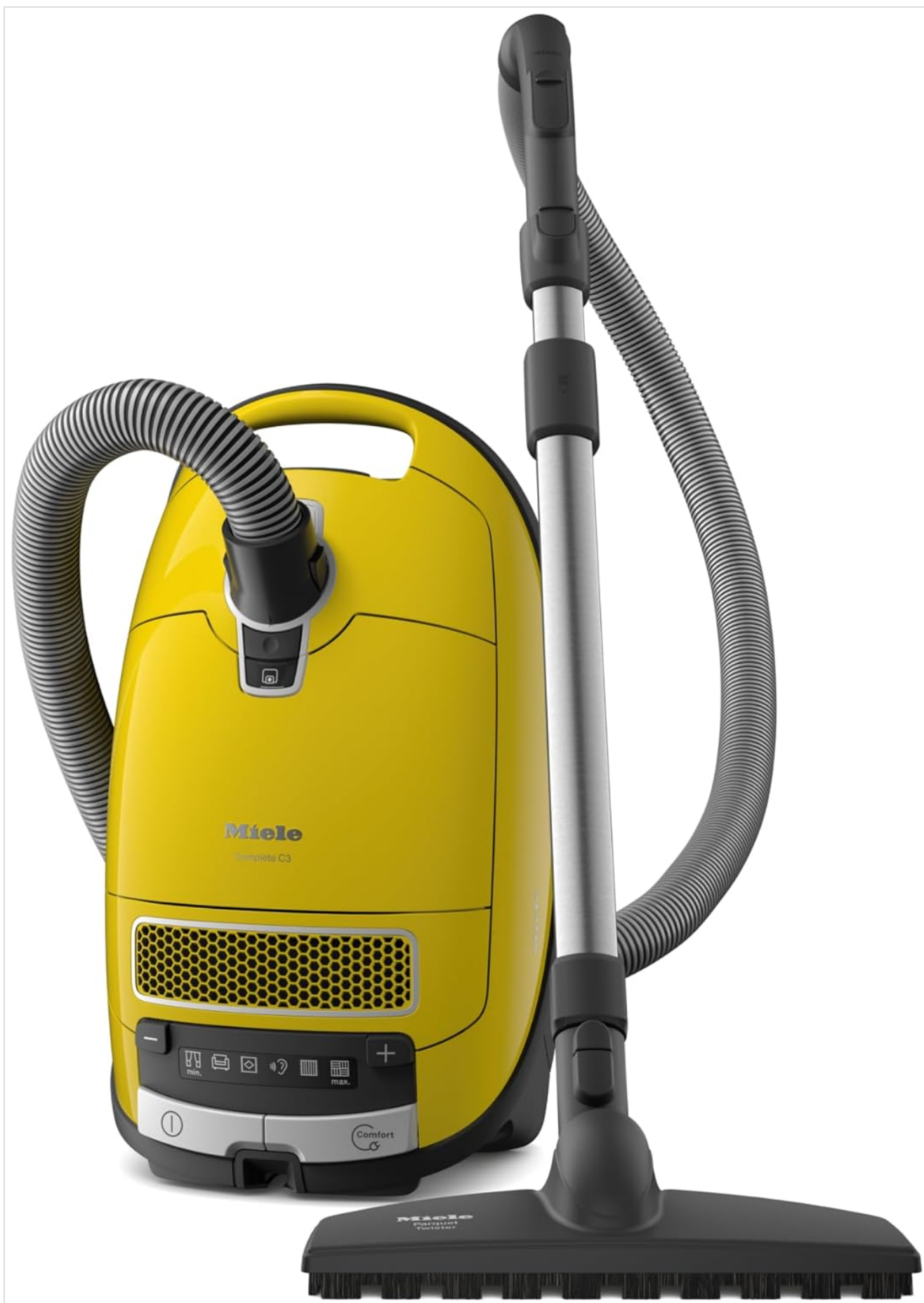
Figure 2.1: Fully assembled Miele Complete C3 Calima vacuum cleaner.