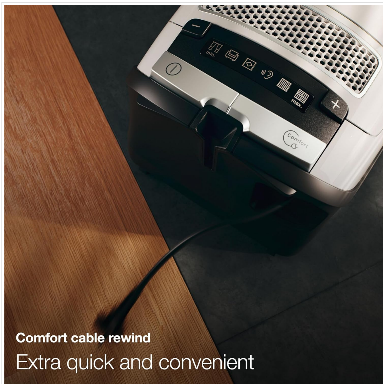
Figure 3.3: Automatic cord rewind for convenient storage.